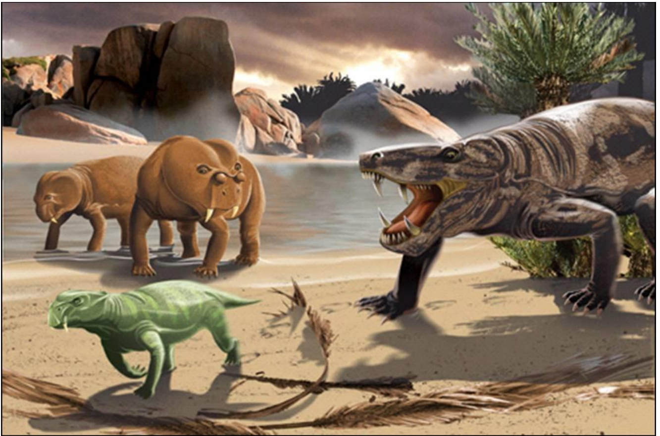
An artist's impression of life at the end of the Permian period. Dicynodon in the background, lystrosaurus in foreground and gorgonopsian on the right.

(Source http://science.nationalgeographic.com/science/prehistoric-world/permian.html )