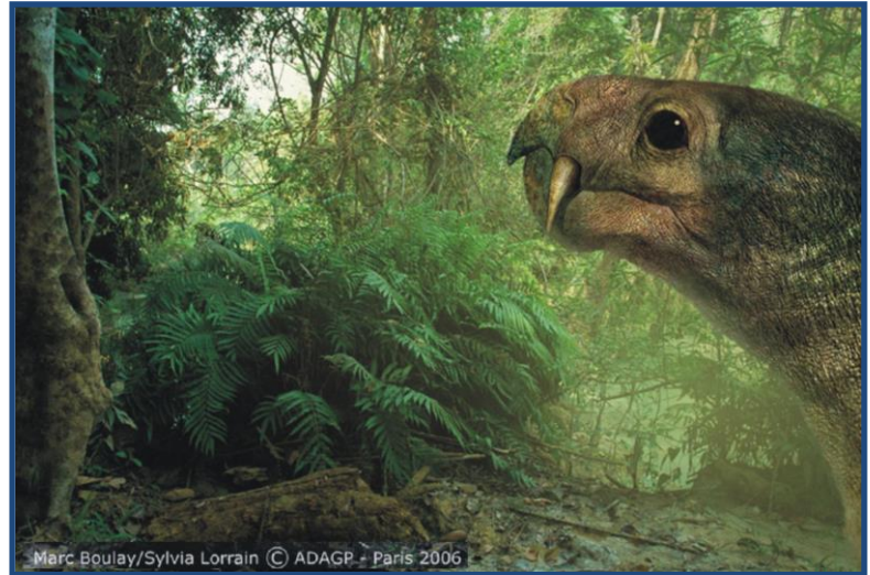
An artist's impression of life during the Permian Period

Later, other mammal-like reptiles known as therapsids found an internal solution to keeping warm - scientists suspect they eventually became warm-blooded, conserving heat generated through the breakdown of food.