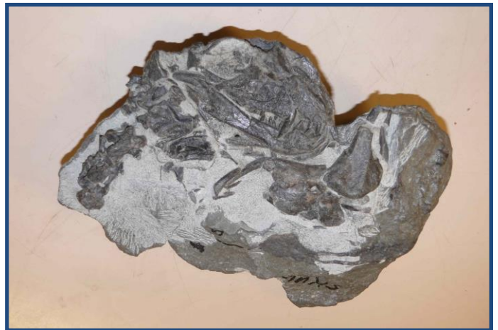
A baby gorgonopsian fossil before preparation ( left) and after preparation (right) at the Bloemfontein National Museum.