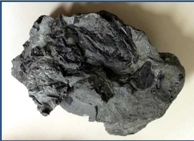
Possible dicynodon tusk unearthed at Ingula

The likelihood that new species of animal might be present has not been ruled out. The Museum appointed additional staff to prepare the large quantity of material from Ingula.