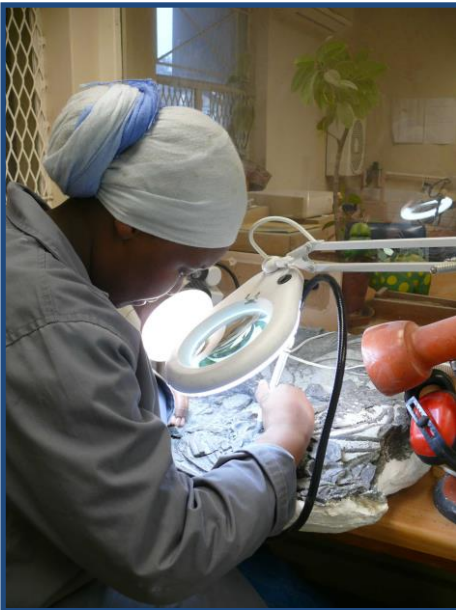
Careful preparation of Ingula's fossils at Bloemfontein National Museum

During February and early March 2010 excavation reached a layer which, it is believed, contained evidence of Dicynodon lacerticeps – a plant eating mammal-like reptile of the Permian period. It also contained plant fossils, predominantly smaller samples of the Glossopteris family. These were taken to the Bernard Price Institute for Paleontological Research at WITS University for further examination. Samples were sent to the National Museum in Bloemfontein for recording, curating and display.