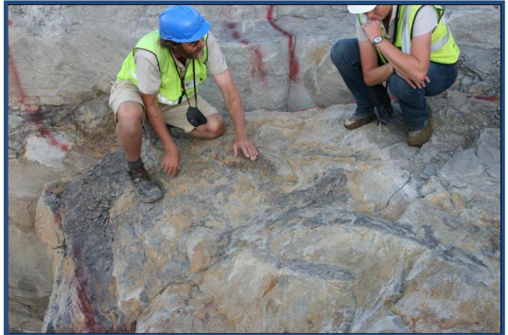
Dr Gideon Groenewald inspecting a fossilised tree still buried in the rock

Over sixteen kilometers of tunnels were excavated at Ingula. This was done by blasting and removing rock with big excavation machines. Were it not for the blasting, the fossils would never have been discovered. As layer by layer of rock was exposed, amazing fossils were exposed, revealing clues about what the area looked like millions of years ago.