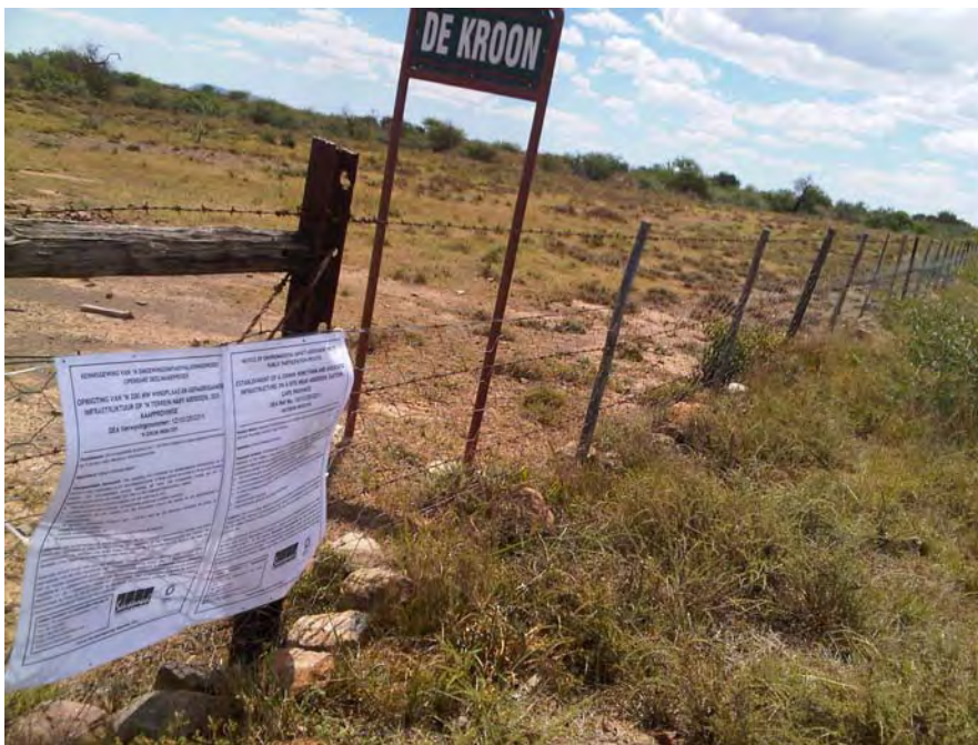
Gate of farm Lottrings Uitvlugt 1/95 (leads to other portions of study area) situated along the R0599 (gravel road between Aberdeen and Murraysburg)