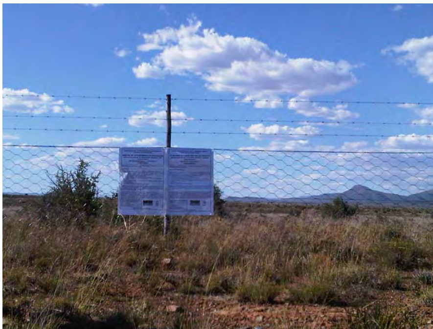
Farm portion along R61