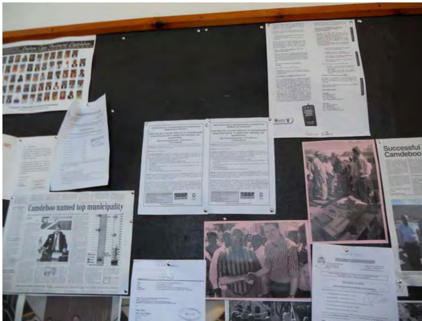
Notice board at Camdeboo Municipal Building (Mangaliso Robert Sobukwe Memorial Building)