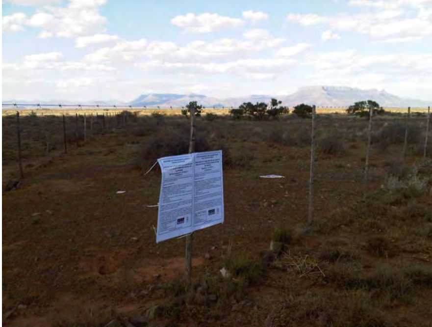
Along R61 on fence of RE of Portion 4 of Sambokdoorns 92