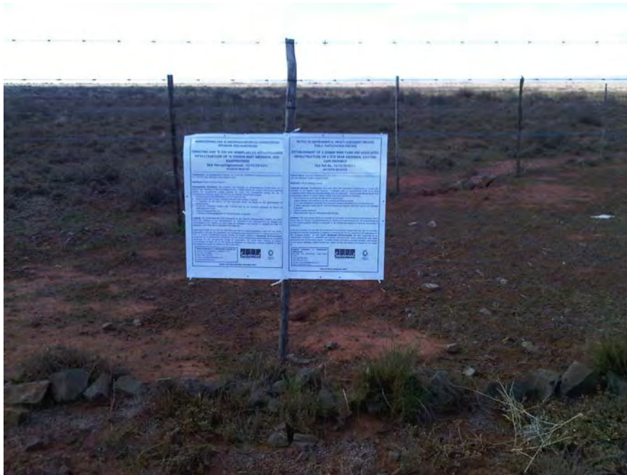
Farm portion along R61