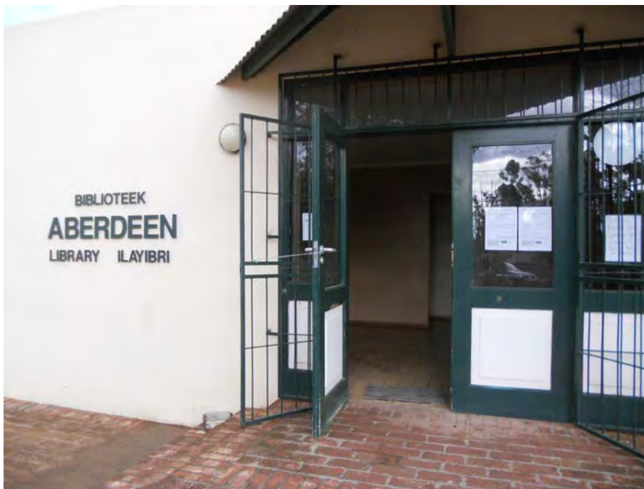
Site notices at the Aberdeen Library