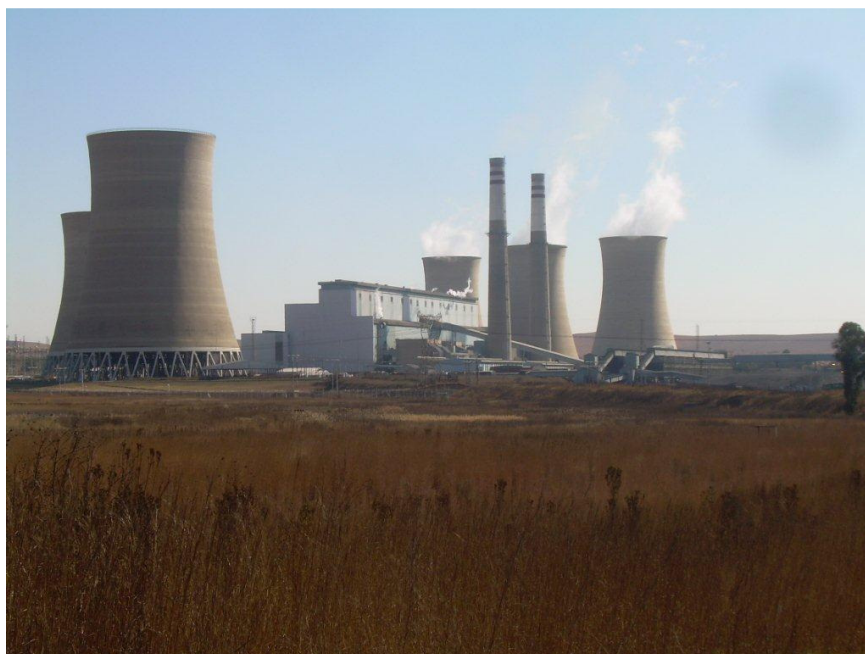
Figure 2: A photo of the power station from the southern side (looking North)