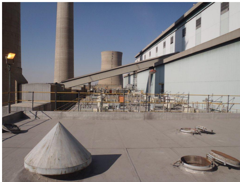
Figure 8: looking from along the top of the existing casings from Unit 1 (note the slight height difference between unit 1 and 2)