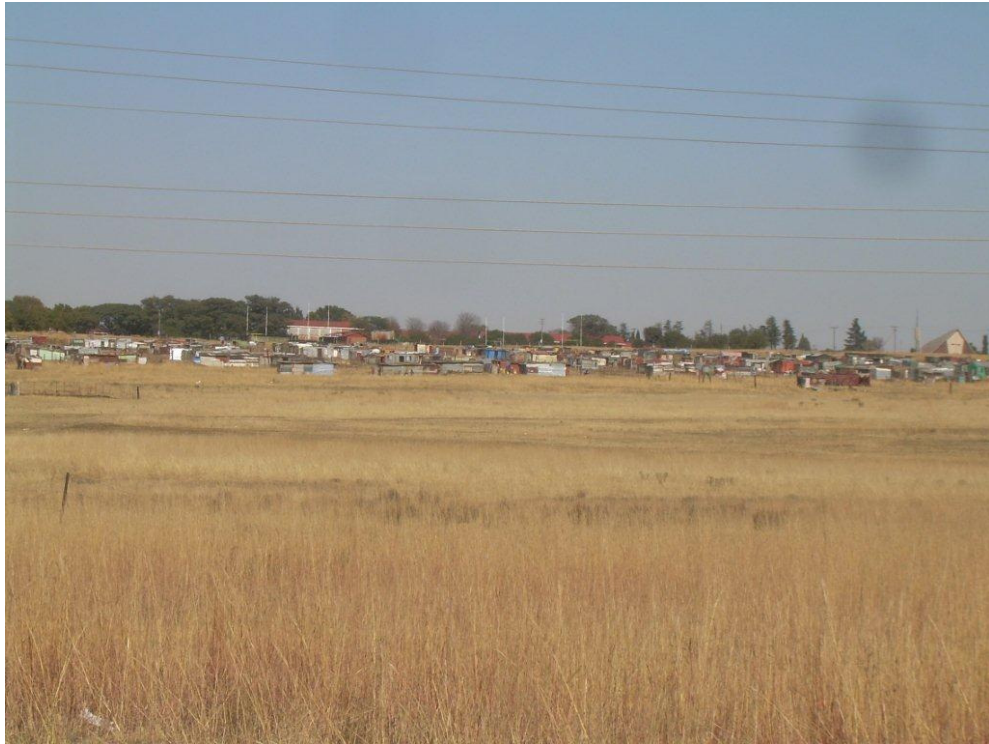
Figure 3: A settlement on the Southern side of the Power Station