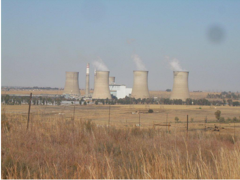
Figure 5: A photo of the power station from the northern side (looking South)