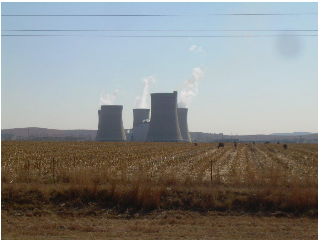
Figure 4: A photo of the power station from the western side (looking East)