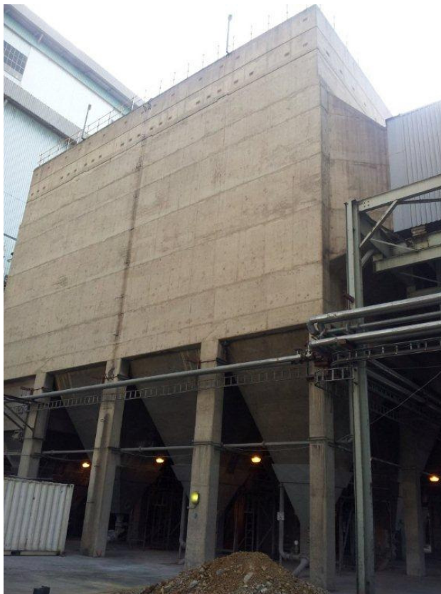
Figure 1: One of the existing ESP casings – The FFP retrofit will fit inside the existing casing with a height increase of 1.1 m