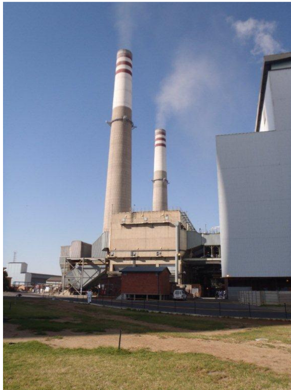
Figure 6: Unit 1 of the power station has already been retrofitted with a FFP