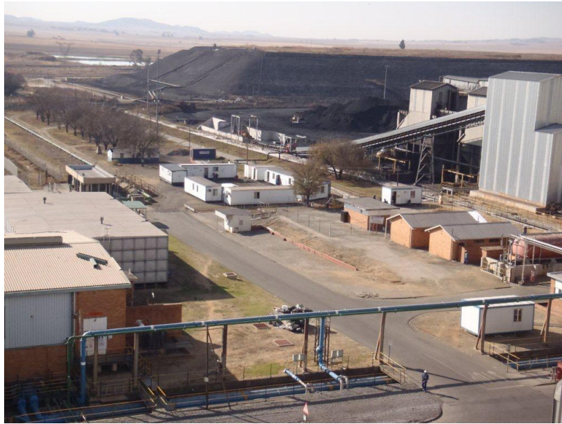
Figure 9: The view from the top of the Unit 1 FFP casing looking west