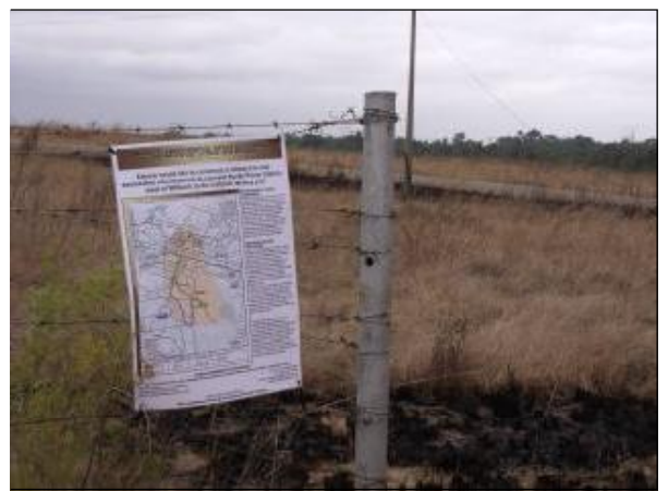
FIGURE 3-3: SITE NOTICE BOARDS WERE PUT UP IN THE STUDY AREA.

Notice boards were positioned at prominent localities during June 2009. These notice boards were placed along each alternative corridor, at conspicuous places and at various public places (Appendix G). Site notices were placed prominently to invite stakeholder participation (Figure 3-3).