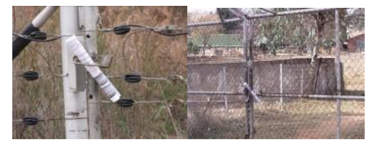
FIGURE 3-2: BACKGROUND INFORMATION DOCUMENTS WERE DISTRIBUTED IN THE AREA.

• Distribution of a letter of invitation to become involved, addressed to individuals and organisations, accompanied by a Background Information Document (BID) containing details of the proposed project, including a map of the project area and the alternative corridors, and a registration/comment sheet (Figure 3-2 and Appendix F). The BID and registration/comment sheet was distributed to stakeholders on the database, but the project team also visited the homesteads of landowners and occupiers in the project study area to hand out the documents.