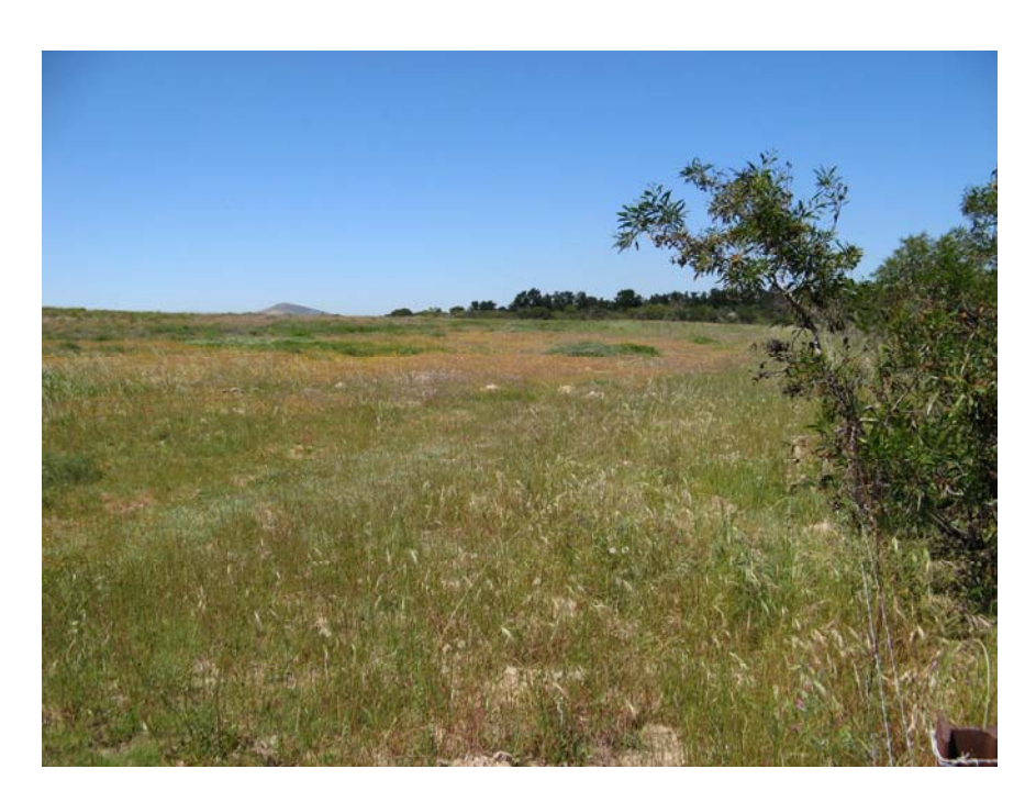
Plate 1: View of typical part of Alternative C, showing fallow agricultural lands and dense alien vegetation (Port Jackson – Acacia saligna ) adjacent to the fields. These areas are of Very Low botanical sensitivity.

Over 90% of this route is of Low or Very Low regional botanical sensitivity (see Figure 1). No rare or threatened plant species are likely to persist in viable or regionally significant numbers in these areas, and the vegetation has been so disturbed that it now supports less than 10% of its original plant diversity (see Plate 1). Alien grasses and herbs dominate, along with woody invasives such as Acacia saligna . Typical alien grasses include Avena (wild oats), Lolium (ryegrass), Bromus pectinatus (ripgut brome) and common alien herbs are Trifolium (clover), Erodium moschatum (cranesbill), Echium plantagineum (Patterson's curse) and Raphanus rapistrum (wildemostert).