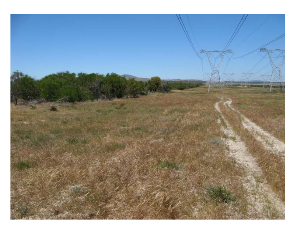
Plate 3: View of bushcut servitude on Koeberg – Stikland line (Alternative A; looking towards Omega site), with alien grasses dominant and Medium sensitivity vegetation remaining, with dense invasive Acacia saligna outside the servitude.

About half of this route is considered to be botanically sensitive, in that it passes through vegetation that is still in good or moderate condition, or across wetlands. The bulk of the sensitive vegetation occurs in areas 4 and 5 (Figure 1). Area 4 can be regarded as being of High sensitivity (rare species likely), and Area 5 as being of Medium sensitivity. In some places the servitude has been heavily bushcut. This has reduced the species diversity and eliminated many of the rarer species so that these areas are now of Medium sensitivity (see Plate 3), with higher sensitivity vegetation sometimes still present in the immediately adjacent unbuschcut areas, although, as in Plate 3, the adjacent areas may be heavily invaded by alien Acacia saligna .