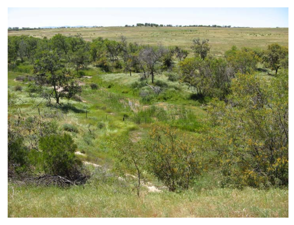
Plate 2: View of Donkergat river crossing (Area 2) from the railway bridge, showing narrow seasonal channel, invasive Acacia saligna (trees), and old fallow lands of Very Low sensitivity beyond.

Three sensitive areas have been identified along the route – the southern two being wetlands. Area 1 is the crossing of the Klein Zouterivier, and Area 2 is the Donkergat River crossing. Both are less than 200m wide, with the actual channels and floodplain being less than 80m wide.