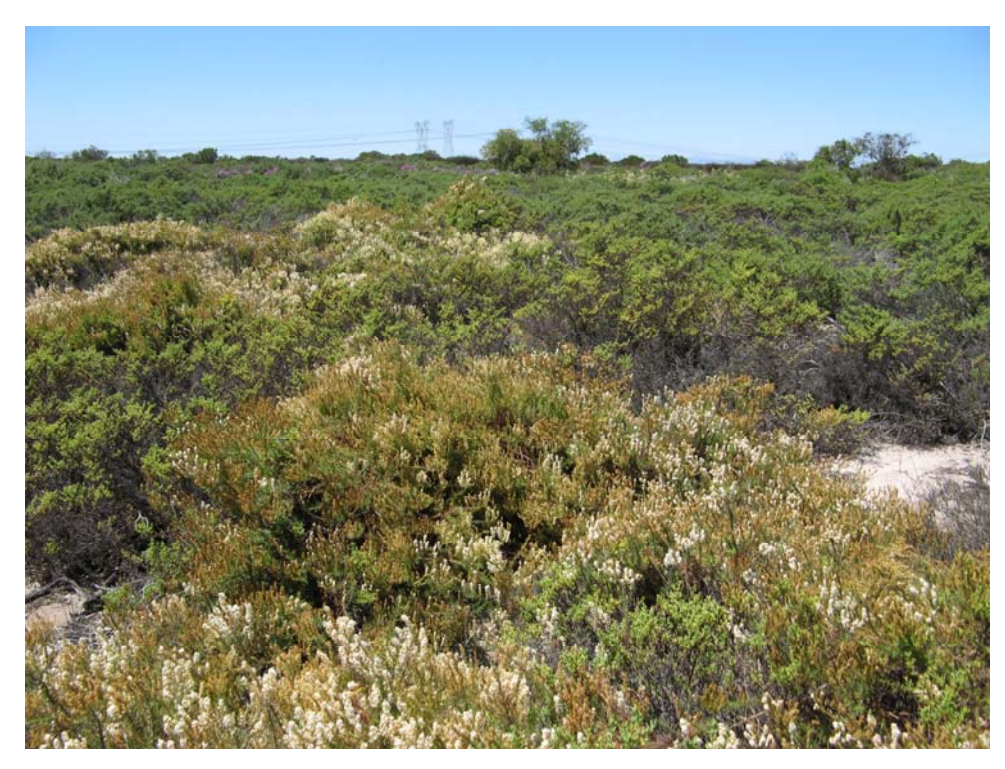
Plate 4: View of High sensitivity vegetation (ecotonal Cape Flats Dune Strandveld and Atlantis Sand Fynbos) near Koeberg. Note the difference between this and the bushcut servitude area in Plate 3.

Most of area 5 was recently burnt and has not yet fully recovered, and it is thus difficult to interpret the vegetation but it would appear that species diversity is relatively low and sensitivity is probably Medium on a regional scale. There is a moderate chance of rare species being present. Alien invasive vegetation is a prominent feature of the area.