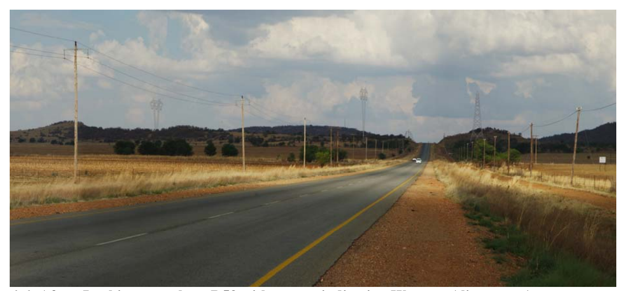
6-6: After: Looking east along R53 with towers indicating Western Alignment 1