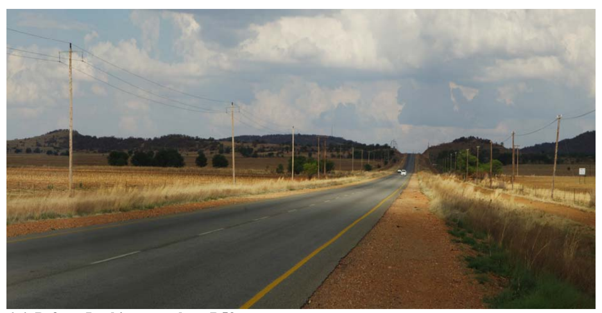
6-6: Before: Looking east along R53