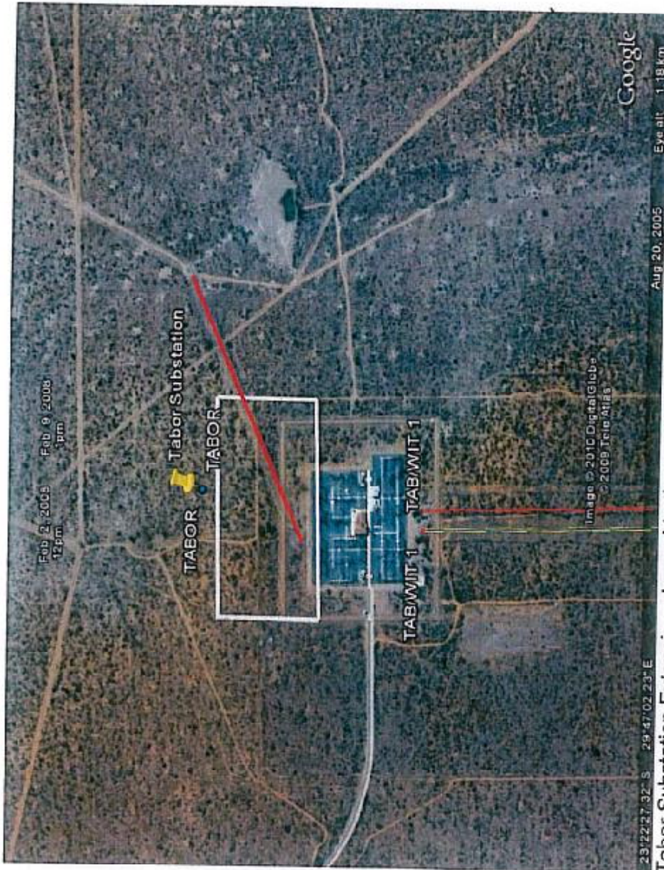
Tabor Substation Extension planned to the north of the existing substation. A white polygon indicating an approximate study area. The extension is required to accommodate the new 400Kv/132 transformer and a new 400kV line.