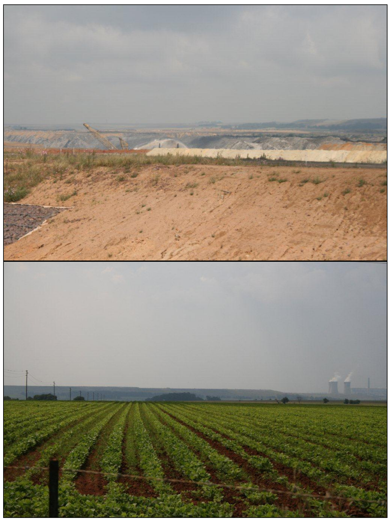
Figure 10.2: The agricultural and mining activities that form the greater part of the study area