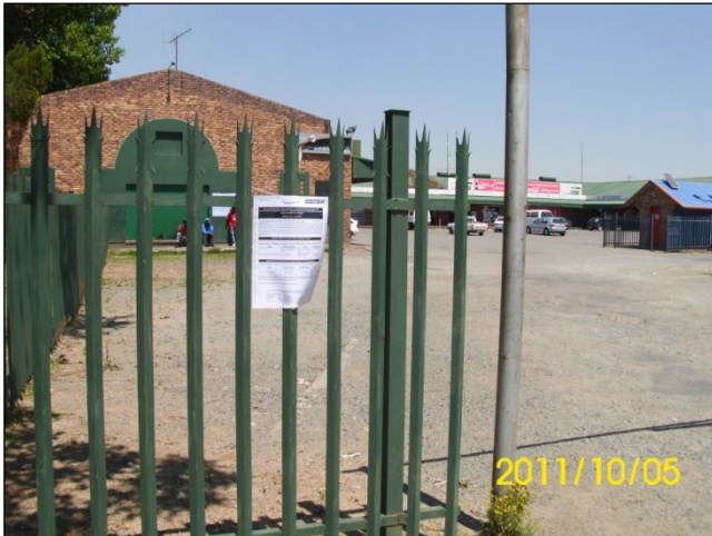
Figure 17: Main Entrance, Village Supermarket