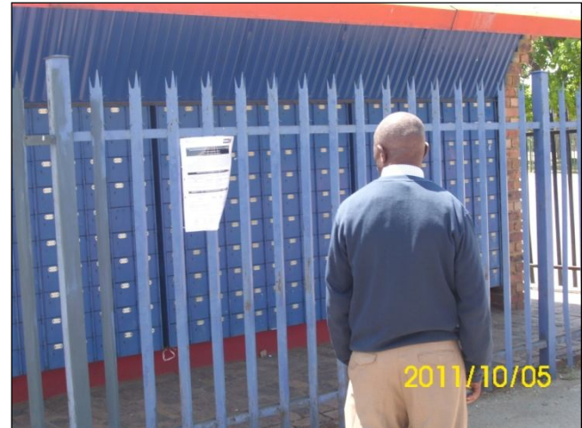
Figure 18: Post Boxes, Grootvlei