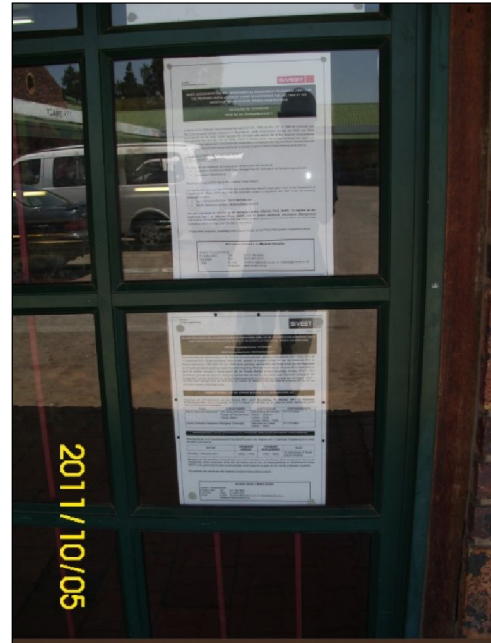
Figure 16: Village Butchery