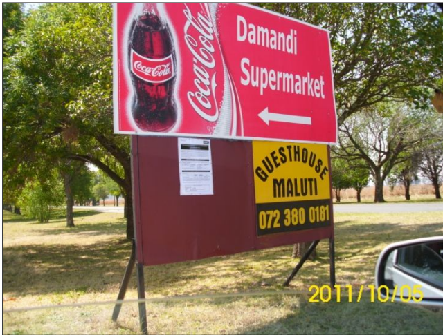
Figure 11: Village Main Entrance