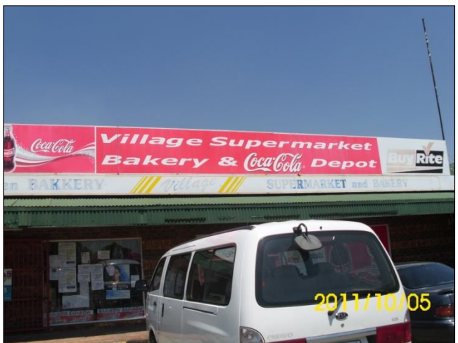
Figure 14: Village Supermarket