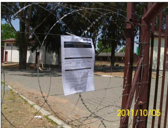
Figure 13: Tshepheha School