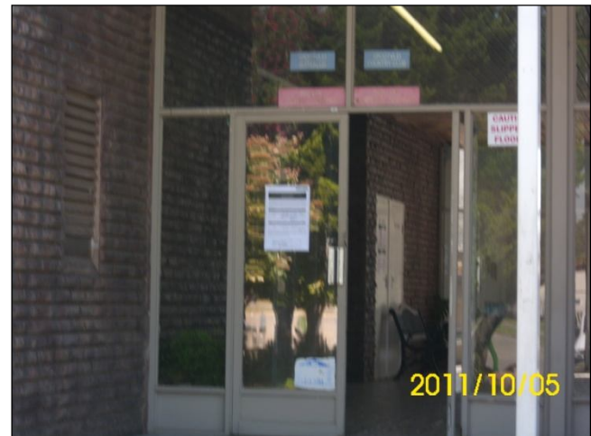
Figure 4: Old Eskom Hall