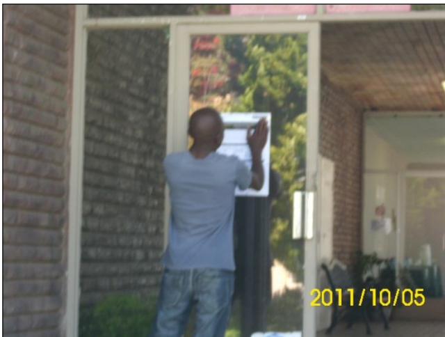
Figure 3: Old Eskom Hall