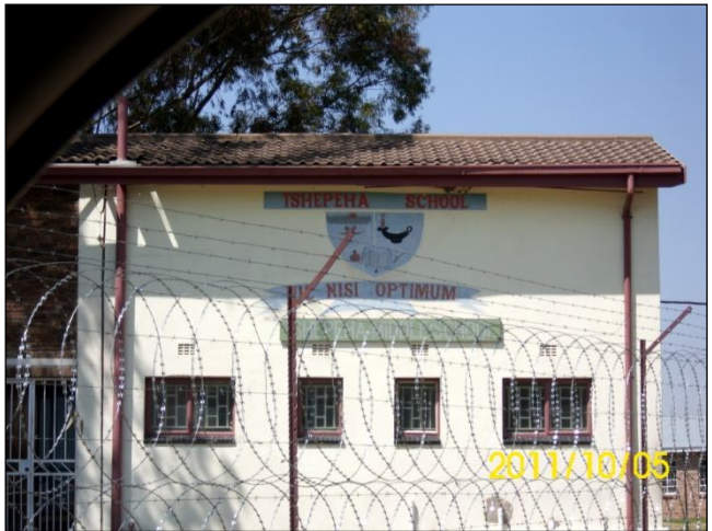
Figure 12: Tshepheha School