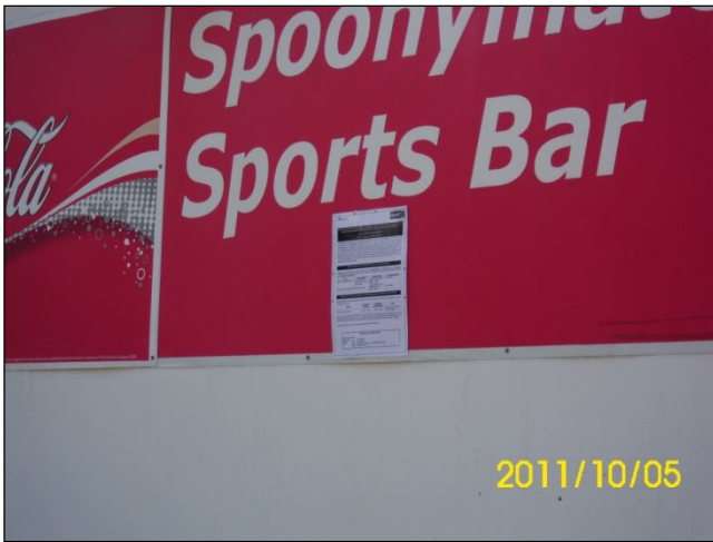
Figure 7: Damani Super Supermarket