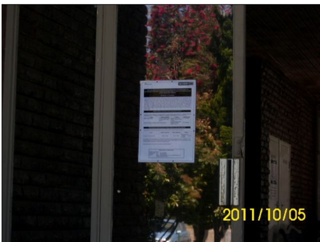
Figure 5: Old Eskom Hall