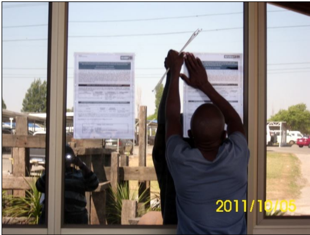
Figure 1: Reception – Eskom Grootblei Power Station