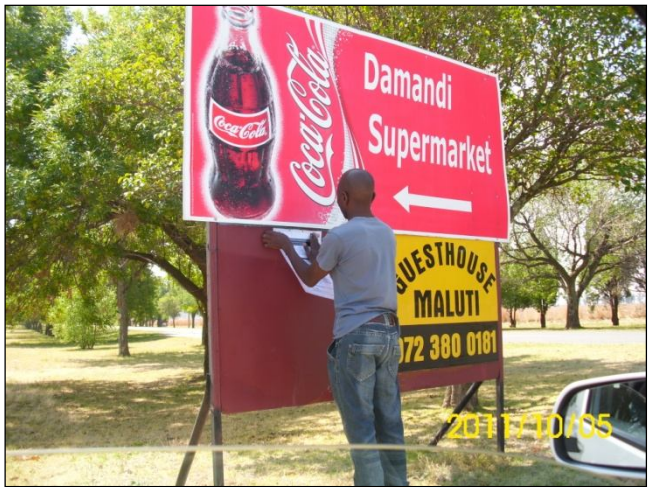
Figure 8: Village Main Entrance