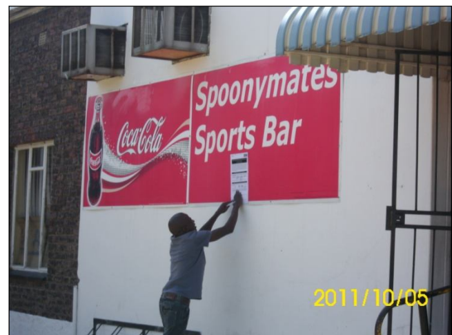
Figure 6: Damandi Supermarket