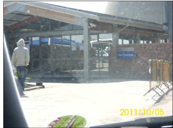
Figure 2: Reception – Eskom Grootblei Power Station