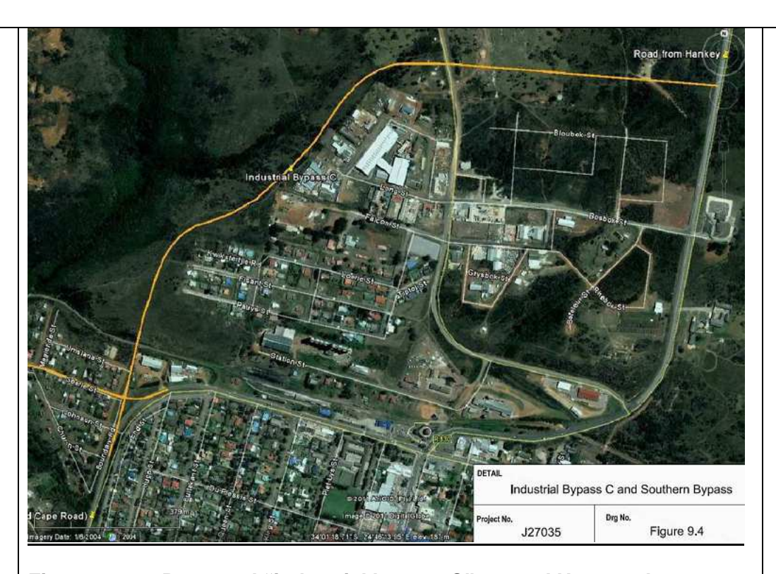
Figure 7-16: Proposed "industrial bypass C" around Humansdorp

Road (R330) to the north of the Bosbok Street intersection and reconnects with Old Cape Road, bypassing the entire Kruisfontein area. The proposed industrial bypass will cross the railway line before it reaches Old Cape Road. The rail traffic experienced at the railway line is light and therefore considered insignificant. A crossing with traffic signals or booms will be sufficient to ensure safety between conflicting vehicle and railway traffic.