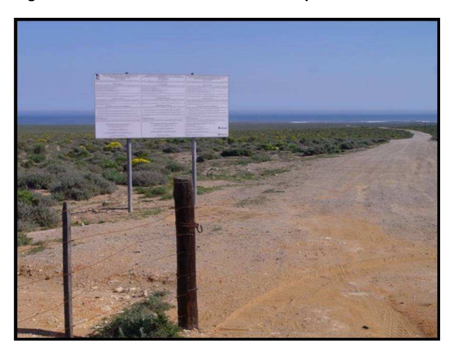
Figure 7-4: On site Notice at Brazil, Northern Cape