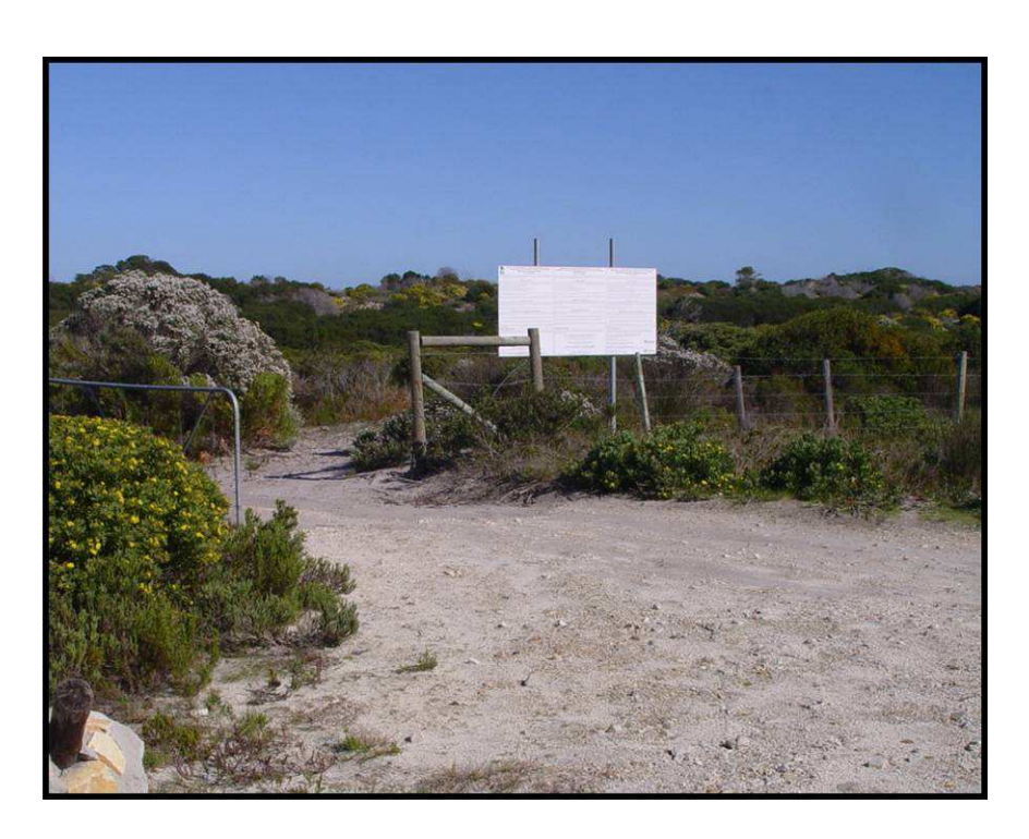
Figure 7-3: On site Notice at Bantamsklip