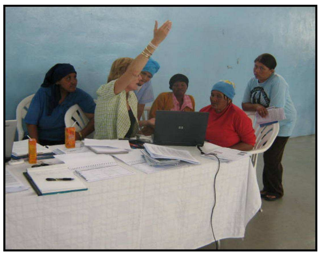
Figure 7-13: Discussion session with Hondeklipbaai residents at a Public Open Day