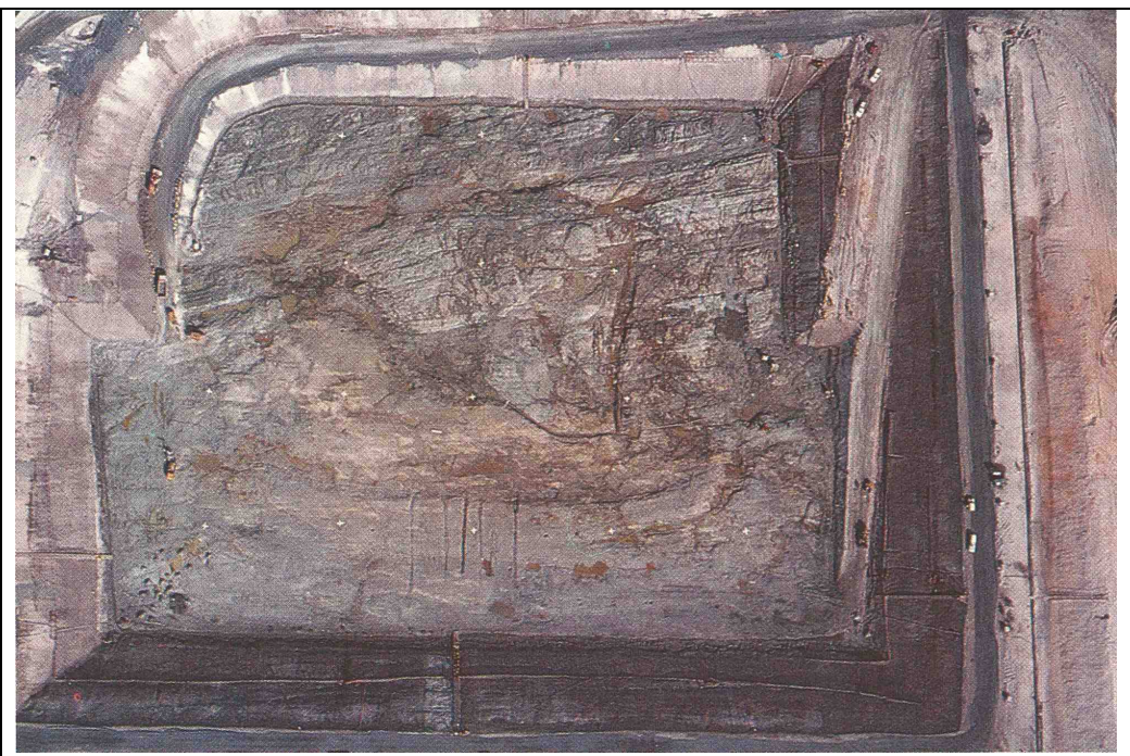
Figure 7-14: Aerial view of the KNPS excavation during construction

23. Further seismic studies in terms of the SSHAC process that may change the EIA's seismic findings