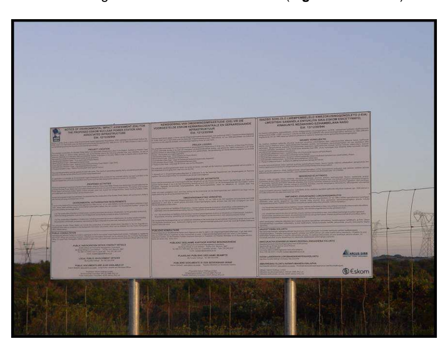
Figure 7-2: On site Notice at Duynefontein