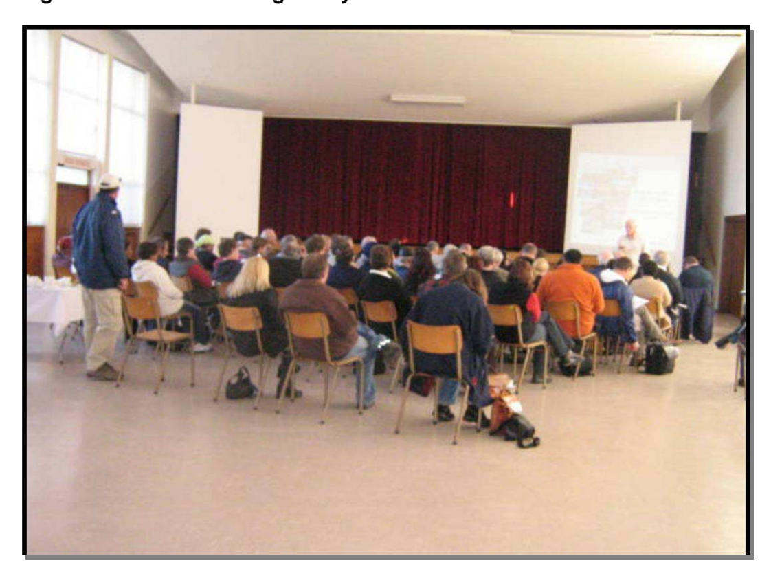
Figure 7-11: Public Meeting at Gansbaai