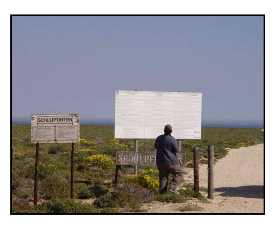
Figure 7-5: On site Notice at Schulpfontein, Northern Cape