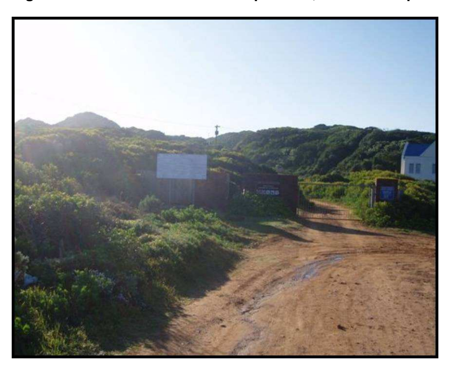
Figure 7-6: On Site Notice at Thyspunt site, Eastern Cape

Since the announcement of the project in May 2007, the EIA process has had extensive media coverage (Media Inserts 1 and 2). Several media articles have also encouraged the public to register as I&APs by publishing the contact details of the GIBB Public Participation Office.