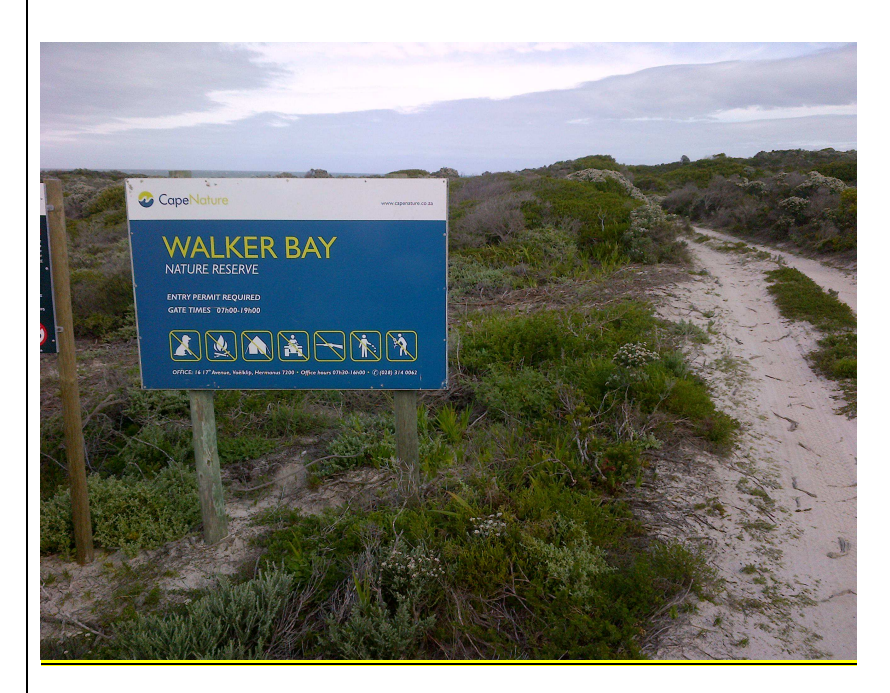
Figure 7-15: Signage for "Walker Bay Nature Reserve", which is in fact not a nature reserve, but state land administered by CapeNature

The portion of the Bantamsklip site owned by Eskom has been registered as a Natural Heritage Site with the Department of Environment Affairs (refer to item 30 regarding terminology for Natural Heritage Sites). The farm Groot Hagelkraal 318 to the north of the R43 is a registered Private Nature Reserve and a Natural Heritage Site. The central portion of coastal part of the site is owned by Eskom, with two coastal portions on either side being state-owned land administered by CapeNature. The portions of state-owned land are not officially declared as nature reserves, but have become popularly and erroneously known as such because Cape Nature manages these properties on behalf of the state and has erected nature reserve signage (which it is not a nature reserve on these sites (Figure 7-15).