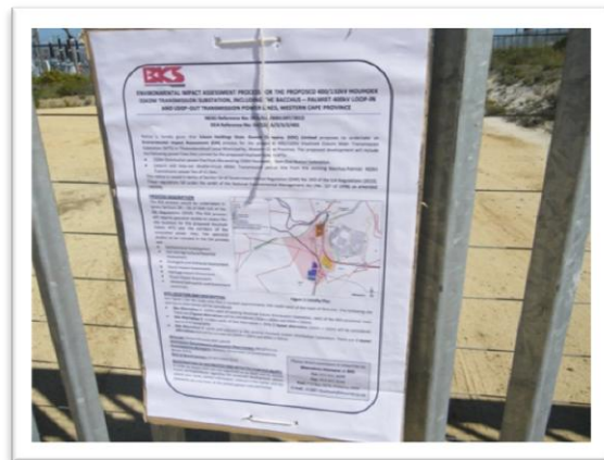
Figure 1: At the Gate of the Houwhoek Substation