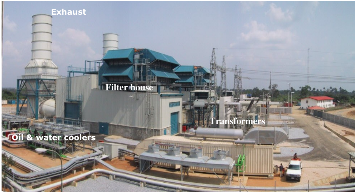
FIGURE 3 Example of two OCGT power generation units