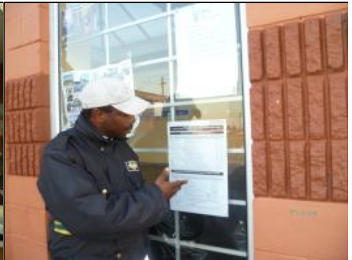
Figure 10: Elukhanyisweni Library, KwaNobuhle