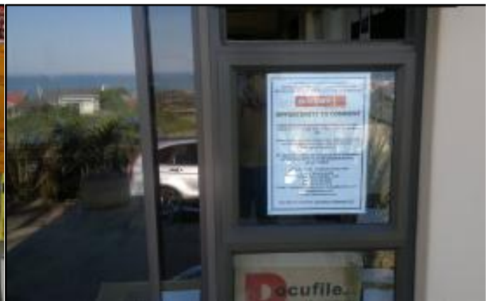
Figure 4: Oyster Bay Café