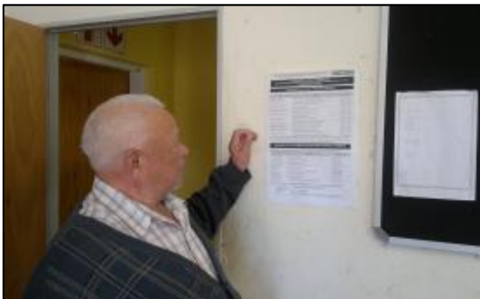
Figure 5: Kamesh Councillors Office