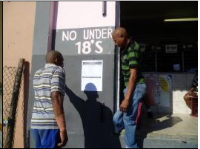
Figure 14: Mama's Liquor Store, Loeries Hill