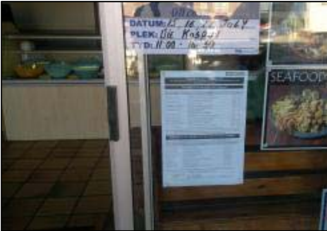
Figure 7: Die Vismandjie, Jeffrey's Bay