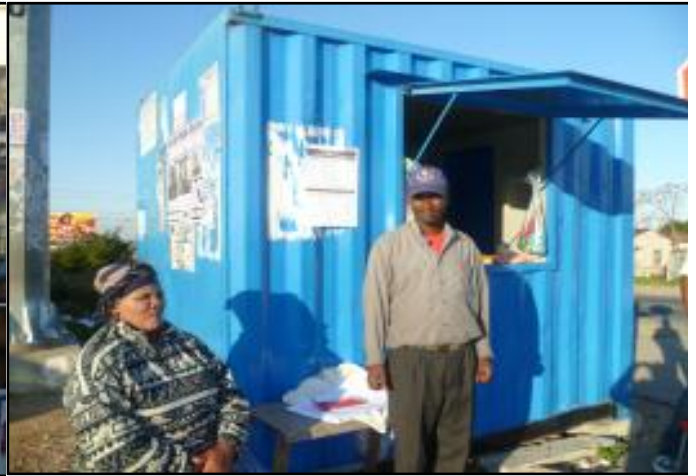
Figure 8: Mobile Telephone Booth, Motherwell