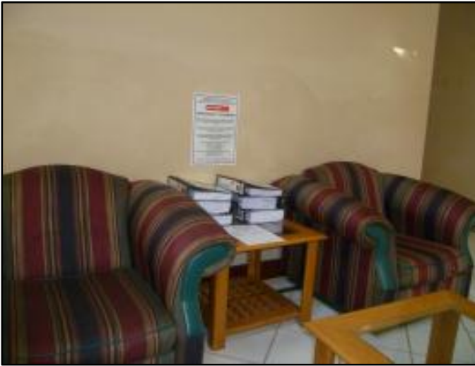
Figure 13: Thornhill Hotel