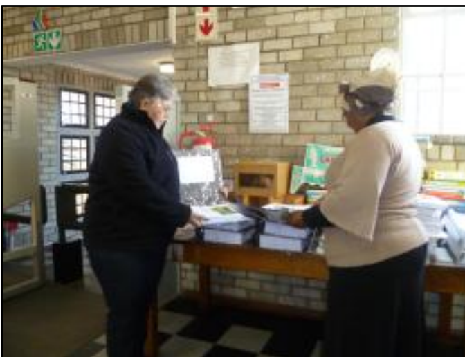
Figure 11: Motherwell Library