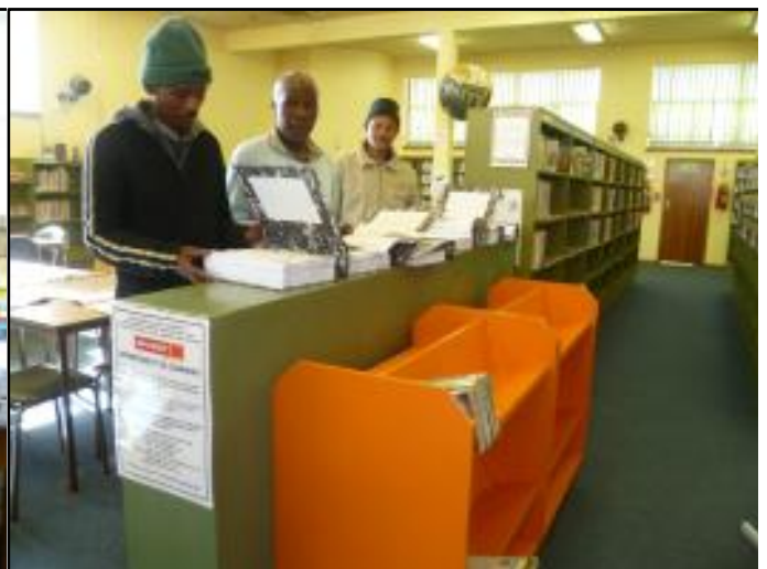
Figure 12: Alan Ridge Library