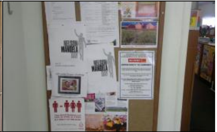
Figure 2: Humansdorp Library