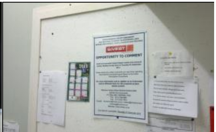
Figure 6: St. Francis Library