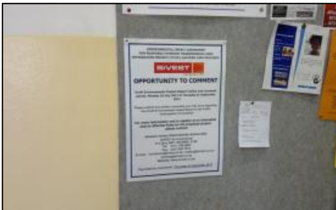
Figure 3: Jeffries Library