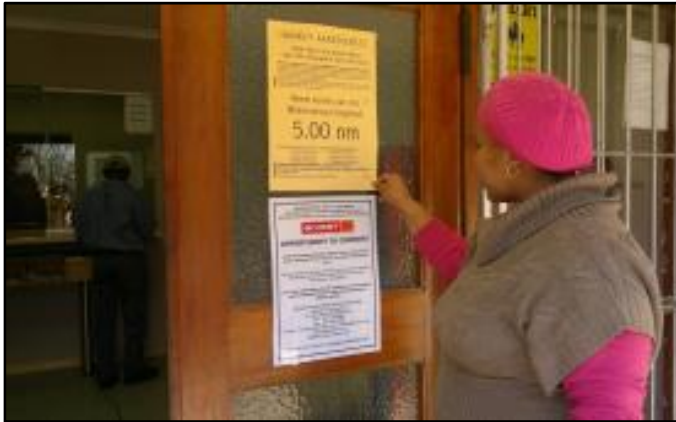
Figure 1: Hankey Library