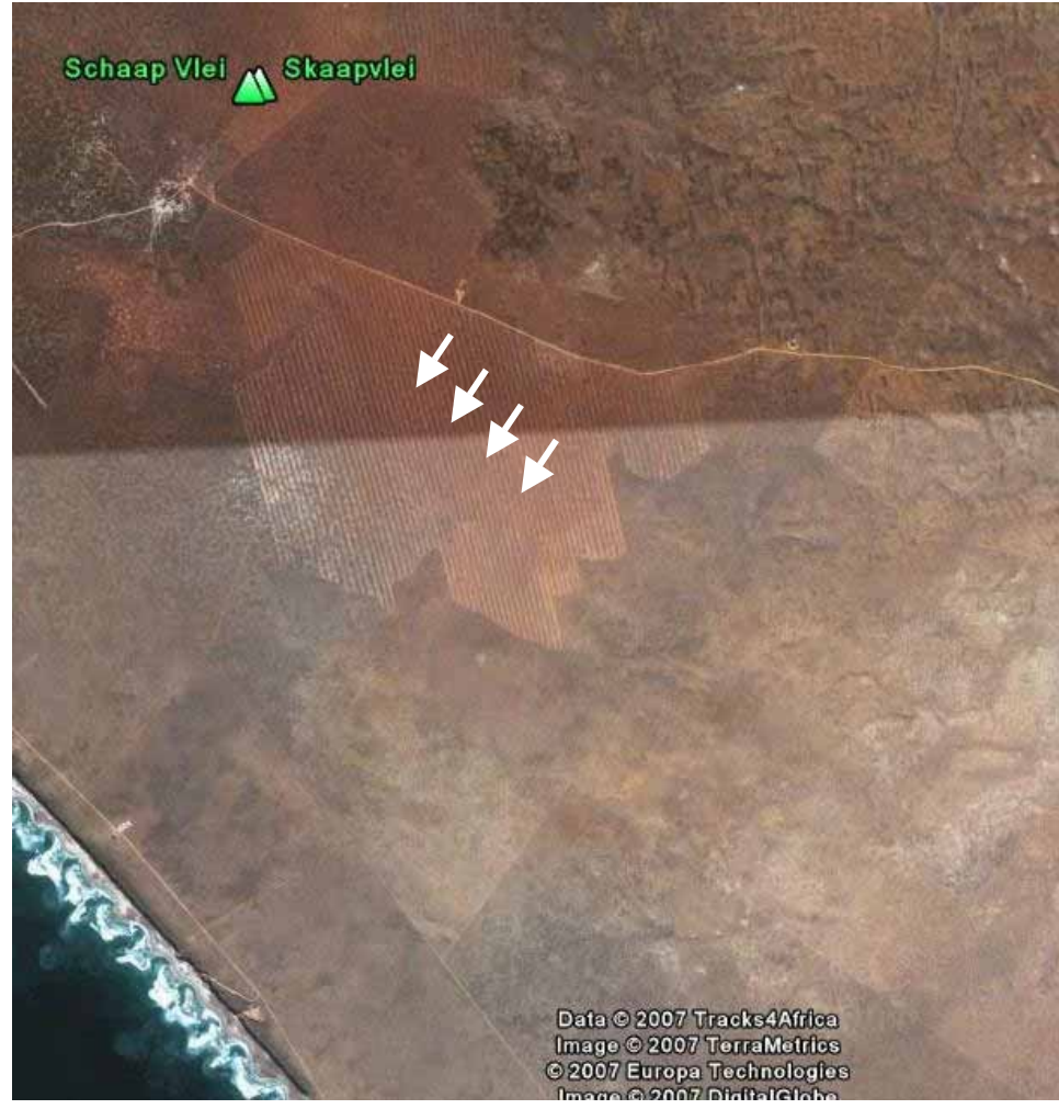
Figure 2. The north-eastern part of the proposed site has been transformed for cultivation.