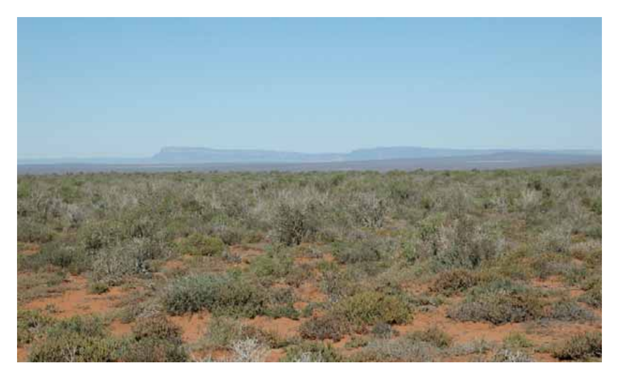
Figure 3. Namaqualand Strandveld vegetation in the study area.