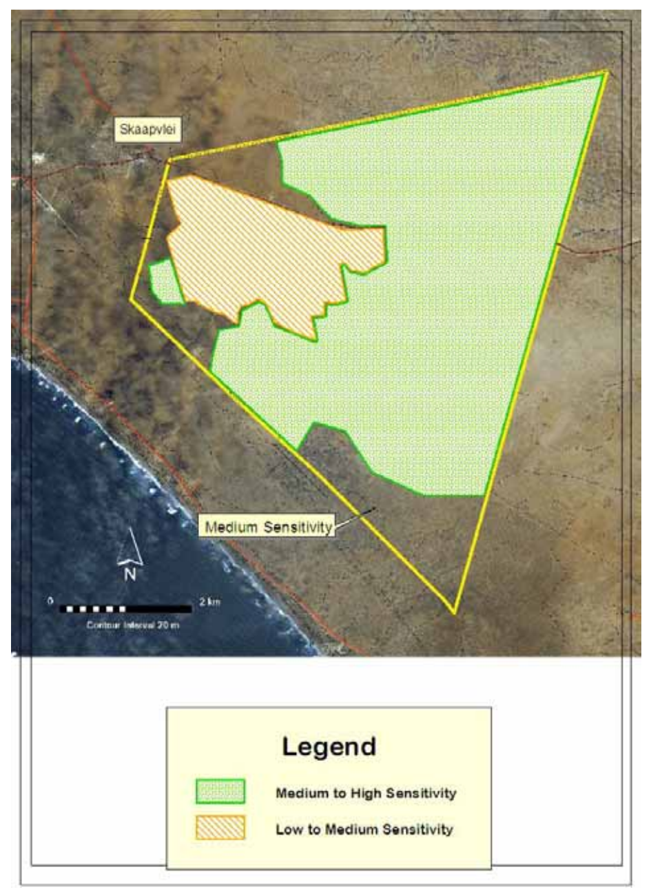
Figure 9.1: Botanical Sensitivity Map of the proposed wind energy facility development site