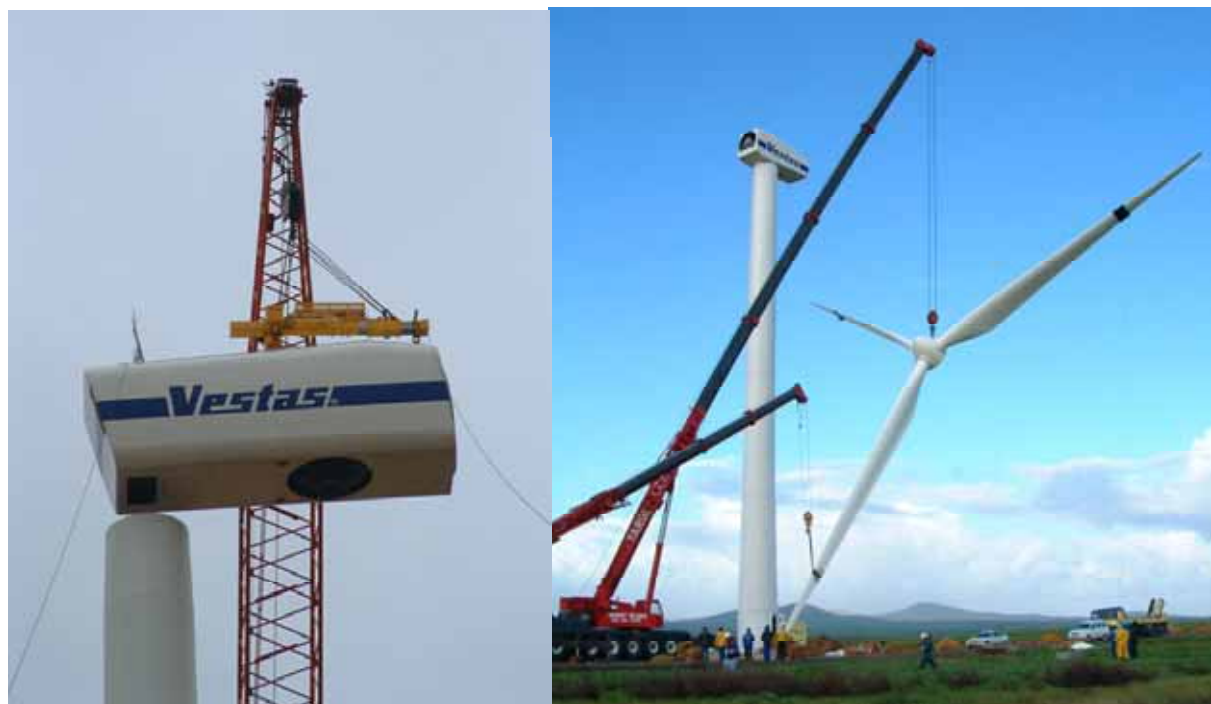
Figure 7.7: Photograph illustrating the assembly of a turbine (nacelle and blades) utilising a large lifting crane (photographs courtesy of Eskom from construction at the Klipheuwel demonstration facility)