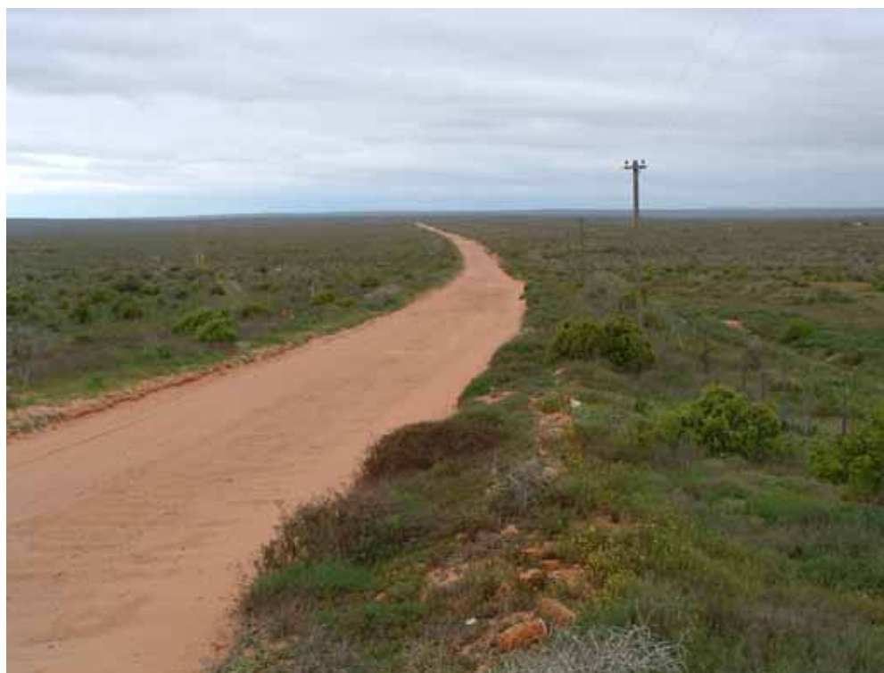
Figure 7.3: Photograph indicating the existing gravel access road to the proposed site (i.e. the road to Skaapvlei from Koekenaap)

Access/haul roads to the site as well as internal access roads within the site are required to be established. The proposed site is in a remote location but with good access owing to the existing road network providing access to the diamond mining concession areas. As far as possible, existing access roads to the site (including the road to Skaapvlei) will be utilised, and upgraded where required. Within the site, access will be required between the turbines for construction purposes. Special haul roads may need to be constructed to and within the site to accommodate abnormally loaded vehicle access and circulation. The internal service road alignment will be informed by the final micro-siting/positioning of the wind turbines.