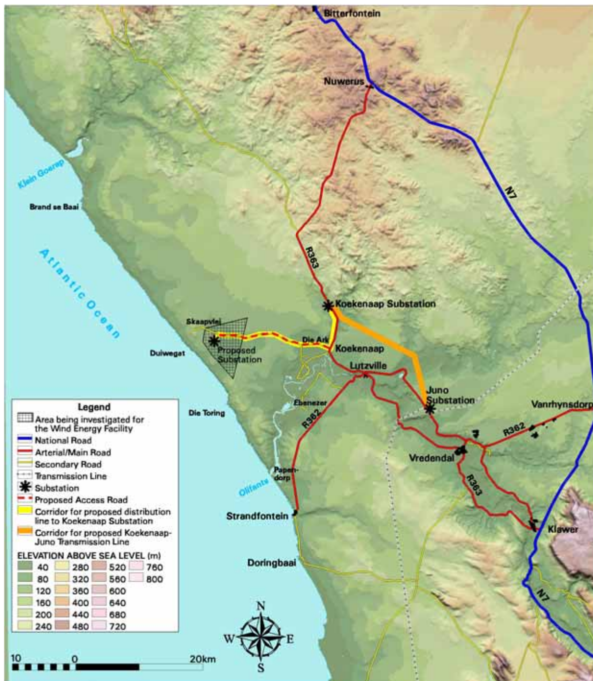
Figure 7.2: Map indicating proposed corridors for powerline construction – alignments to be investigated in detail in the EIA Phase.

It is expected that there will be between 6 and 15 people in a construction crew, depending on the construction phase of project and the nature of activities being undertaken. There may be more than one crew operating on the site at any one time. Construction crews will constitute mainly skilled and semi-skilled workers. No employees will reside on the site at any time during the construction phase.