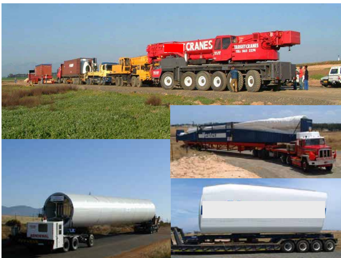
Figure 7.5: Photograph illustrating the equipment required for the transportation of turbine components to site (photographs courtesy of Eskom at during the construction of the Klipheuwel demonstration facility)

The wind turbine, including tower, will be brought on site by the supplier in sections on flatbed trucks. Turbine units which must be transported to site consist of a tower comprised of 4 segments of approximately 20 m in length, a nacelle weighing approximately 83 tons, and three rotor blades (each of approximately 45 m in length). The individual components are defined as abnormal loads in terms of Road Traffic Act (Act No 29 of 1989) 7 by virtue of the dimensional limitations (abnormal length of the 45 m blades) and load limitations (i.e. the nacelle). In addition, components of various specialised construction, lifting equipment and counter weights etc. are required on site (e.g. 200 ton mobile assembly crane and a 750 ton main lift crawler crane) to erect the wind turbines and need to be transported to site.