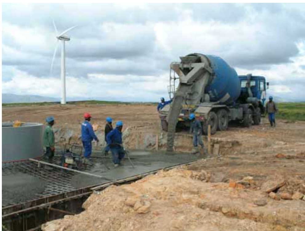
Figure 7.4: Photograph illustrating the construction of the foundation of one of the turbines at the Klipheuwel demonstration facility

Concrete foundations will be constructed at each turbine location. Foundation holes will be mechanically excavated to a depth of approximately 2 m. Concrete will possibly be batched at an appropriate location off-site and brought to site when required via ready-mix cement trucks. The reinforced concrete foundation of approximately 15 m x 15 m x 2 m will be poured and support a mounting ring. The foundation will then be left up to a week to cure. If the geological conditions dictate, the use of alternative foundations will be considered (e.g. reinforced piles).