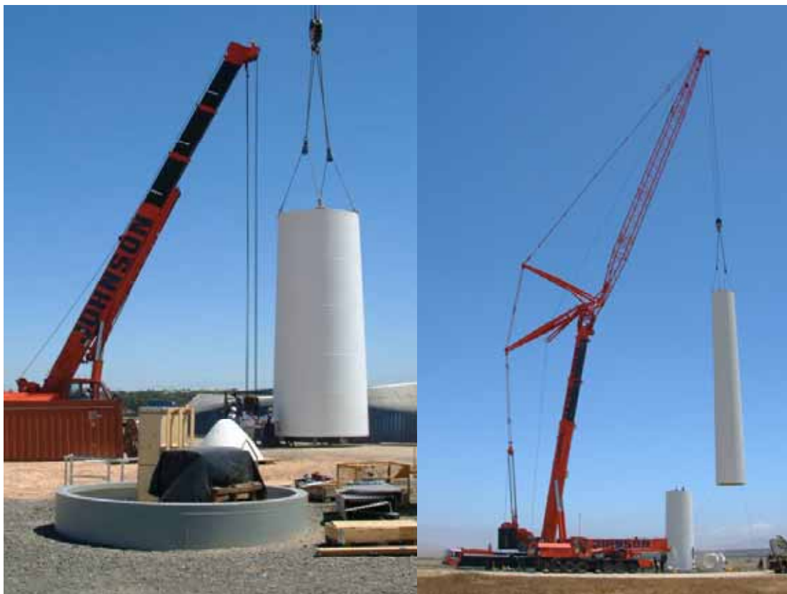
Figure 7.6: Photograph illustrating the assembly of a turbine tower utilising a large lifting crane (photographs courtesy of Eskom taken during the construction of the Klipheuwel demonstration facility)