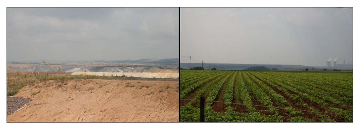
Figure 2: The agricultural and mining activities that form the greater part of the study

The greater part of the study area is made up of agricultural and mining activities (Figure 2). The proposed site for the proposed new wet ash disposal facility at Hendrina Power station is located directly adjacent to the existing wet ash disposal facilities and is currently utilised for agriculture (Figure 3).