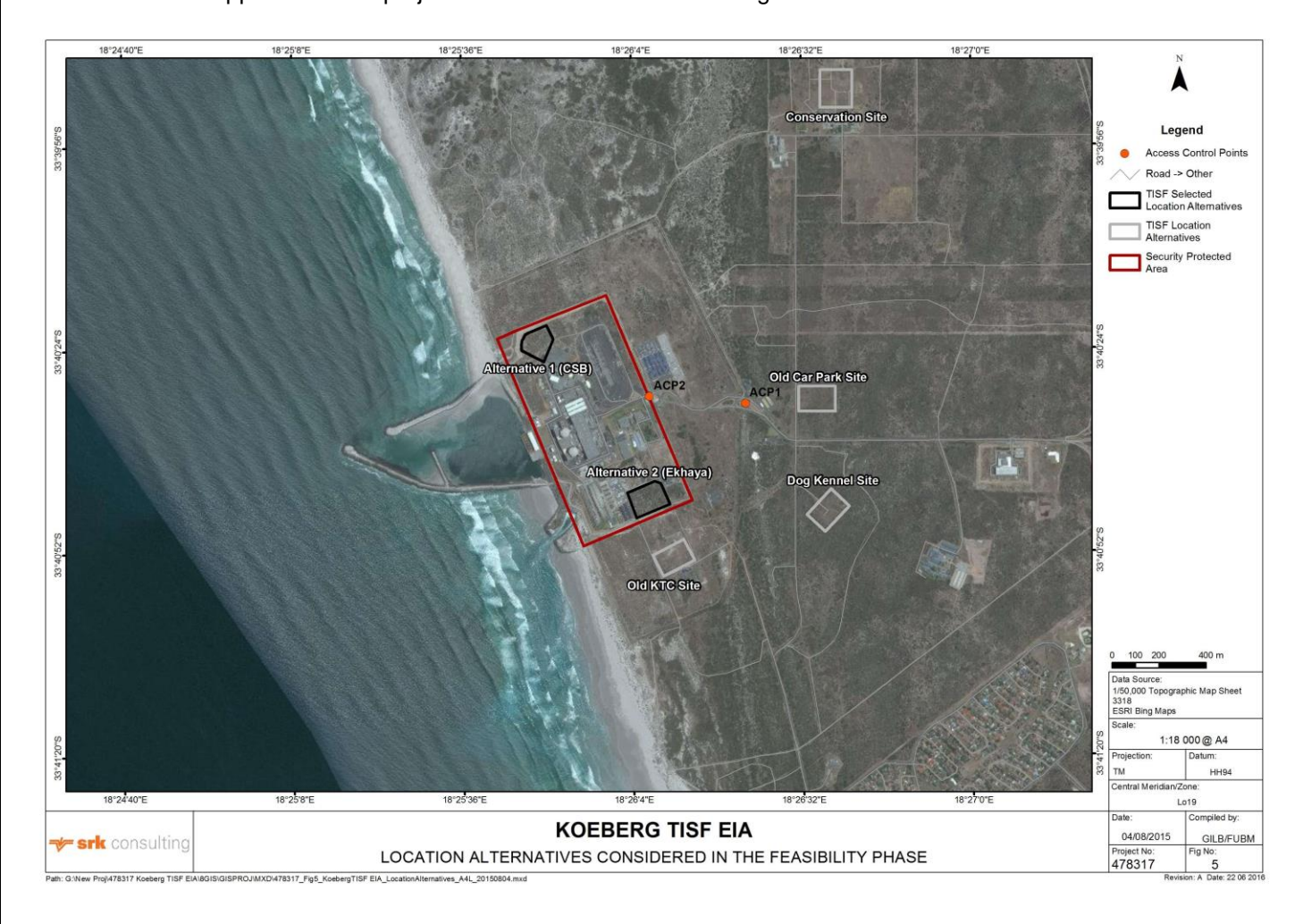
Figure 6: TISF Location alternatives

Eskom identified six potential sites at Koeberg for the location of the TISF, which were evaluated against various criteria. The site selection process identified two viable site locations for the TISF (refer to Figure 5) - the CSB site, the preferred alternative (Alternative 1), and the Ekhaya site (Alternative 2). Alternative 1 is located adjacent to the CSB on the northern boundary of the KNPS and Alternative 2 is located along the southern boundary of the KNPS next to the Ekhaya Building.