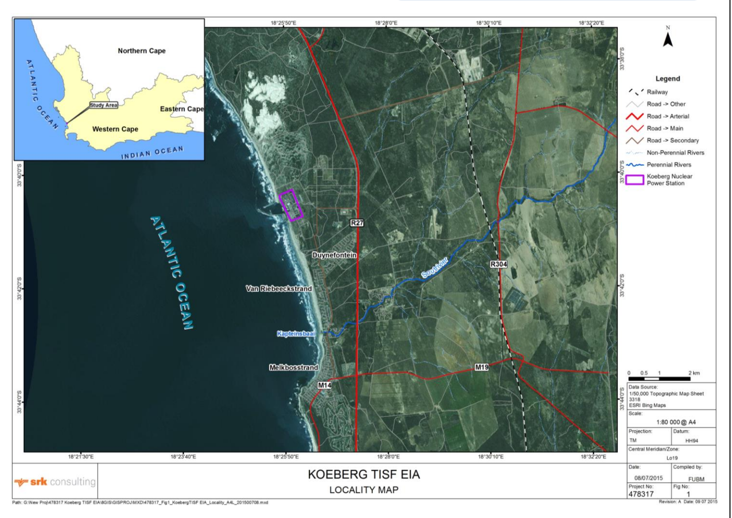
Figure 1: Locality Map