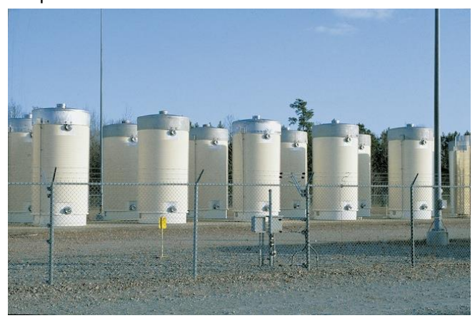
Figure 4: Example of a TISF

The TISF will meet the requirements of the NNR and will be built and managed in accordance with the International Atomic Energy Agency safety standards. Construction of the TISF will commence in 2018 and will take approximately 12 months to complete. The construction laydown area will be located within the proposed TISF site to reduce the disturbance footprint.