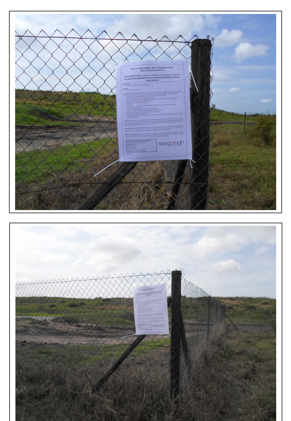
Figure 1a & 1b: Site notices placed on the boundary of Portion 2 of Erf 11376 in the Richards Bay Industrial Development Zone (IDZ) Phase 1D (30° 20' 5.85"S; 25° 41' 58.99"E)

PROOF OF SITE NOTICES (Date placed: 31-08-2017)