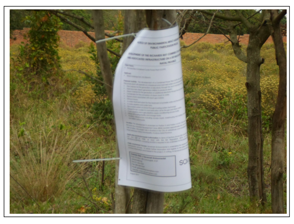
Figure 2a & 2b: Site notices placed on Portion 4 of Erf 11376 in the Richards Bay Industrial Development Zone (IDZ) Phase 1D (28° 45' 10.72"S; 31° 59' 54.02"E)