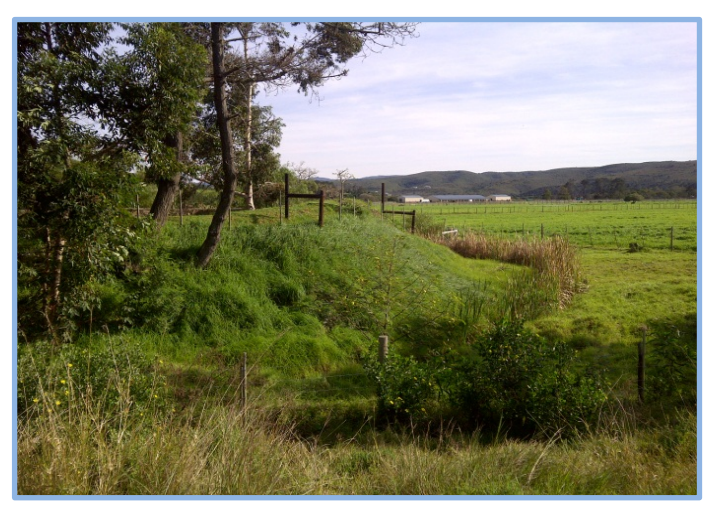
Figure 11: Westerly view taken from the N2 of the approx. start of Route 4B.

South-westerly view taken from the N2. Route 4B located to the right.