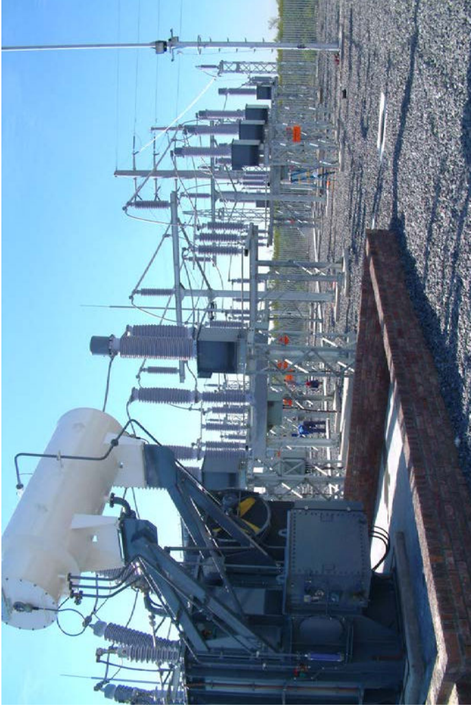
B) Photograph of Typical Low Profile Substation Installation Similar to the One Planned