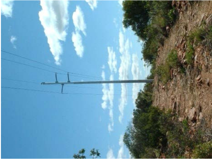
A) Pylon similar to the type that will be used