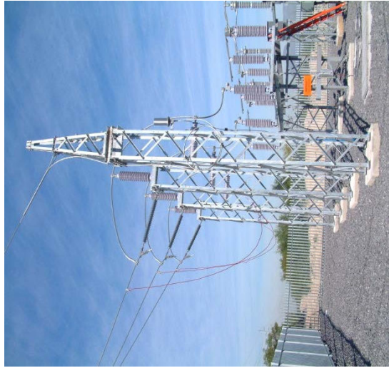
C) Typical Substation Installation