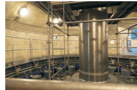
Unit 3 turbine shaft - 1,4m diameter