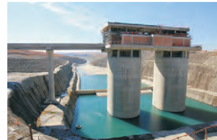
Headrace at Ingula's upper site