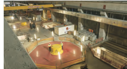
Machine Hall and Unit 4