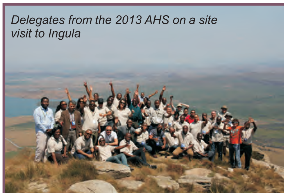
Delegates from the 2013 AHS on a site visit to Ingula

The Gala Dinner will be held in the historical Royal Hotel in Ladysmith. Another of the evenings will have a Zulu-themed dinner at Spionkop Lodge, just outside Ladysmith.