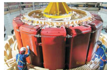
Installation of rotor and stator