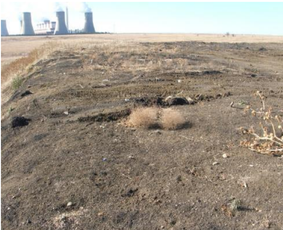
Figure 2: Waste is compacted and covered on a daily basis when a waste disposal site is well managed.

DECISION-MAKING PHASE The environmental authority reviews the EIR and consults with other key authorities. Environmental Authorisation and a decision on the application for a waste license are granted which states whether or not the proposed development can proceed, and under which conditions.