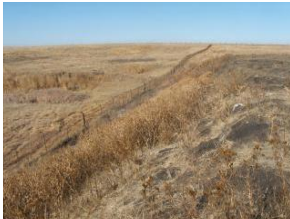
Figure 3: The correct storage disposal and capping of waste is important to ensure a sustainable waste disposal site.

At this stage, all registered I&APs will receive a personalised letter to report on the progress of the EIA, and to outline the next steps in the process.