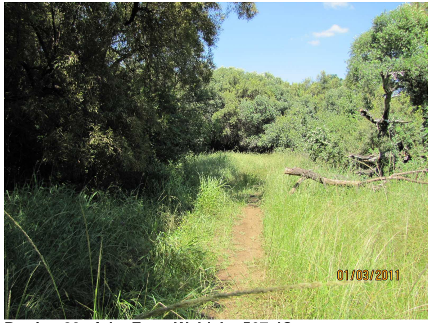
Portion 82 of the Farm Weldaba 567 JQ