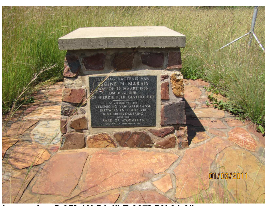
Located at S 25° 46' 54.4" E 027° 56' 31.9"

The identified alternatives do not contain any evidence of any historical happenings or structures. The nearest monument is located to the north of the identified sites and commemorates the death of the South African writer and poet Eugene N. Marais.