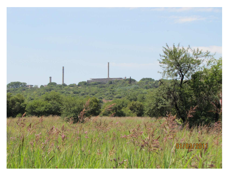
The NECSA site situated opposite the study area

Opposite the study area the site and structures associated with the Nuclear Energy Corporation of South Africa (NECSA) can be regarded of national scientific importance.