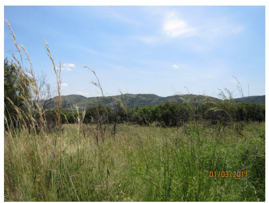
Portion 25 of the Farm Welgedund 491 JQ