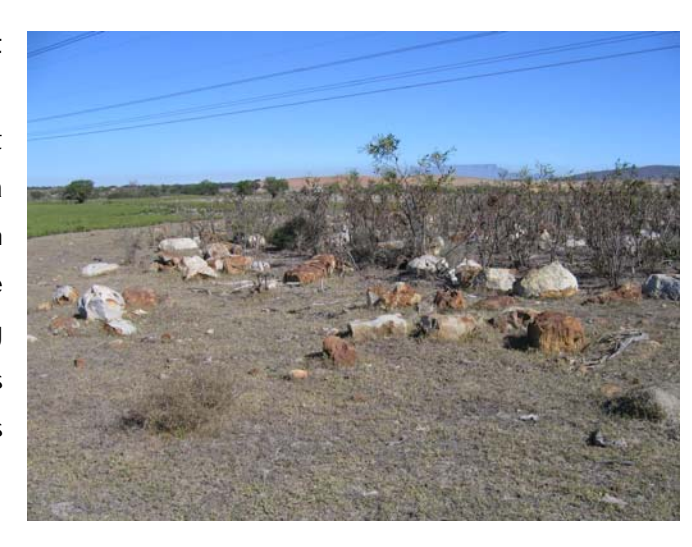
Figure 5 Silcrete boulders at site 3

Also associated with a low grade silcrete raft which has been quarried, the site extends along a low ridge for at least 200 m rarely reaching 50 m wide and overlain with sand in places. There are rather more artefacts here, but again, nothing formal or diagnostic was seen. This pattern is typical of quarry sites where formal artefact types are rare.