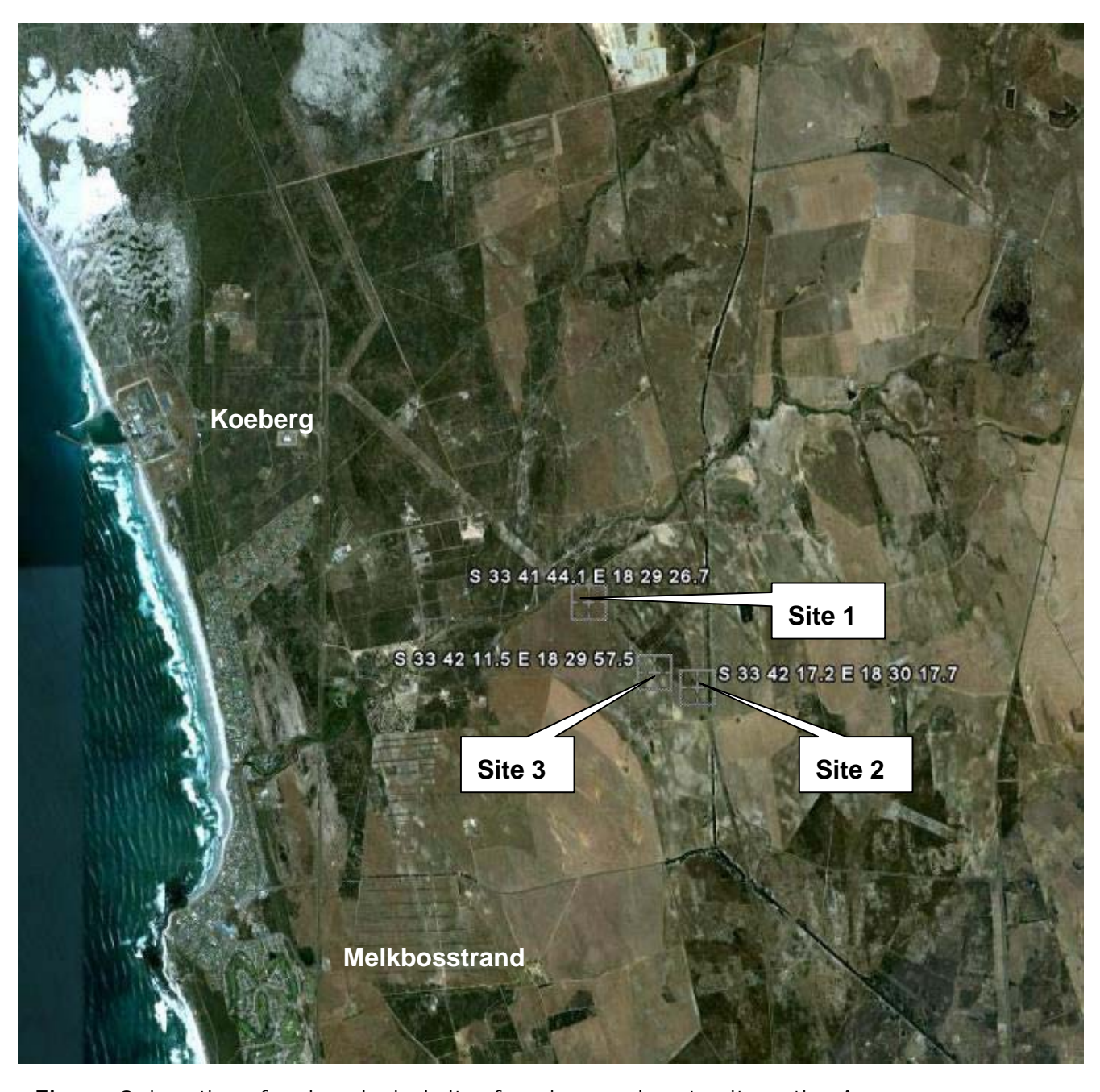
Figure 2 Location of archaeological sites found on or close to alternative A