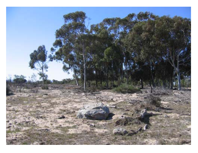
Figure 4 Disturbed area with silcrete boulder at site 2

Site 2 (S 33 42 17.2 and E 18 30 17.7 Groot Olifantskop) A rather disturbed area extending from eastern end, site GO7 (ACO report 2004), intersected by both the R304 and