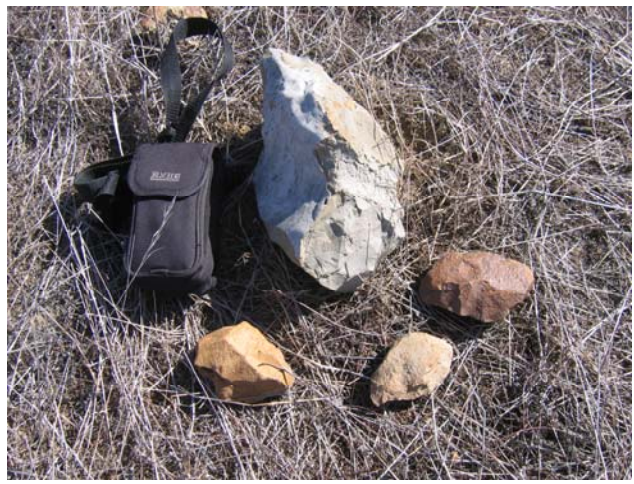
Figure 3 Site 1 (left), large silcrete chunck and patinated informal ESA material (right)

Site 1 (S 33 41 44.1 and E 18 29 26.7 Vaatjie) This is an area of scattered silcrete chunks, varying in size up to 30 to 40cm, irregular cores and a number of flakes and bifaces of later ESA or perhaps MSA age. Conversation with the farmer, Mr Stofberg revealed that it is very likely that the more finely made (and diagnostic) artefacts have been removed or collected some time ago. The silcrete is heavily patinated and iron-stained. There is no silcrete outcrop at this site although larger silcrete boulders up to a meter in diameter have been cleared from the field and