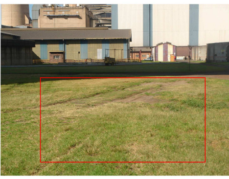
Identified site viewed from the north side