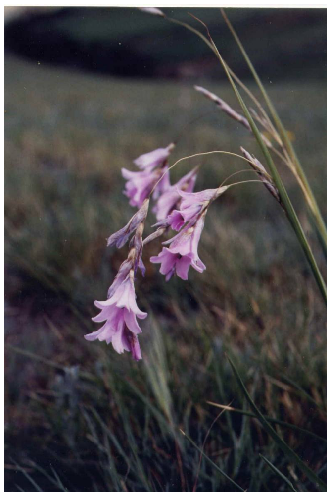
Small tussocks of another hairbell, probably Dierama sp. cf robustum growing in grassland on the farm Chatsworth.