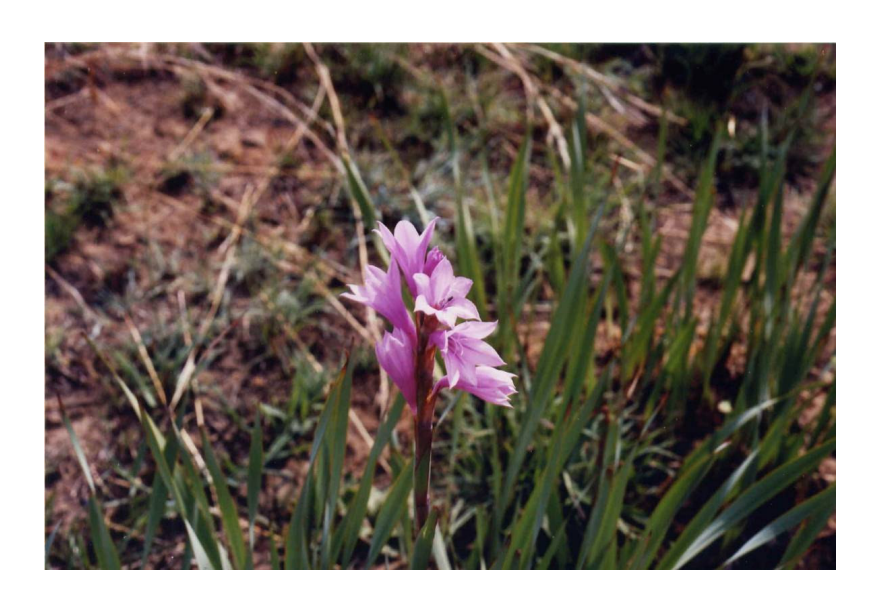
Watsonia sp. cf lepida/ confusa commonly growing in small clumps on the farm Braamhoek, along the Option 2 route and along parts of the other provincial roads, forming large colonies under optimum conditions. The plants seen here appear intermediate between W. lepida which is described as being mostly a solitary species and W. confusa which occurs solitary or in small clumps (Goldblatt 1989, Pooley 1998).