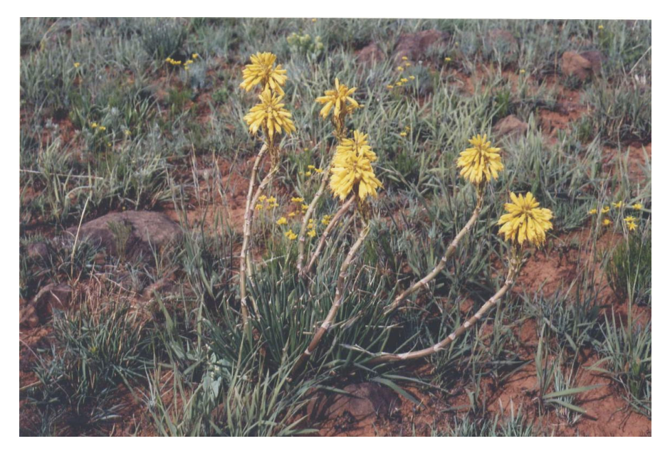
Aloe dominella growing along a dolerite outcrop along the Option 1 between K and P. A highly localized and sparsely distributed aloe endemic to KwaZulu-Natal.