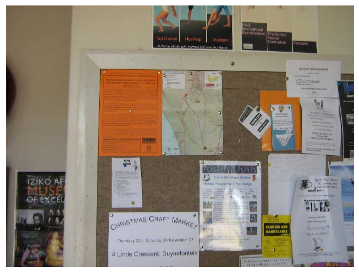
Site notice placed on notice board in community centre within Atlantis