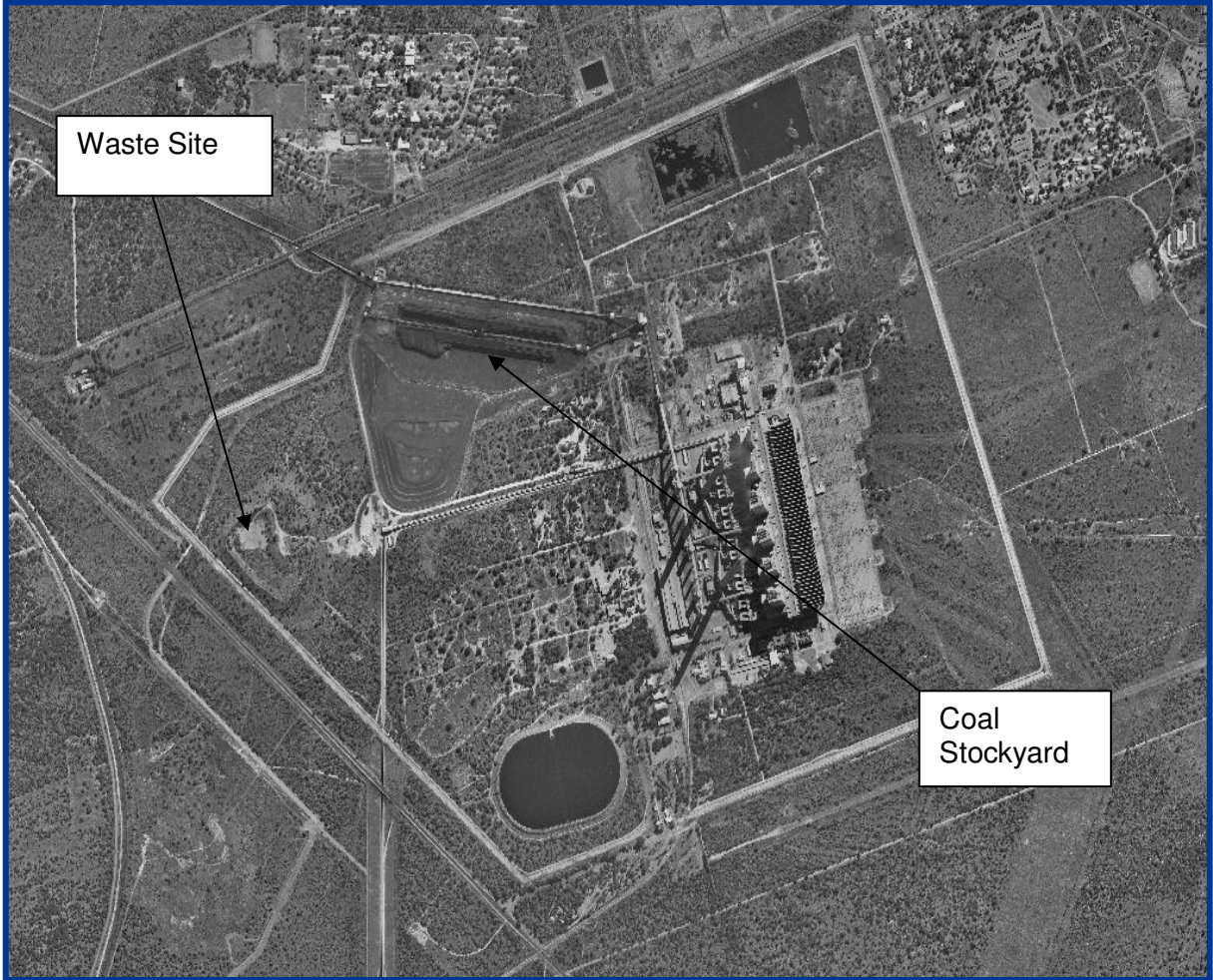
Locality of "Rock Dump" Waste Site