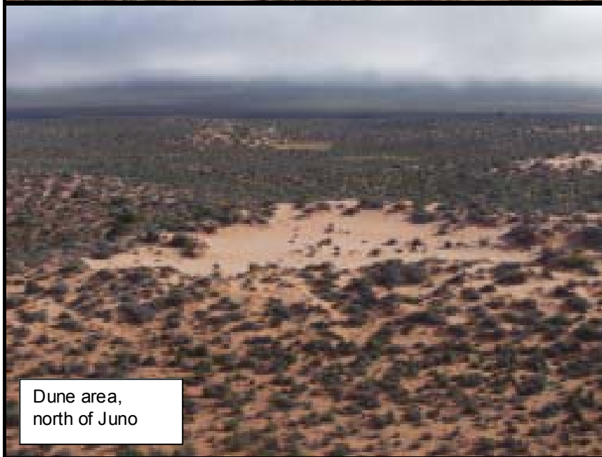
Dune area, north of Juno