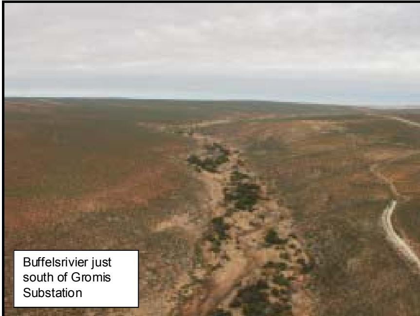
Buffelsrivier just south of Gromis Substation