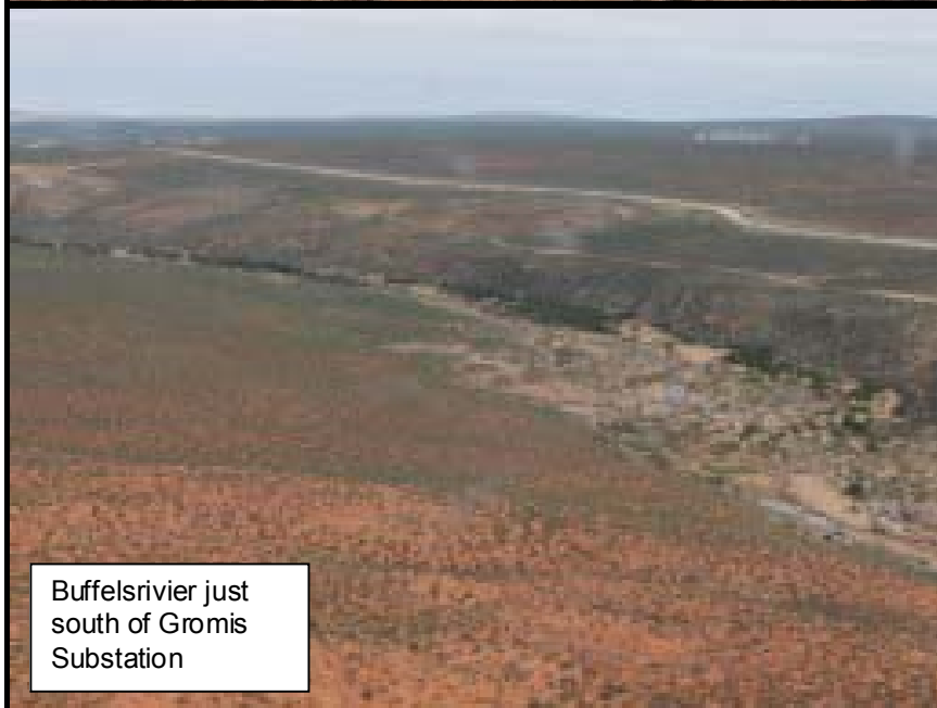
Buffelsrivier just south of Gromis Substation