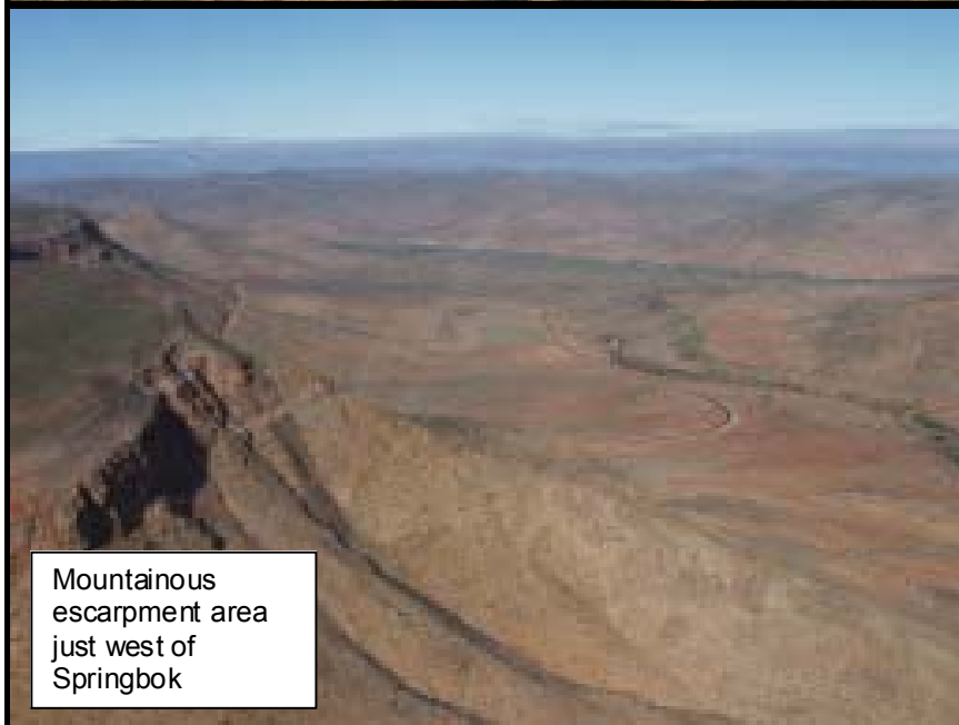
Mountainous escarpment area just west of Springbok