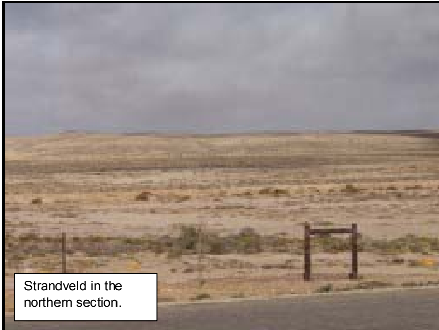
Strandveld in the northern section.