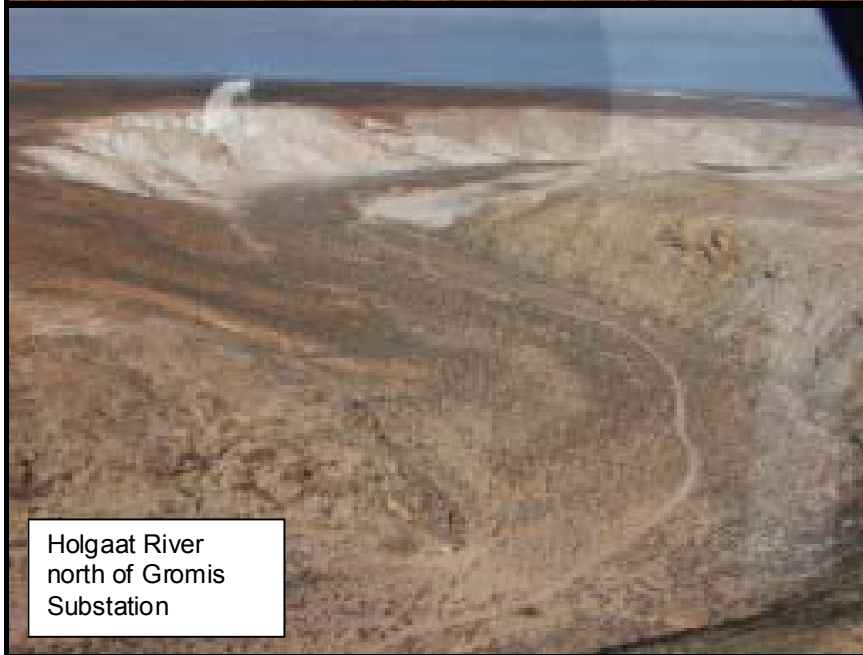
Holgaat River north of Gromis Substation