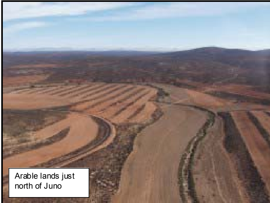
Arable lands just north of Juno