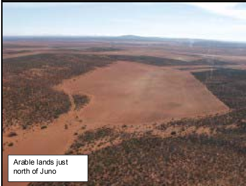
Arable lands just north of Juno