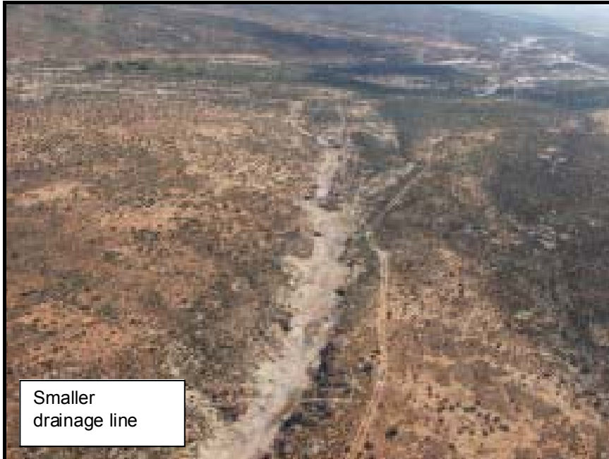
Smaller drainage line