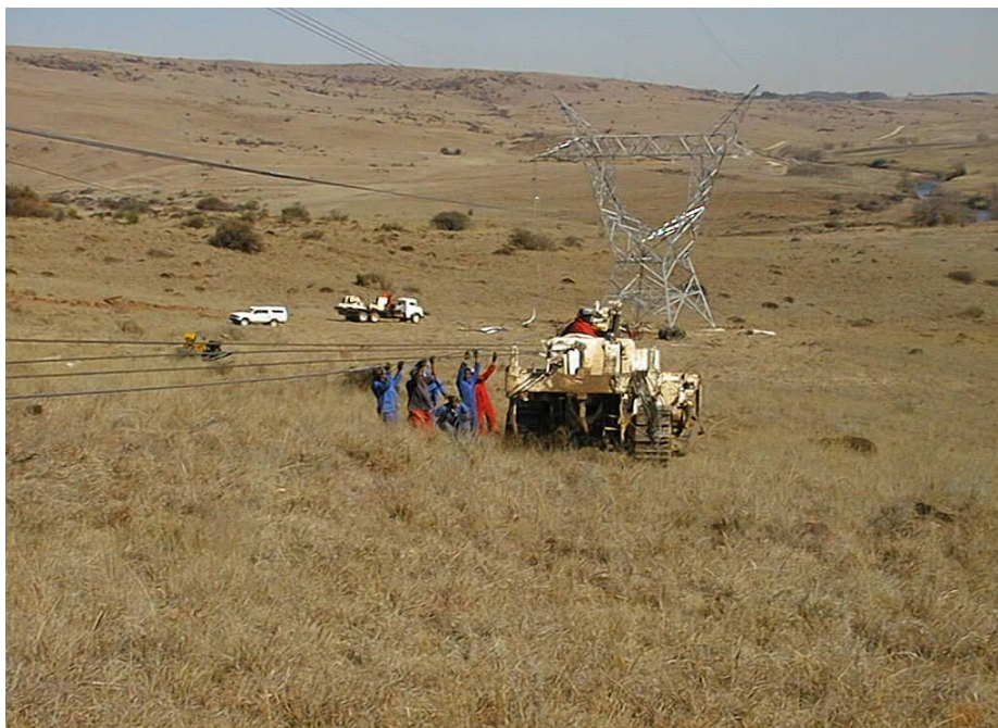
Figure 3.6: Mechanical stringing of the conductors