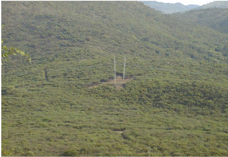
Figure 3.1: Example of Bushclearing around a Transmission line tower