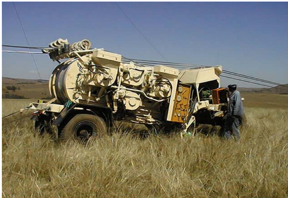
Figure 3.5: Mechanical stringing of the conductors

A pilot cable is used to string the conductors between towers. This can be undertaken mechanically or by hand. The line is generally strung in sections (from bend to bend). Cable drums are placed at 5 km intervals (depending on the length of the conductor) during this stringing process. In order to minimise any potential negative impacts on the surrounding area, these cable drums should be placed within the servitude.