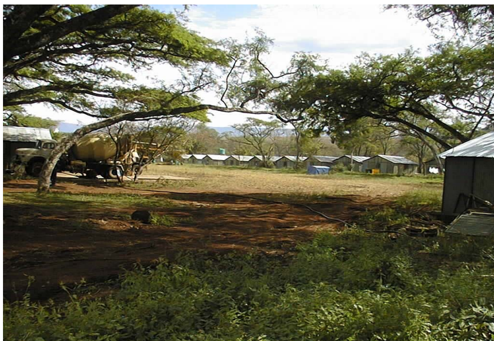
Figure 3.7: Typical construction camp

This construction of the powerline will require the establishment of a construction camp/s at an appropriate location along the route. The construction camp is estimated to be required to house up to 300 people. The exact siting of this construction camp is required to be negotiated with the relevant landowner, and must take cognisance of any no-go and sensitive areas identified through the EIA process as well as the site-specific Environmental Management Plan (EMP). Figure 3.7 represents a typical construction camp.