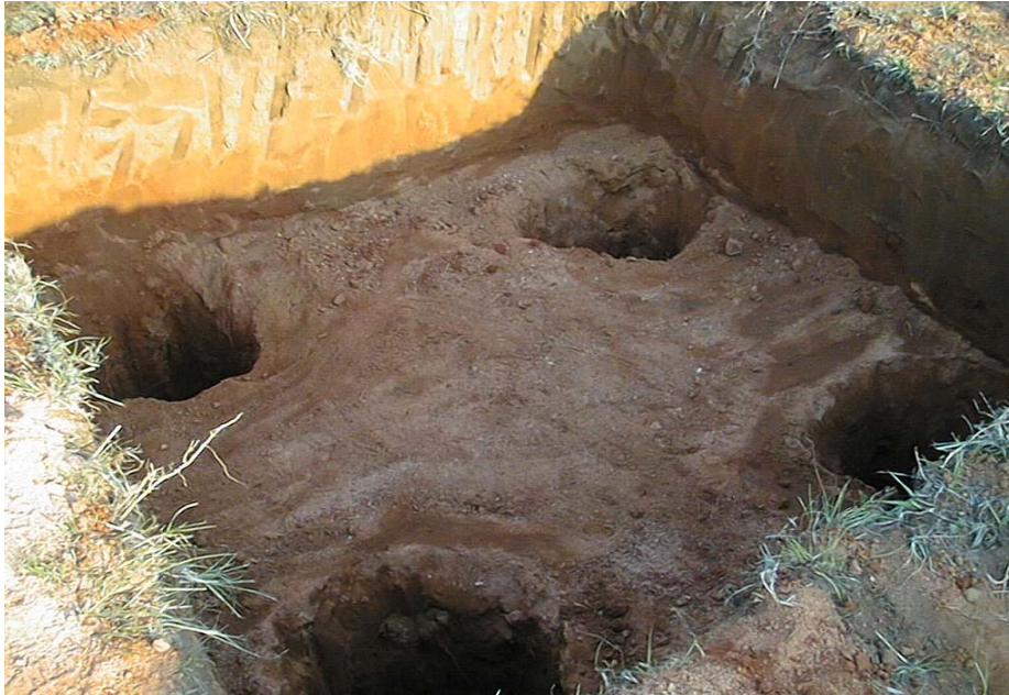
Figure 3.4: Example of a tower foundation