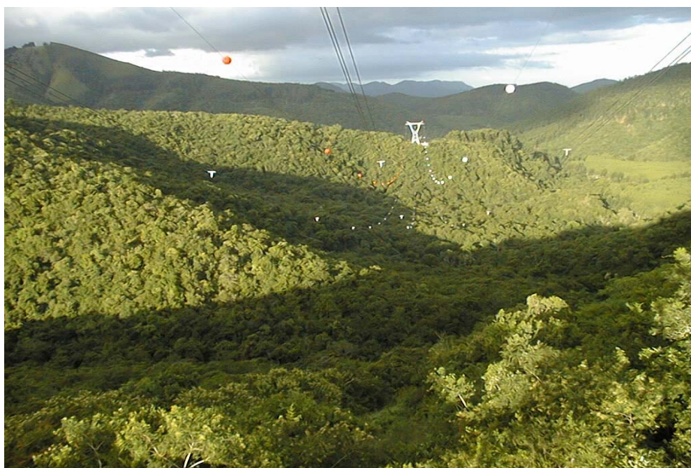
Figure 3.8: Example of Aviation spheres to make lines visible to aircrafts

Transmission Power lines may impact upon air traffic, particularly helicopters and small aeroplanes, which are relatively low-flying. However, Eskom generally attach aviation spheres to Transmission power lines which may be in the flight path of air traffic to make the Transmission power lines visible to pilots so that collisions can be avoided (Refer to Figure 3.8). Larger aeroplanes fly at a height at which Transmission power lines do not have an impact on them with regards to possible collisions.