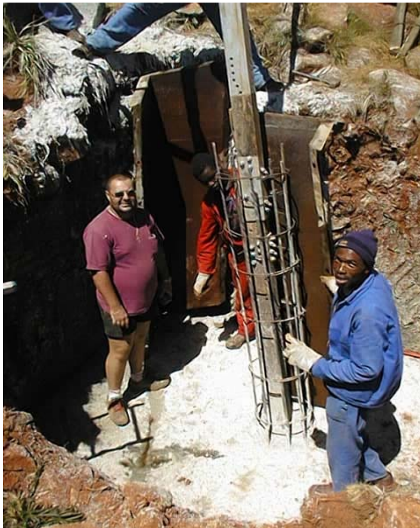
Figure 3.3: Tower foundation construction

Foundations may be mechanically excavated where access to the tower position is readily available. The same usually applies to the pouring of concrete required for the setting of the foundations. Prior to erecting the towers and filling of the foundations, the excavated foundations are protected in order to safe-guard unsuspecting animals and people from injury. All foundations are back-filled, stabilised through compaction, and capped with concrete at ground level. Construction activities associated with foundations are represented in Figures 3.3 and 3.4 below.