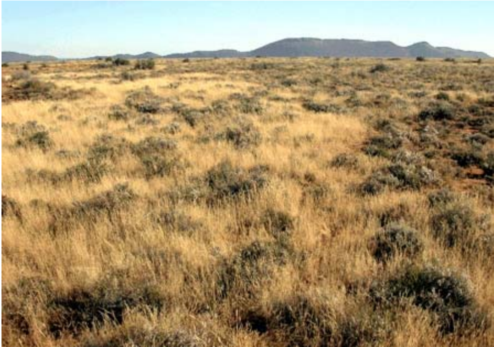
Photograph 6.2: Eastern mixed Nama Karoo vegetation occurring in the study area