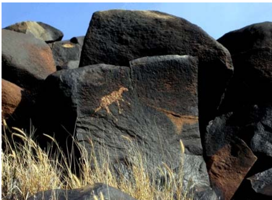
Photograph 6.6: Bushmen etching found in the study area