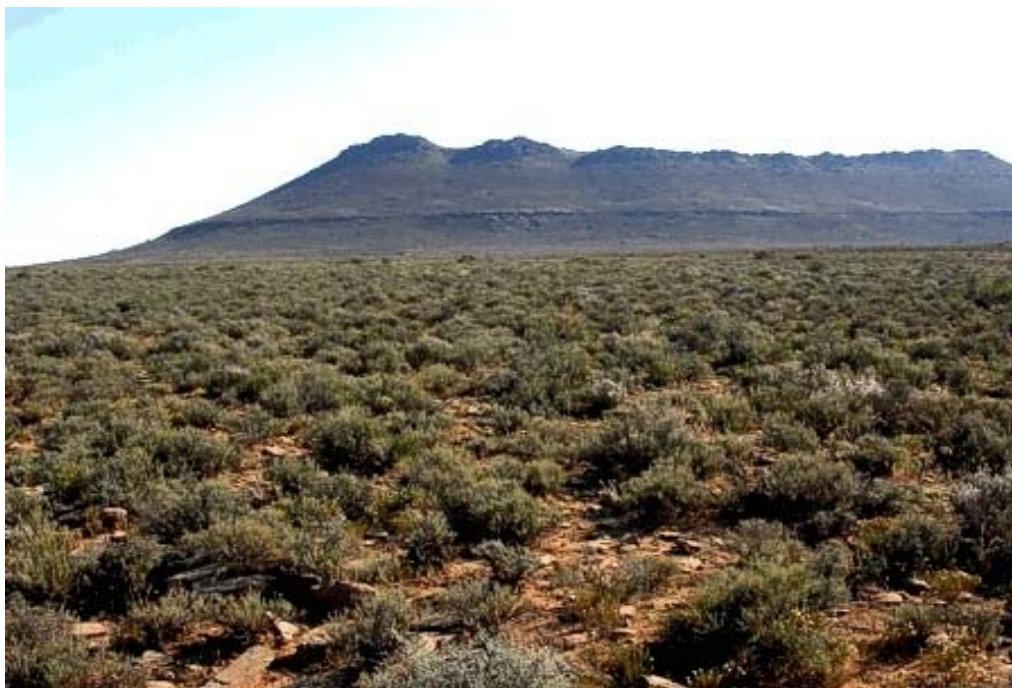
Photograph 6.1: Upper Nama Karoo vegetation occurring within the study area (Veld type 50)

Vegetation of the hills and mountains is fairly grassy with grass species such as Eragrostis lehmanniana , E. bergiana and Aristida congesta subsp congesta the most common. Typical shrubs and shrublets (karroo bushes) of these areas include Rhus undulata , R. burchellii , Rhigozum trichotomum , Lycium spp. and in some areas even Aloe broomii (See Photograph 6.1)