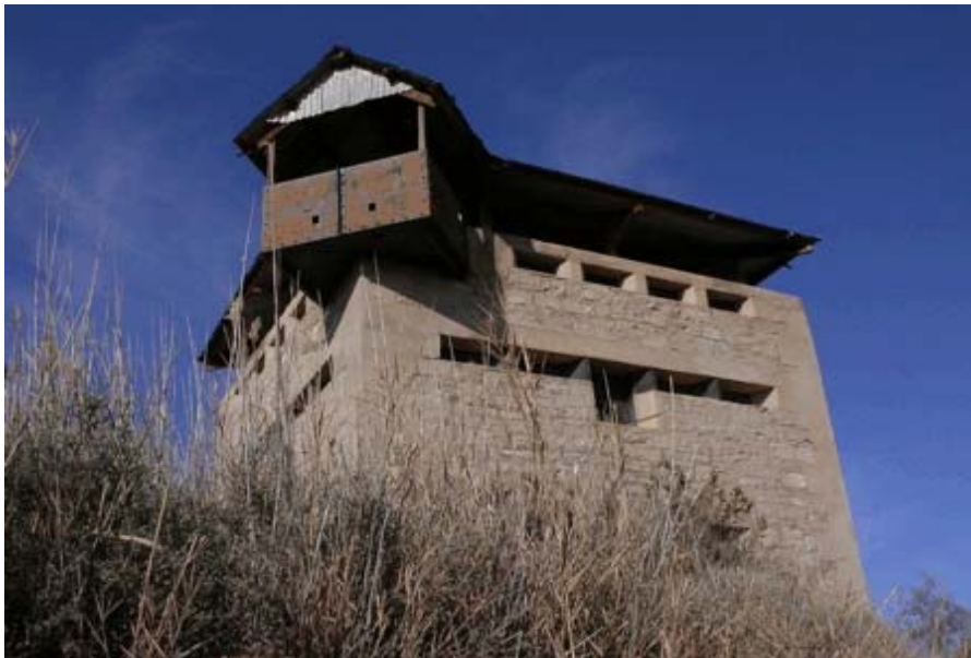
Photograph 6.5: Masonry blockhouse at Merriman close to Deelfontein

Known archaeological and rock art sites exist on the farms Nieuwejaars Fountain, Minfontein and Deelfontein (Morris 1991; 2000b) (see Photograph 6.6.).