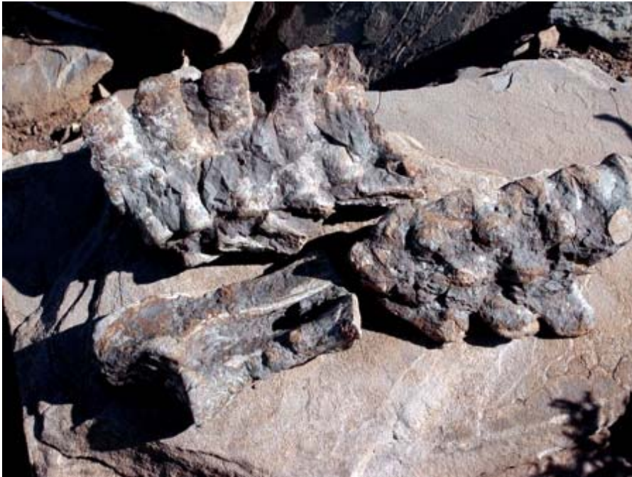
Photograph 6.4: Fossil remains found in the study area

Photographs of the various sites identified above are represented in Figures 6.4 and 6.6 below.