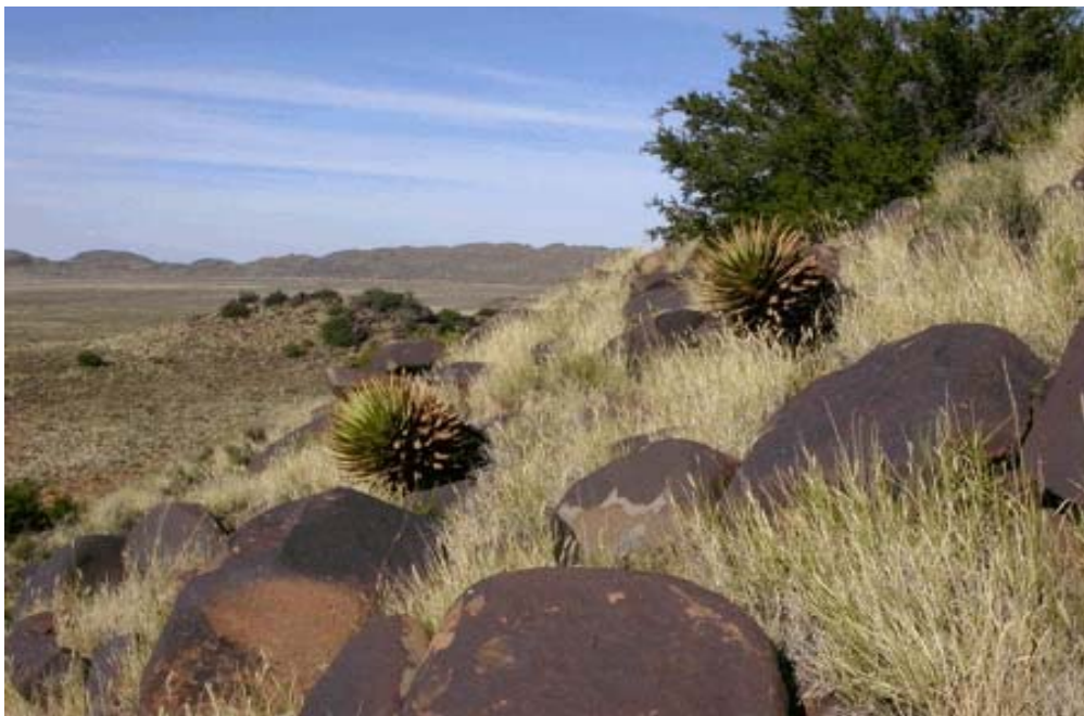
Photograph 6.3: Vegetation of the hills showing Aloe broomi and Cenchrus ciliaris