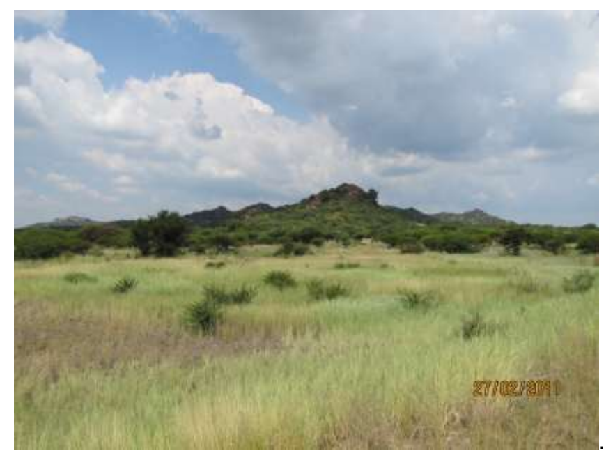
Granite outcrop near eastern route

There are limited portions of the original landscape still evident in the study area