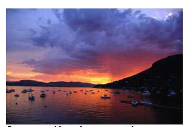
Sunset at Hartebeespoortdam

Early in the 1900's the then "Transvaalse Irrigasie Departement" surveyed an area near the town Brits for an irrigation dam. The First World War (1914-1918) meant a delay, but in 1921 further surveys were done and the dam was completed in 1923. The dam is called Hartebeespoortdam.<sup>5</sup>