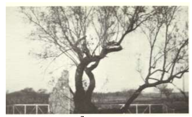
The De Wildt Tree<sup>7</sup>