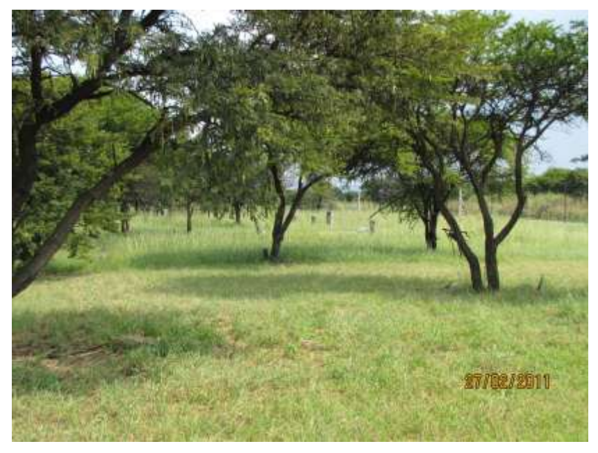
Elands Mine cemetery