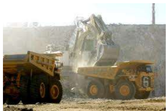
Mining activities in the study area

No pre-colonial heritage sites were observed in the study area. This can be attributed to large scale farming and mining activities in the area.