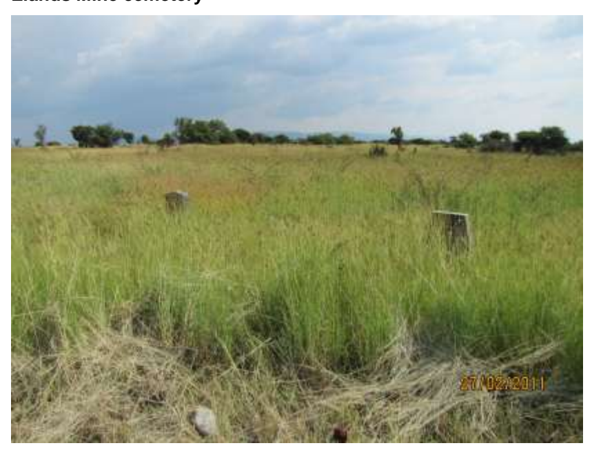
Graves near Western Route

All graves and cemeteries are of high significance and are protected by various laws. Legislation with regard to graves included the National Heritage Resources Act (Act 25 of 1999) whenever graves are 60 years and older. Other legislation with regard to graves includes those when graves are exhumed and relocated, namely the Ordinance on Exhumations (no 12 of 1980) and the Human Tissues Act (Act 65 of 1983 as amended).