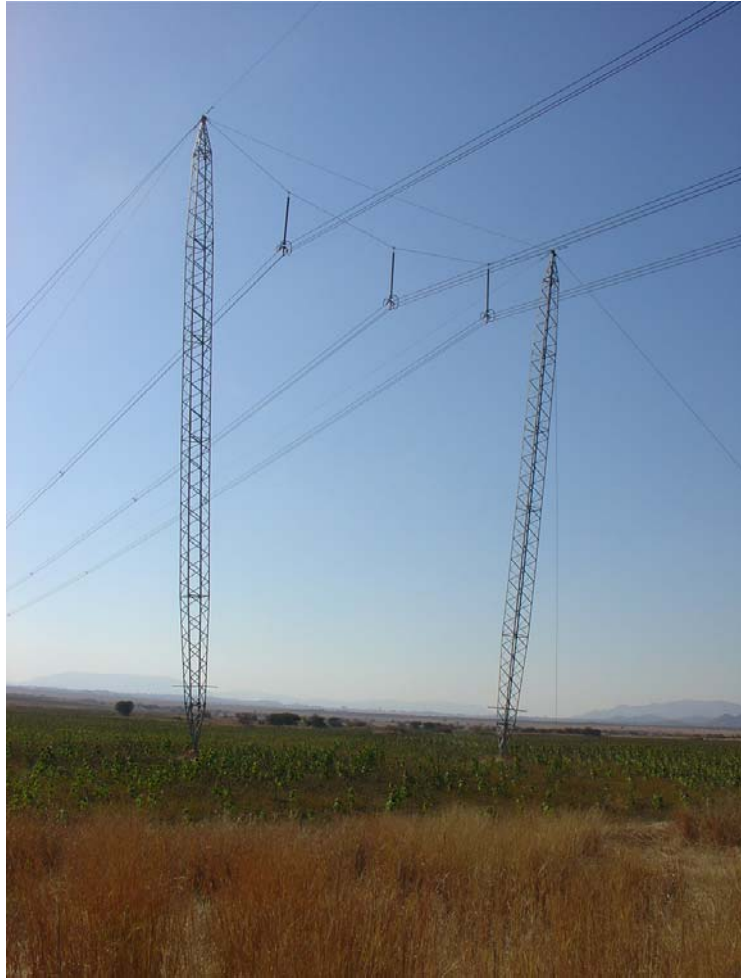
Figure 2: Compact cross rope suspension tower.