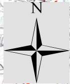
Figure 8: Locality Map