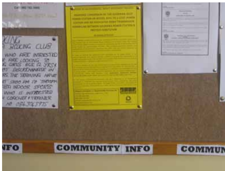
Site notice placed at the Kwanonaqaba Library, Mossel Bay