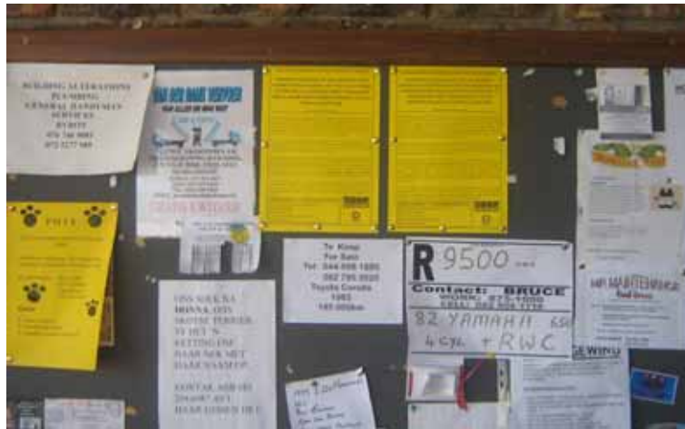
Notice of EIA process placed at Dana Bay Friendly Store, Mossel Bay