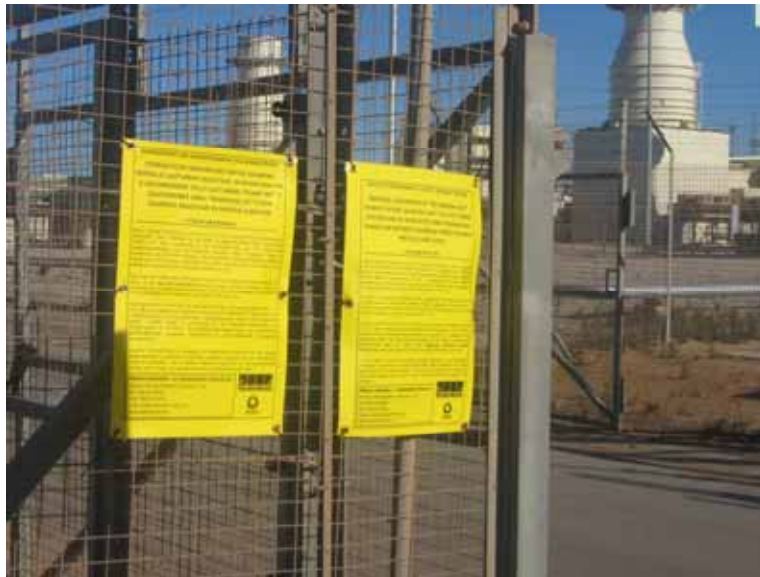
Site notice of EIA process placed on Gourikwa Power Station Main Gate