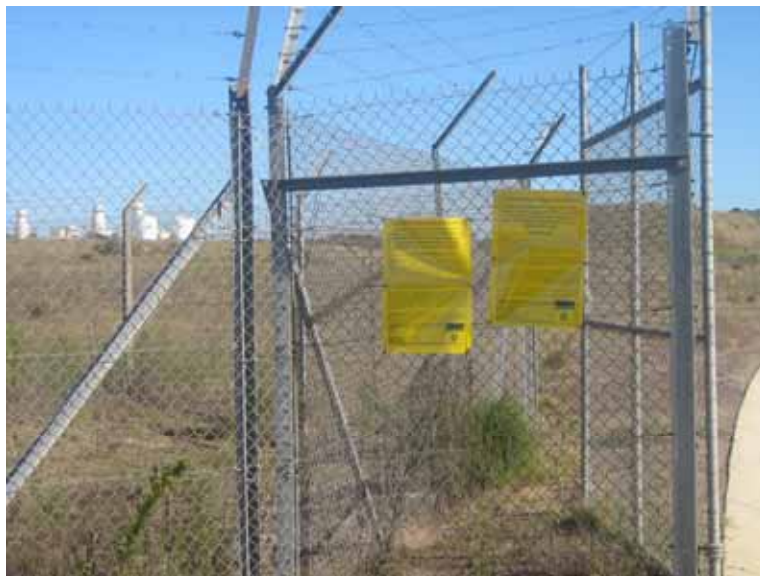
Site notice of EIA process placed on other access gate at Gourikwa Power Station