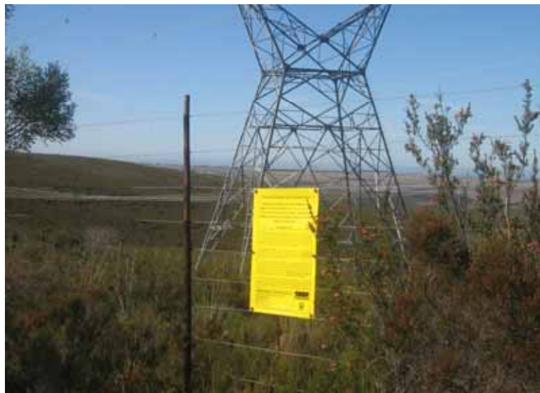
Notice of EIA process close to the proposed Gourikwa-Proteus power line corridor