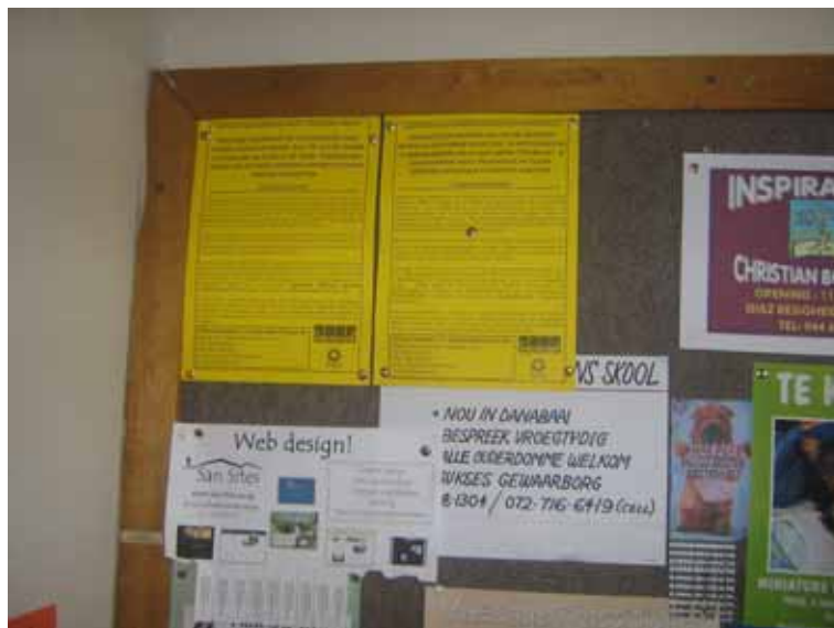
Notice of EIA process placed at Dana Bay Spar, Mossel Bay