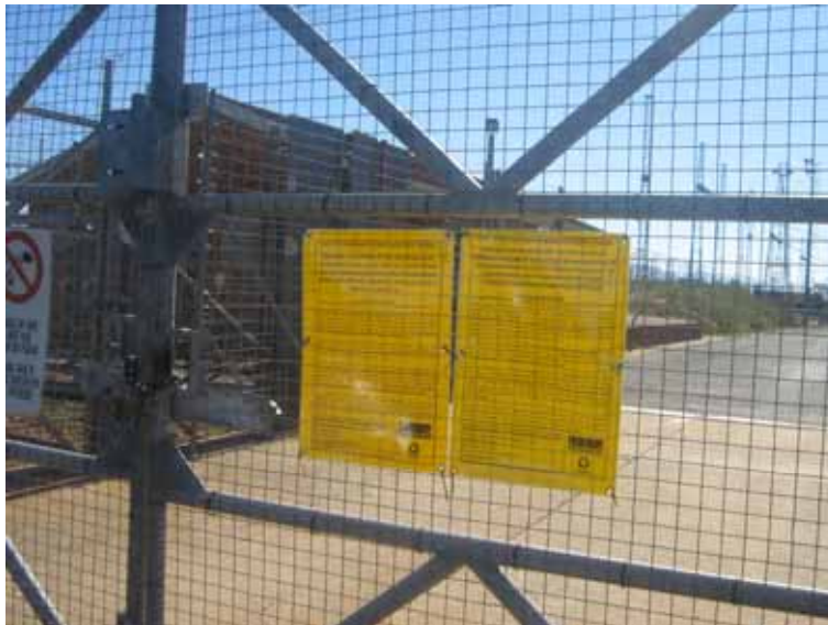
Notice of EIA process placed at the Proteus Substation main gate