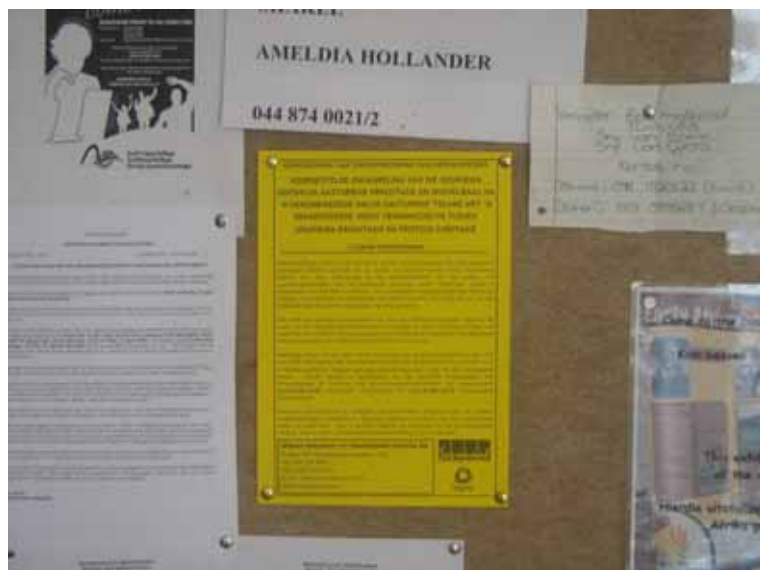
Notice of EIA process placed at D'Almeida Library, Mossel Bay