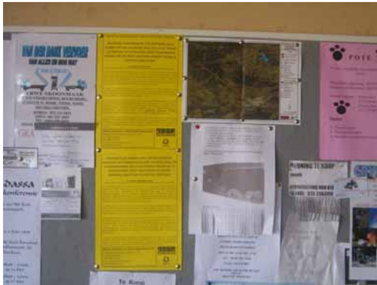
Notice of EIA process placed at the Marsh Street Library