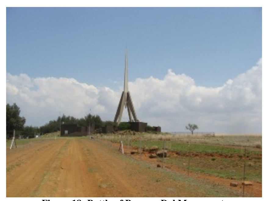
Figure 18: Battle of Berg-en Dal Monument.