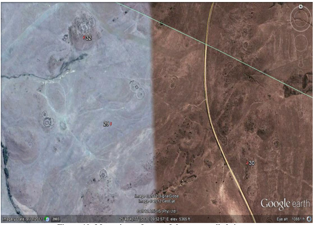
Figure 10: More views of some of the stone walled sites. Note the large number of homesteads forming this complex (Google Earth 2012).