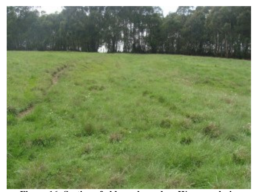
Figure 16: Section of old coach road on Wemmershuis.