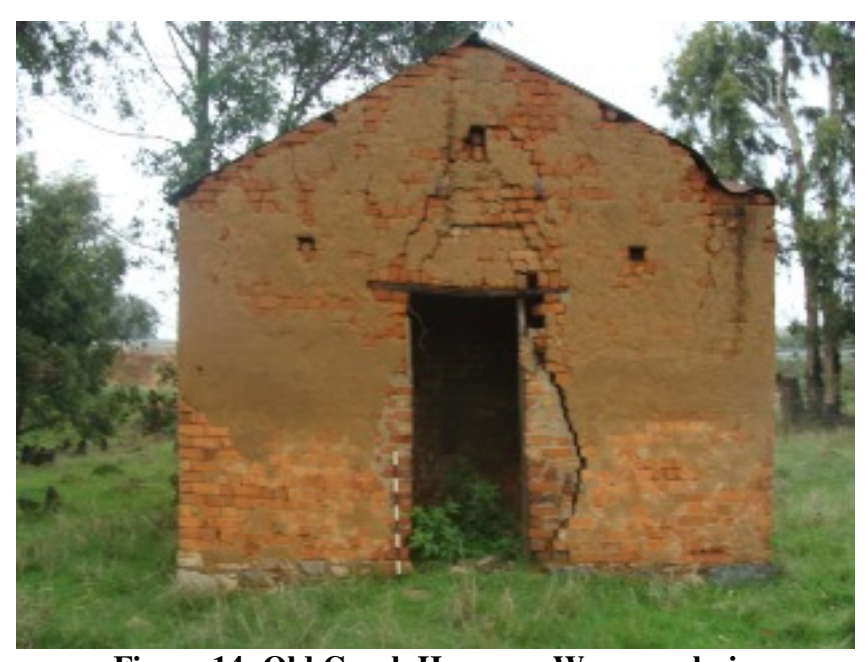
Figure 14: Old Coach House on Wemmershuis.