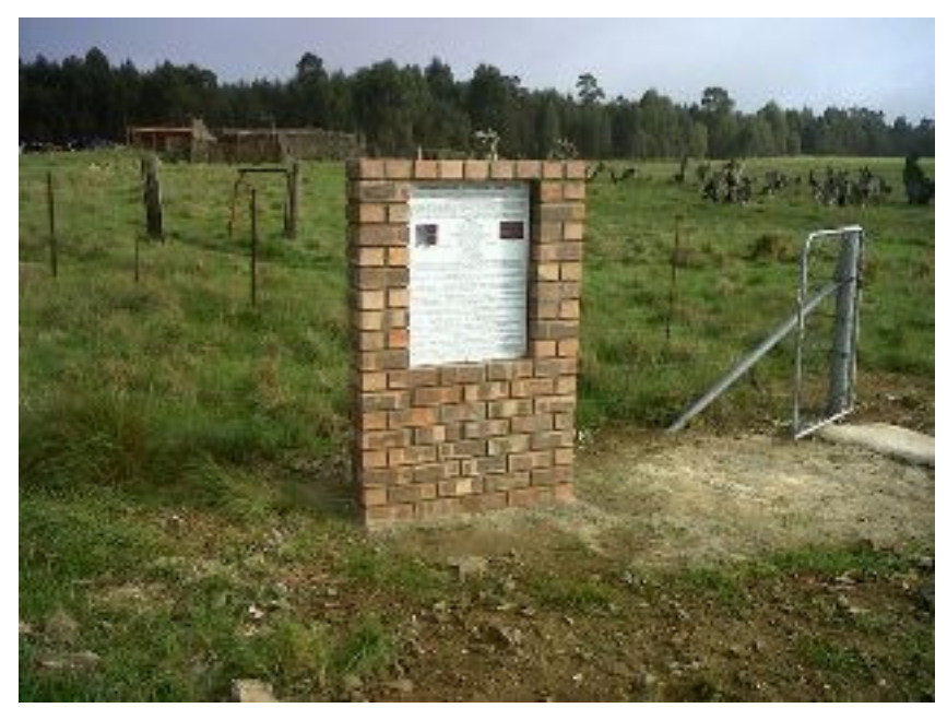
Figure 13: Information plaque at historical cemetery on Wemmershuis.