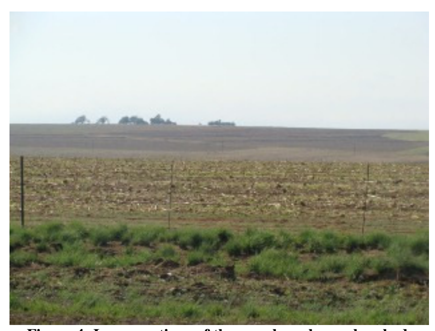
Figure 4: Large sections of the area have been ploughed.