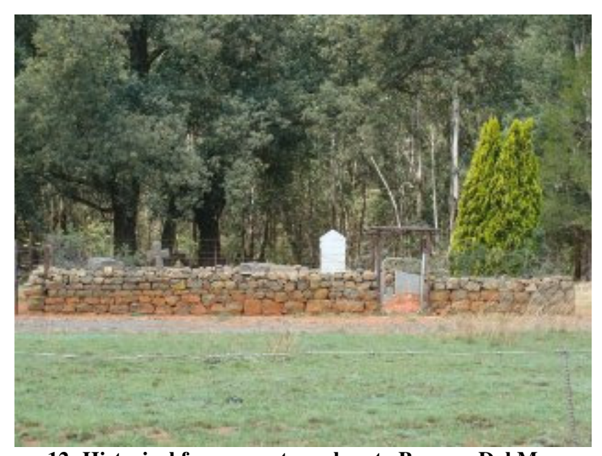
Figure 12; Historical farm cemetery close to Berg-en Dal Monument.