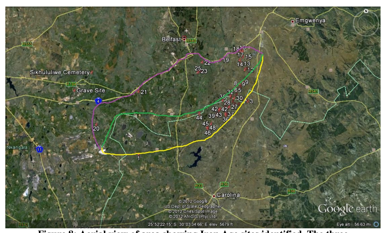
Figure 8: Aerial view of area showing Iron Age sites identified. The three alternativeLine Routes are estimated. Most of the sites are located close to Alternatives 1 & 5 (As per Figure 1).