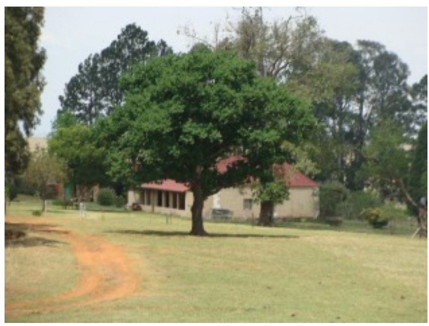
Figure 19: Historical farmhouse on Berg-en Dal close to Monument and battlefield.