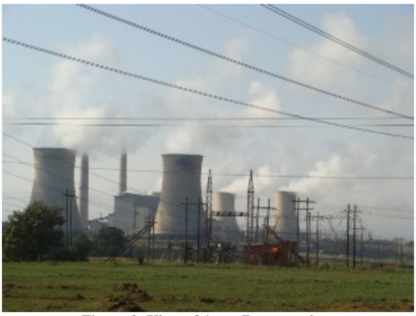
Figure 2: View of ArnotPowerstation.