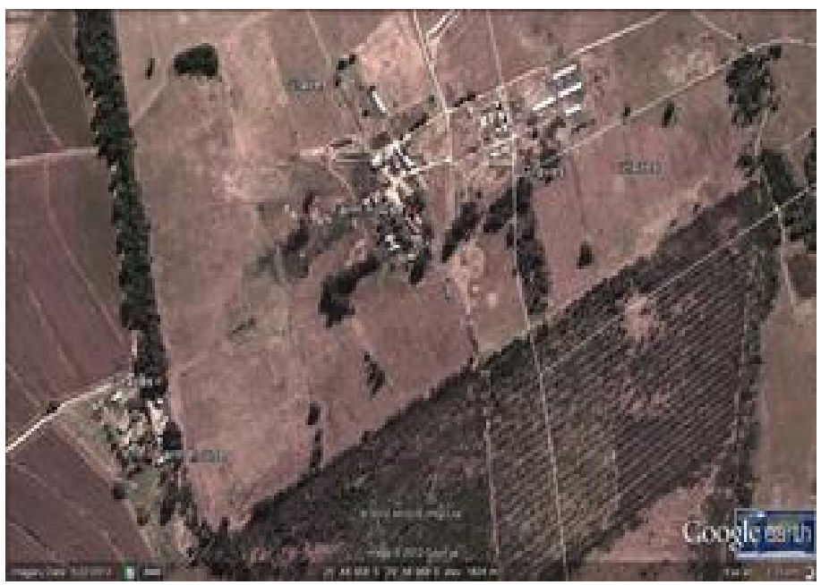
Figure 21: Typical farming complex in area (Google Earth 2012).