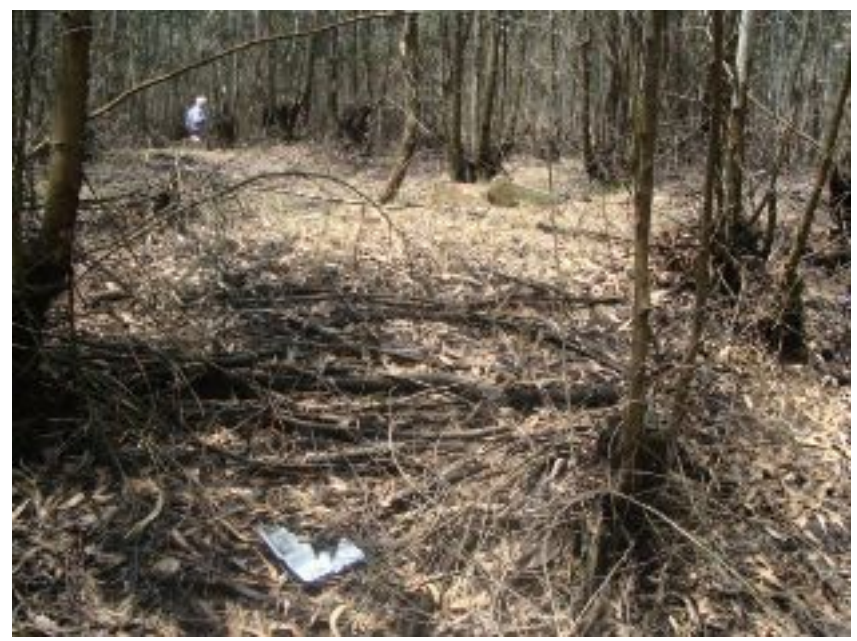
Figure 17: Remains of British Anglo-Boer War fortification on Wemmershuis.