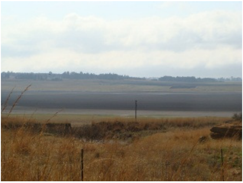
Figure 7: Many pans (this is Grootpan) is located in the area.