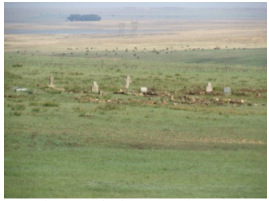
Figure 11: Typical farm cemetery in the area.