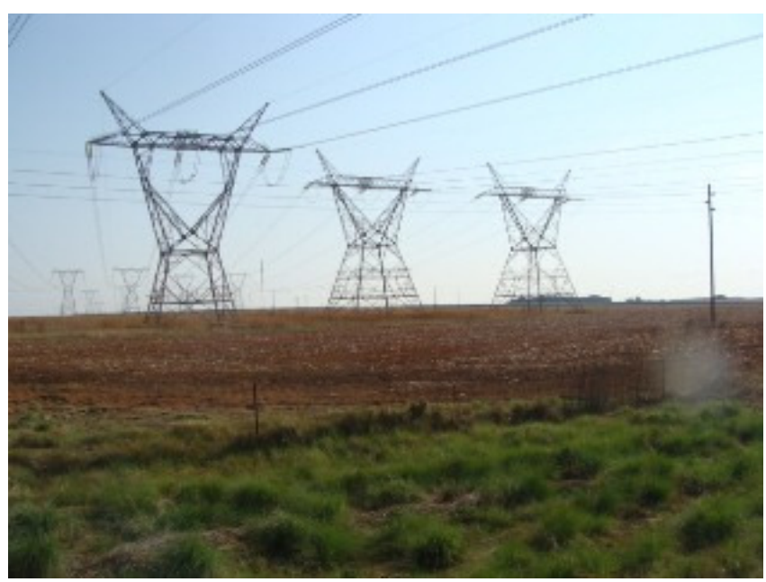
Figure 3: Existing powerlines in area crossing over ploughed fields.