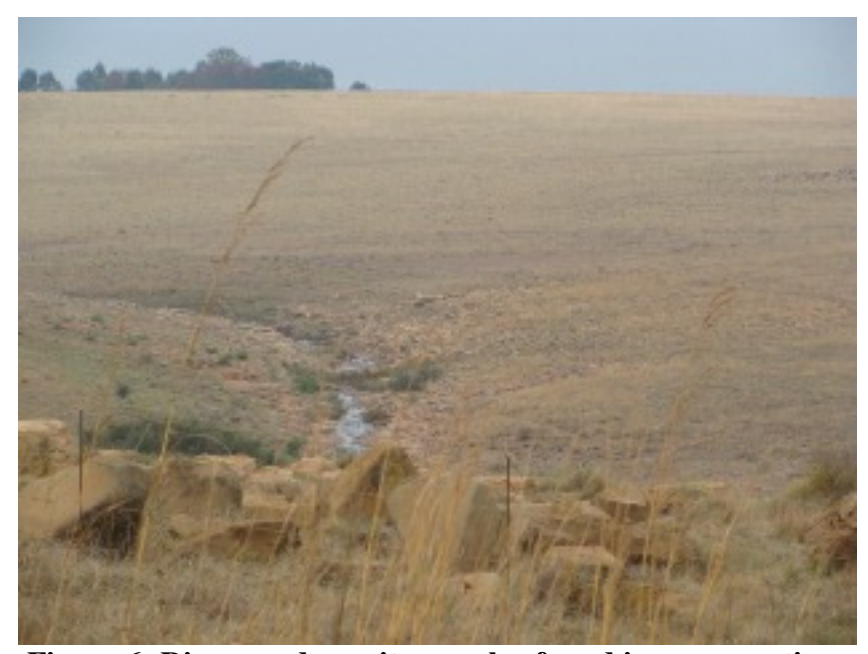
Figure 6: Rivers and spruite are also found in some portions where the proposed lines will run.