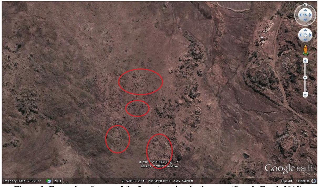
Figure 9: Examples of some of the Iron Age sites in the area (Google Earth 2012).