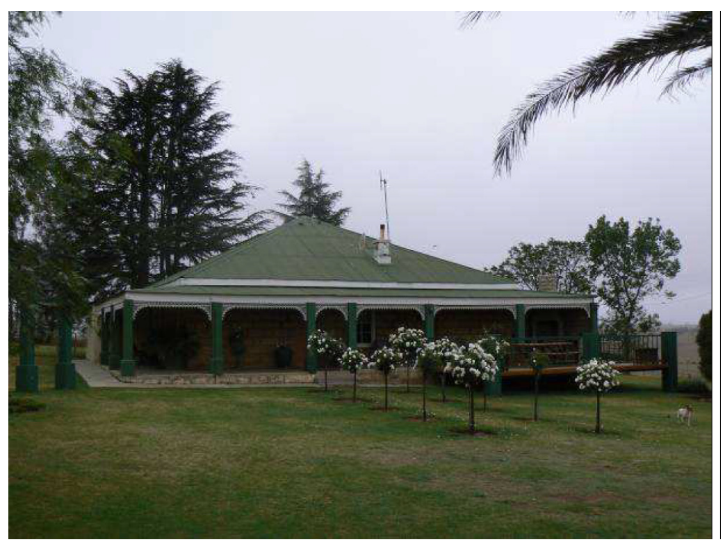
Figure 15: Old farmhouse on Leeubank farm.