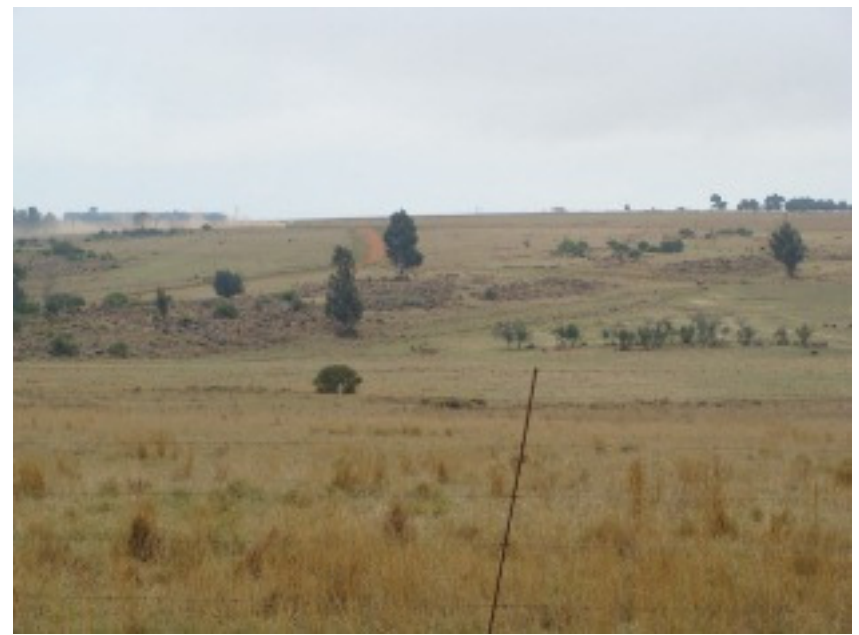
Figure 5: Some sections contain rocky ridges and low, rolling, hills.