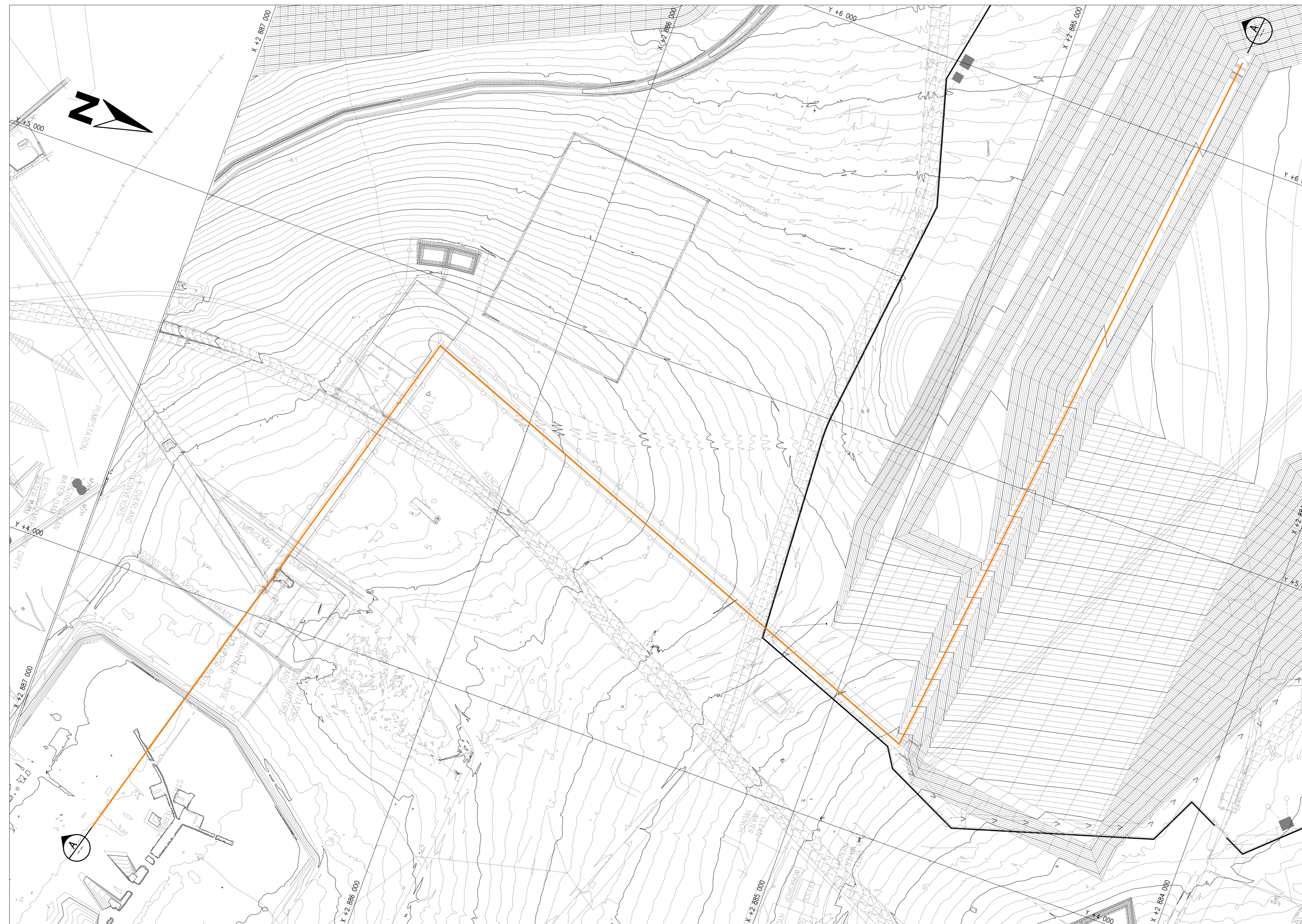
LAYOUT OF CONVEYOR ROUTE 1:5000