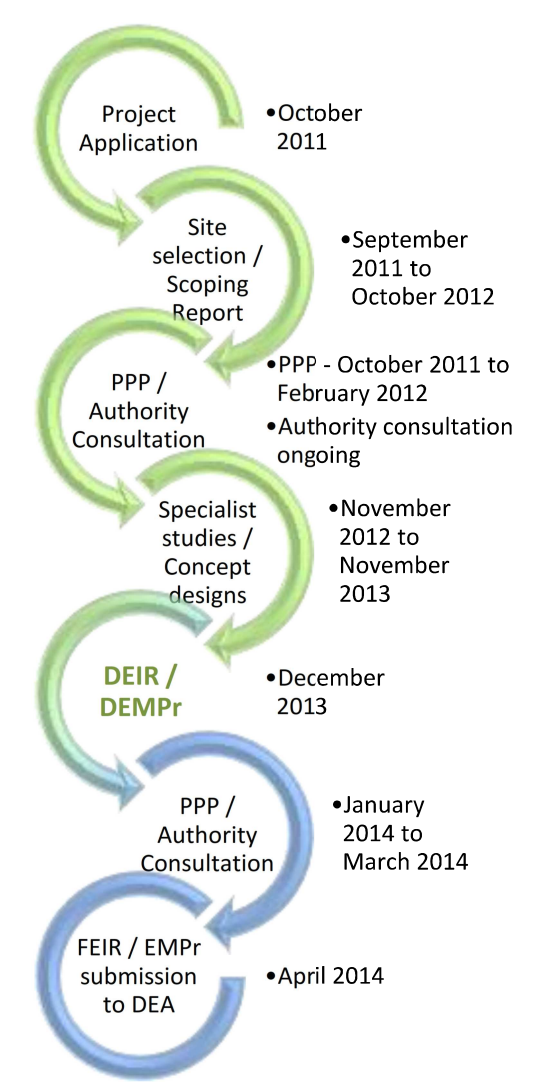
Figure 1: EIA process flow chart.

to finalise the Draft Environmental Impact Report (DEIR) and Draft Environmental Management Programme (DEMPr) in January 2014. You, as a Stakeholder, will be notified of the availability of these two draft documents for public review and comment.