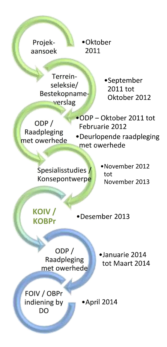
Figuur 1: OIE-proses Vloeikaart

word van die beskikbaarheid van hierdie twee konsepdokumente vir openbare besigtiging en kommentaar.