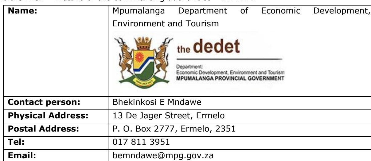
Table 2.5: Details of the commenting authorities – MDEDET

The Mpumalanga Department of Economic Development, Environment and Tourism (MDEDET) and the Department of Water Affairs (DWA) will act as a commenting authority for this application.