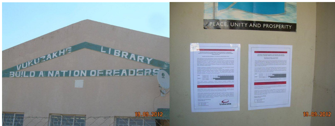
Figure 3.7: Vukuzakhe Library

A second round of advertisements will be published in order to notify the public about the availability of the Draft Scoping Report as well as inviting the public to attend the Public Meeting ( Appendix G ).