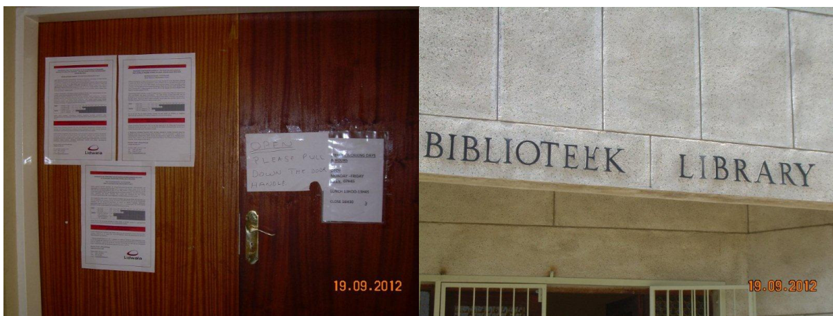
Figure 3.3: Amersfoort Library