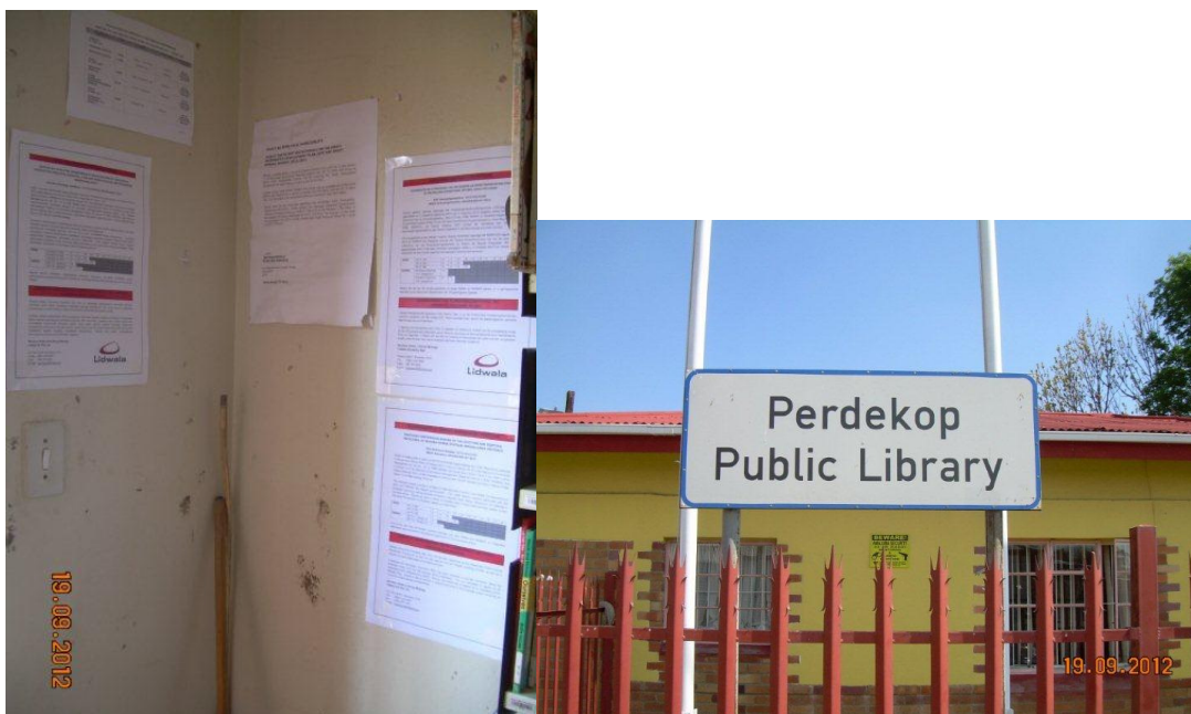
Figure 3.4: Perdekop Public Library