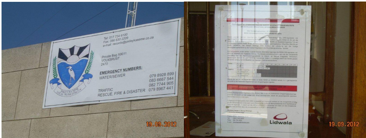
Figure 3.2: Amersfoort Local Municipal Offices