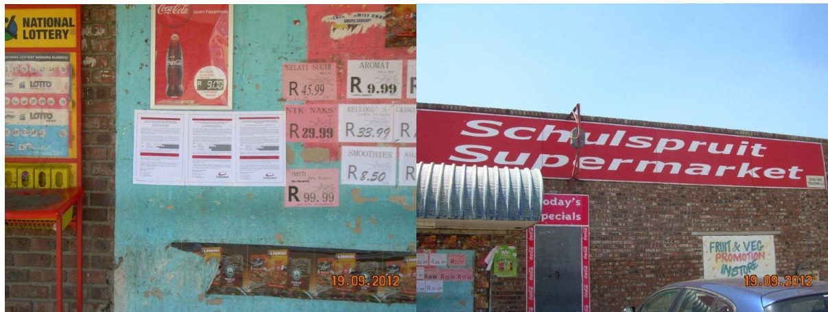
Figure 3.5: Schulspruit Supermarket