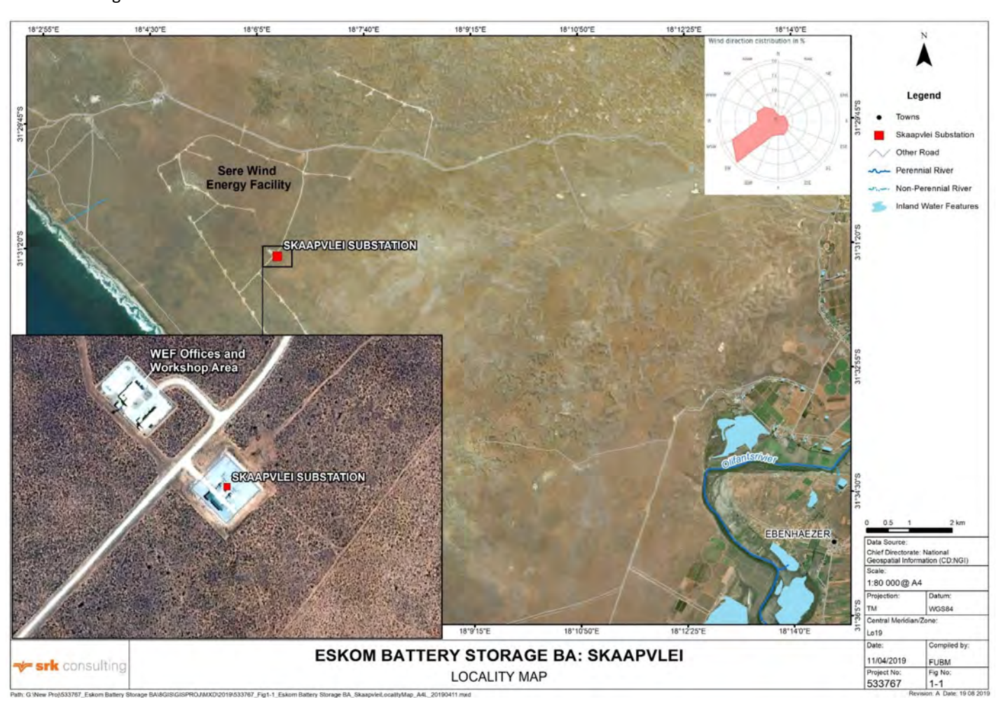
Figure 1: Locality Plan