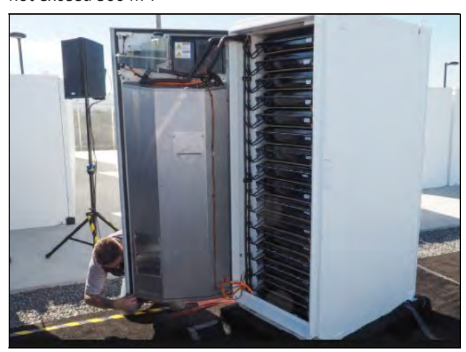
Figure 6: Solid state battery module

A single battery technology or combination thereof will be implemented at Skaapvlei. The chemical composition of the BESS can be hazardous (typically comprised of a blend of one or more of the hazardous substances listed in SANS 10234), and the batteries will therefore be stored in intermodal containers (or similar) in a bunded area. The design capacity of the BESS to store dangerous goods will not exceed 500 m<sup>3</sup>.