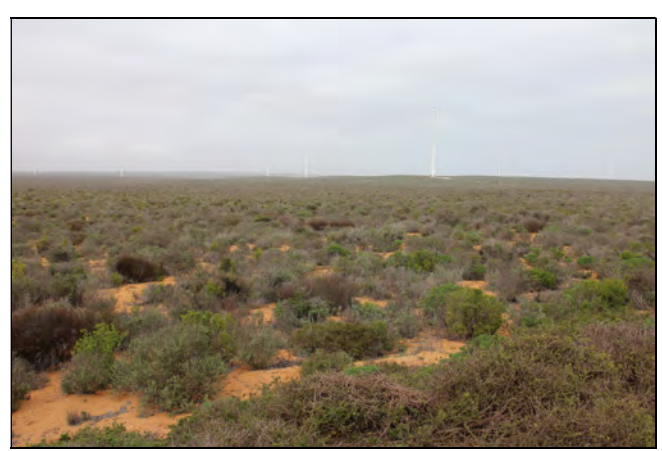
Figure 4: Typical vegetation in the project area