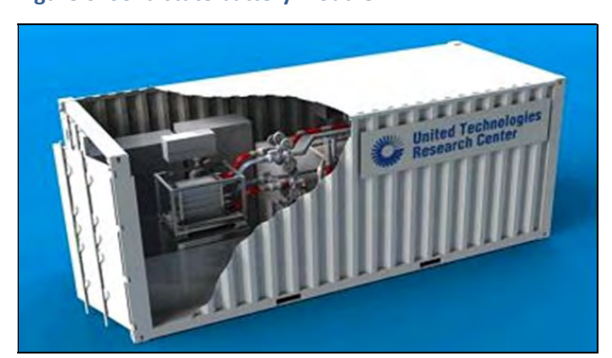
Figure 7: Flow battery storage container

Eskom is proposing two layout alternatives: