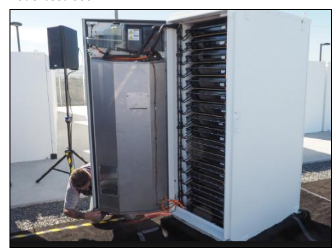
Figure 6: Solid state battery module

A single battery technology or combination thereof will be implemented at Skaapvlei. The chemical composition of the BESS can be hazardous (typically comprised of a blend of one or more of the hazardous substances listed in SANS 10234), and the batteries will therefore be stored in intermodal containers (or similar) in a bunded area. The design capacity of the BESS to store dangerous goods will not exceed 500 m<sup>3</sup>.