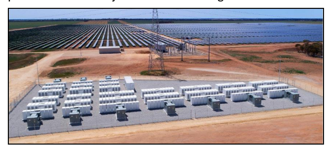
Figure 5: Example of a BESS

A platform of ^{\sim}2.1 ha will be constructed south of the Substation to accommodate the BESS containers (see example of a BESS, Figure 5). The BESS platform may be an extension of the Substation platform or may be a separate platform located adjacent to the existing Substation.