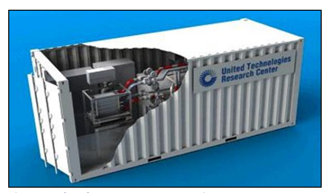
Figure 7: Flow battery storage container

Eskom is proposing two layout alternatives: