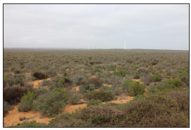
Figure 4: Typical vegetation in the project area