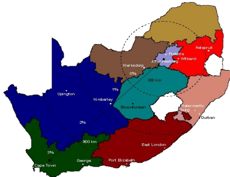
Figure 1: Transmission zones for loads