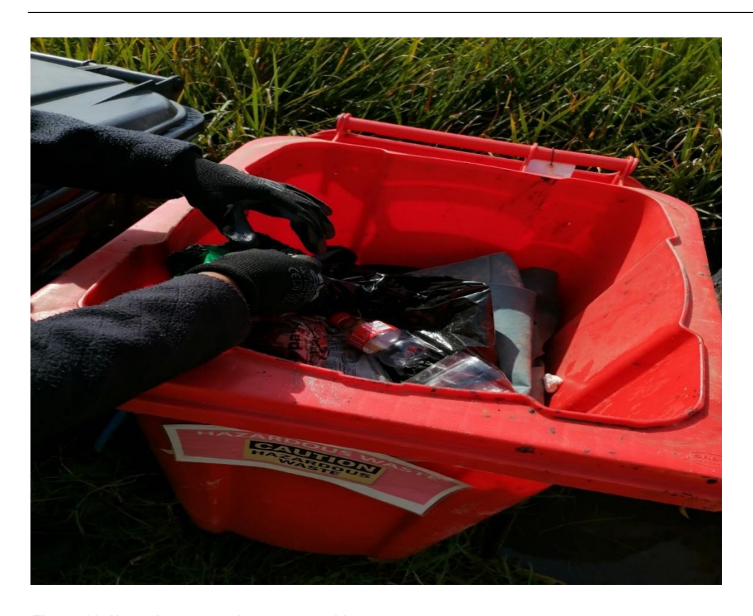
Figure 11: Hazardous waste in a separate bin