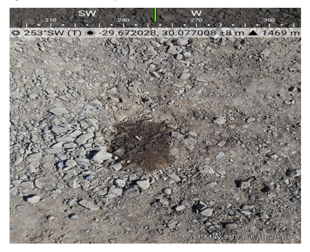
Figure 12: Showing the minor oil spill observed from a TBL on side