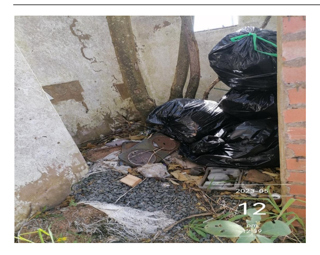
Figure 7: Evidence of lack of general waste good management and no good house keeping