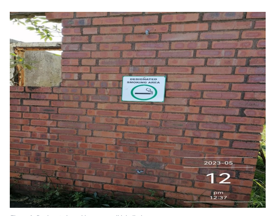
Figure 2: Designated smoking area well labelled