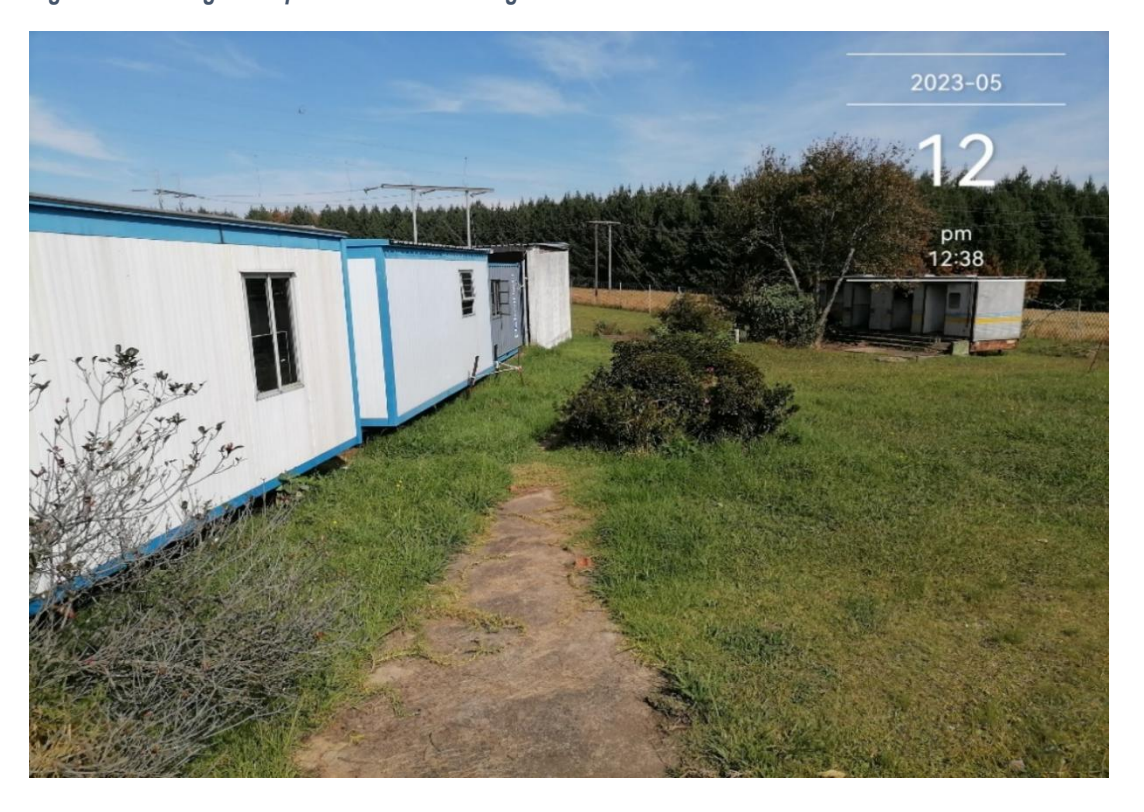
Figure 6:Site Garden not maintained