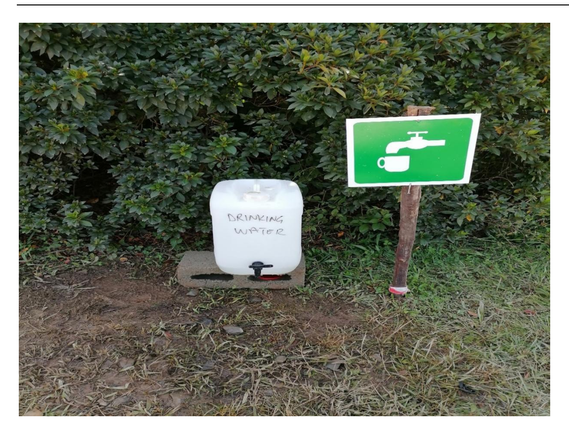
Figure 5: Drinking water placed for the working team