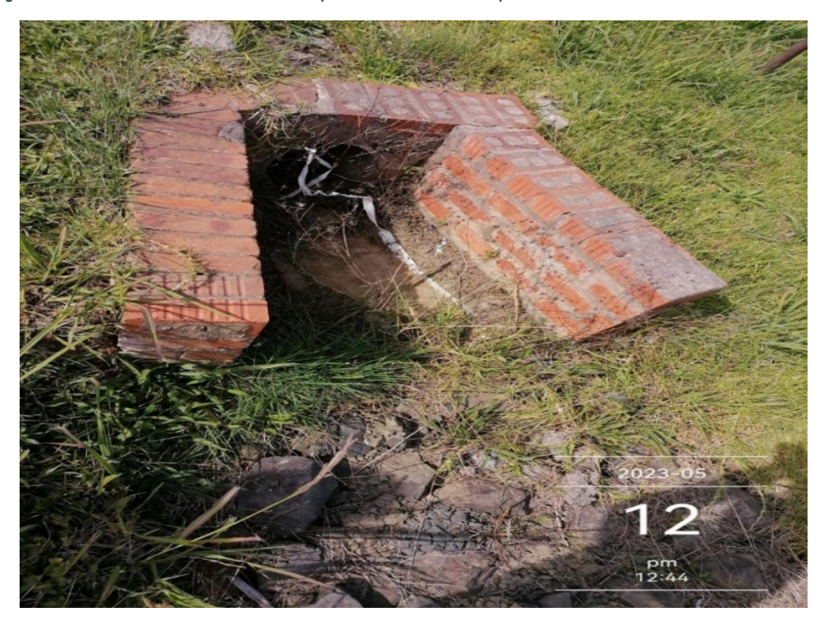
Figure 10: Evidence of storm water drainage kept clean and clear of blockage material