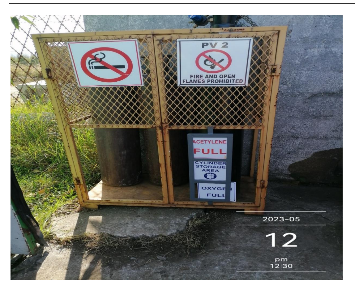
Figure 3: "No open flame" signage and cages well secured