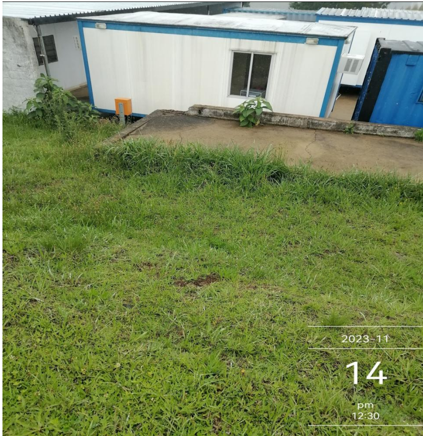
Figure 9: Garden Maintenance not carried out