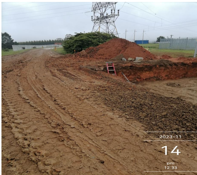
Figure 4: Topsoil not separated, heaped and covered as required