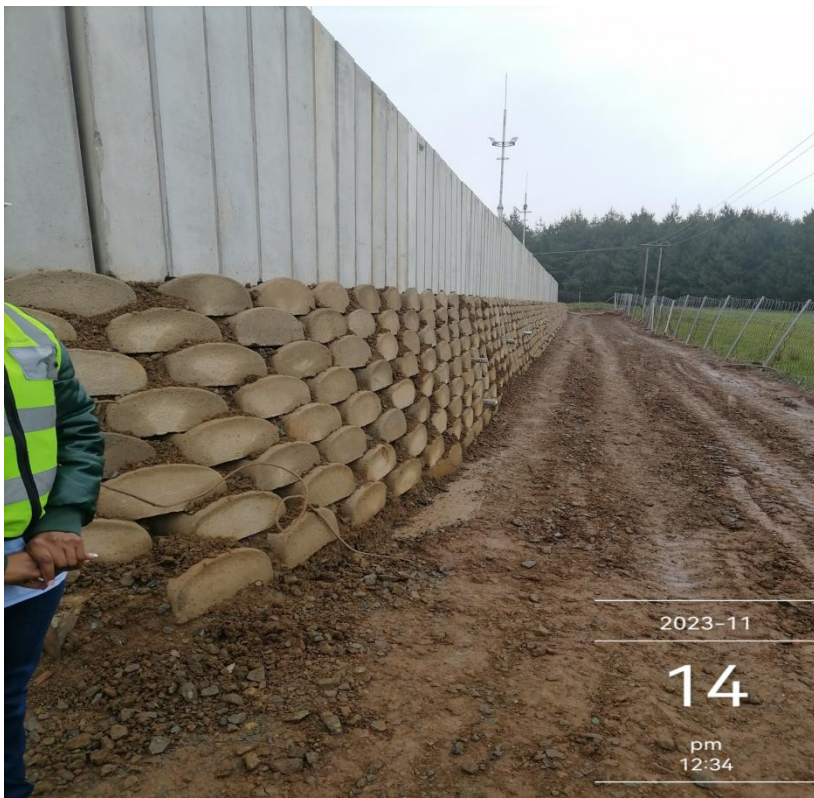
Figure 2: Precast walls securely installed around the BESS