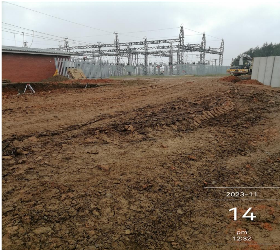
Figure 11: Muddy surfaces to be carefully observed