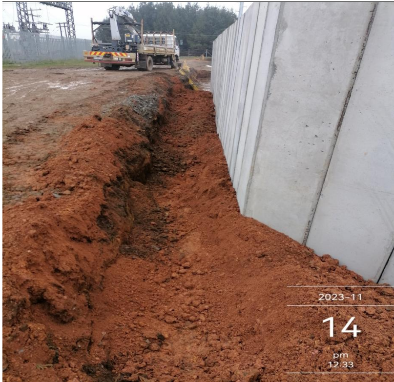
Figure 3: Trenches without demarcation tapes