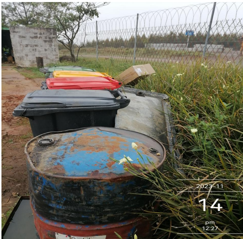
Figure 10: Waste management bins clearly marked and secured