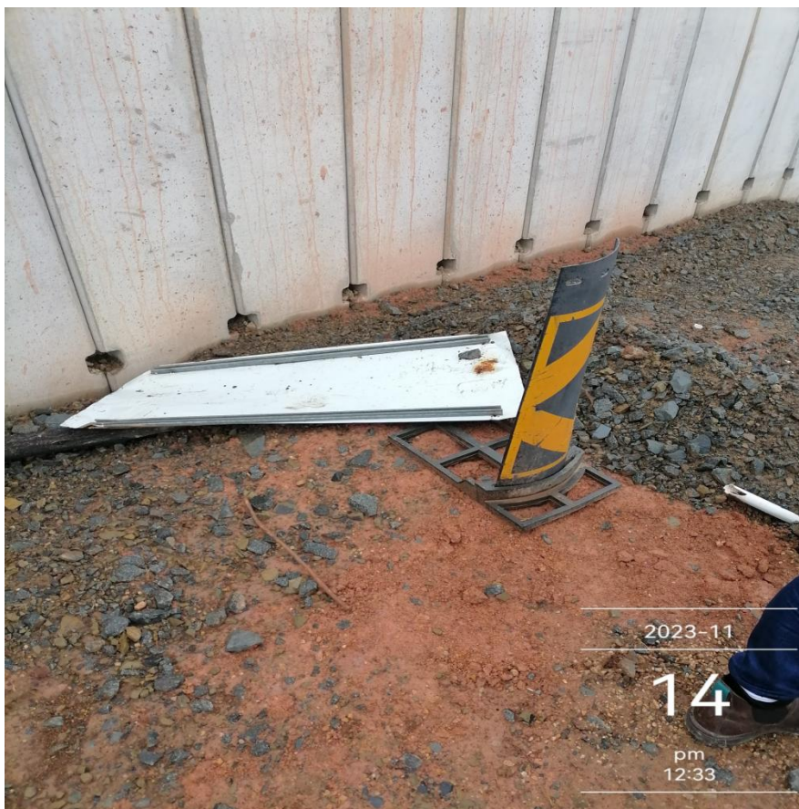
Figure 12: Precast walls fitted and installed