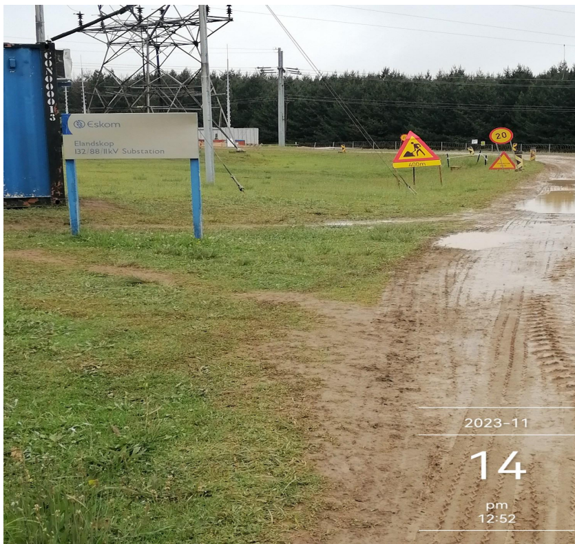
Figure 7: On site signage well placed and visible