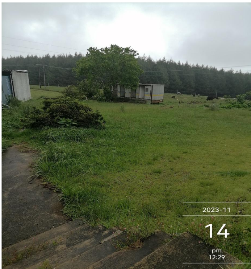
Figure 6: Evidence of lack of garden maintenance within the precinct