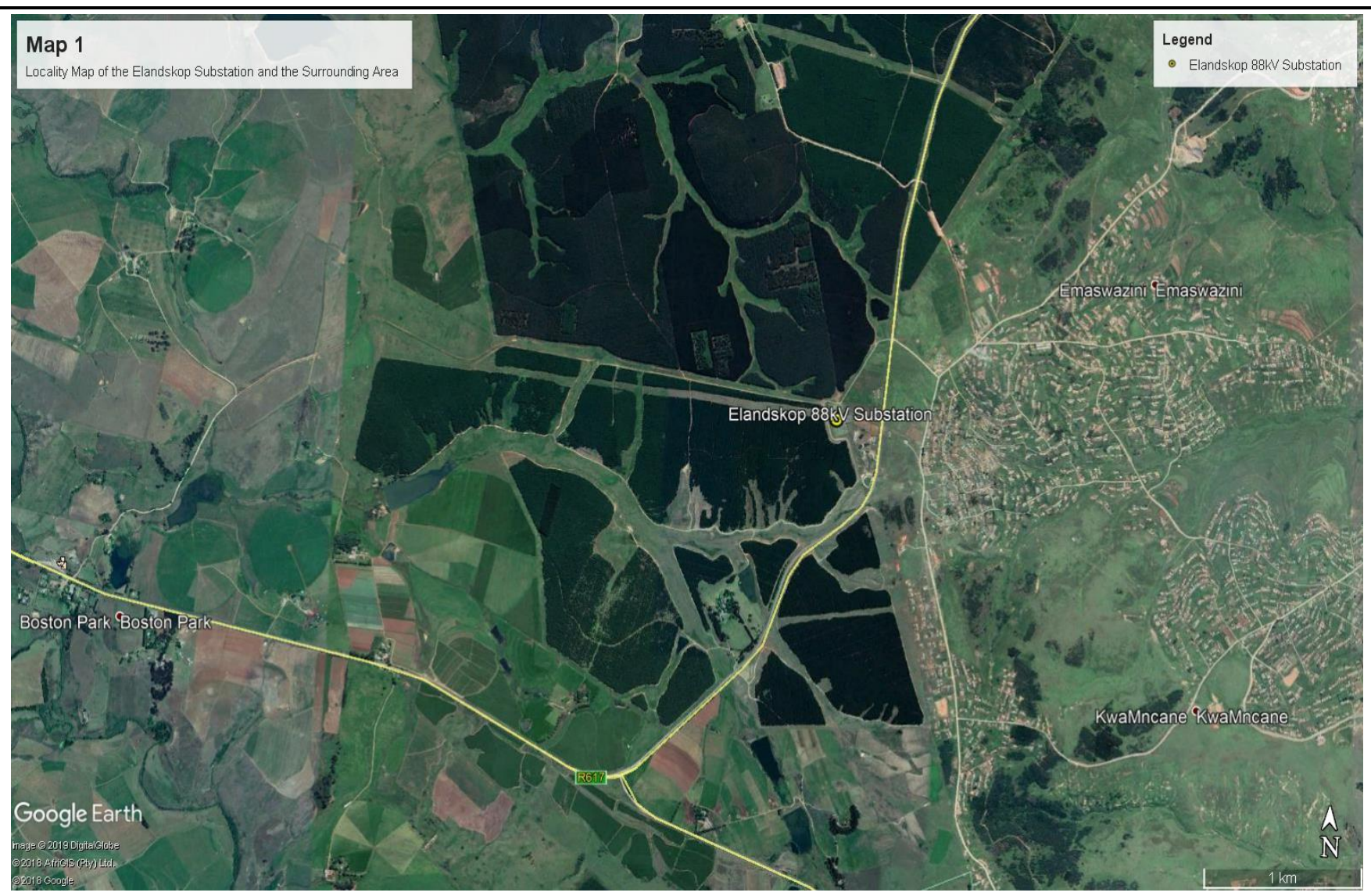
Figure 1: Greater Msunduzi Municipality and Proposed Site Location (Pointed out in Yellow), (Google Earth Imagery, 2018)