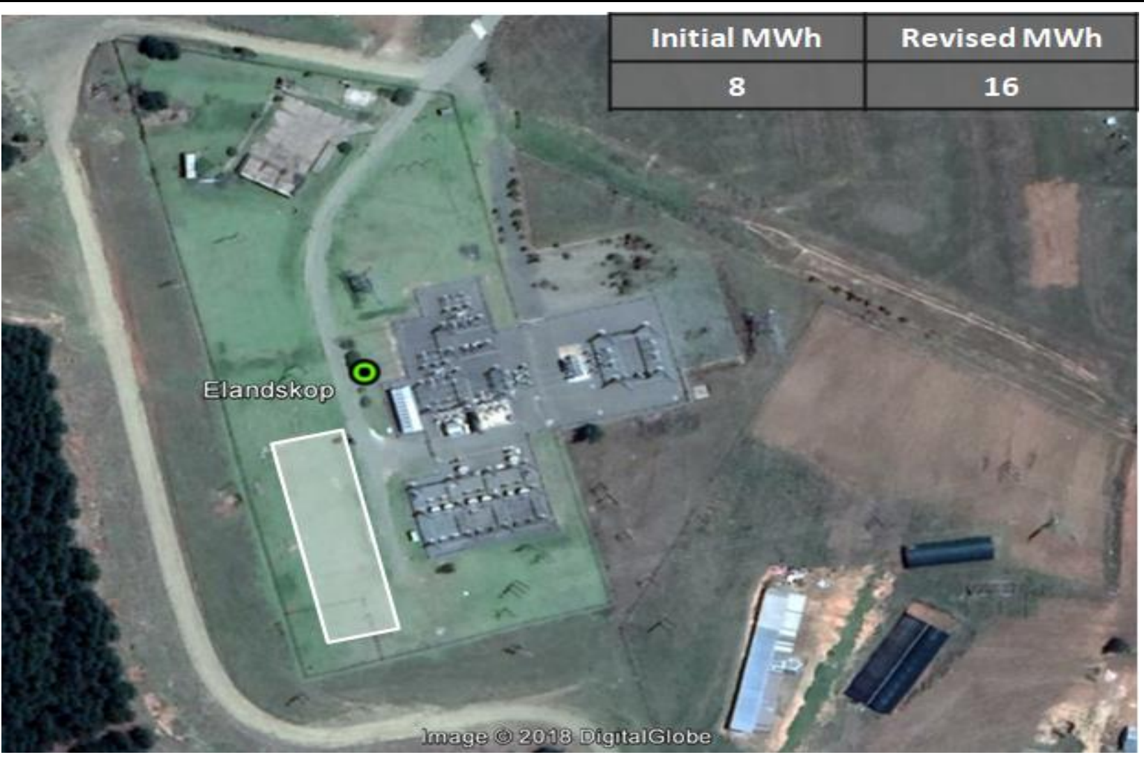
Figure 3: Elandskop Substation and Proposed Area for BESS (white), (Eskom, 2019)