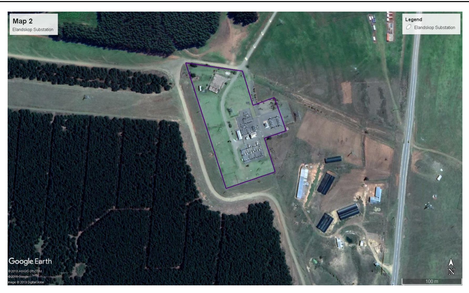
Figure 2: Elandskop Substation (Purple), (Google Earth Imagery, 2018)