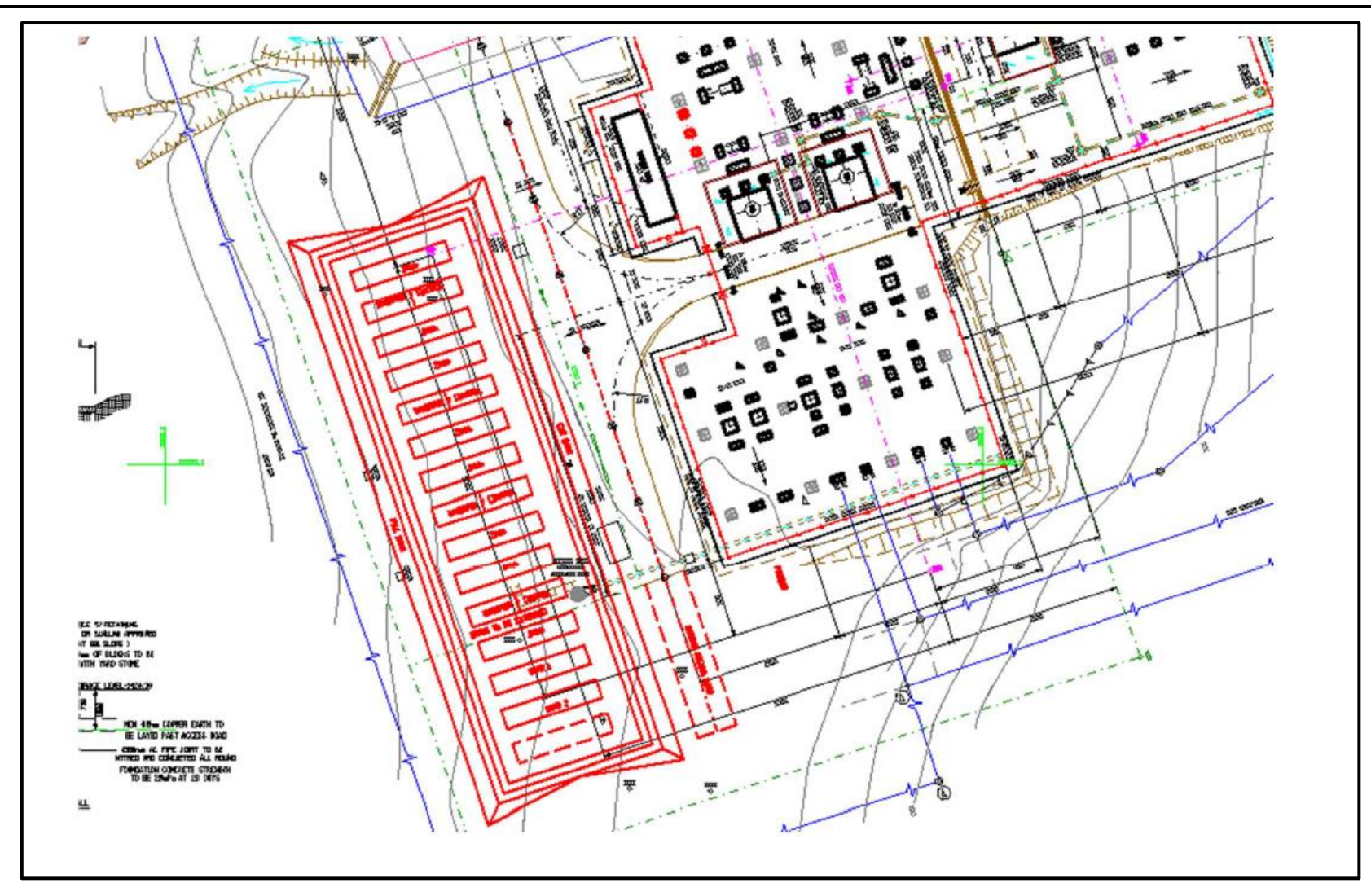
Figure 4: Conceptual Design of the Elandskop Substation and Proposed Area for BESS (Red), (Eskom, 2019)