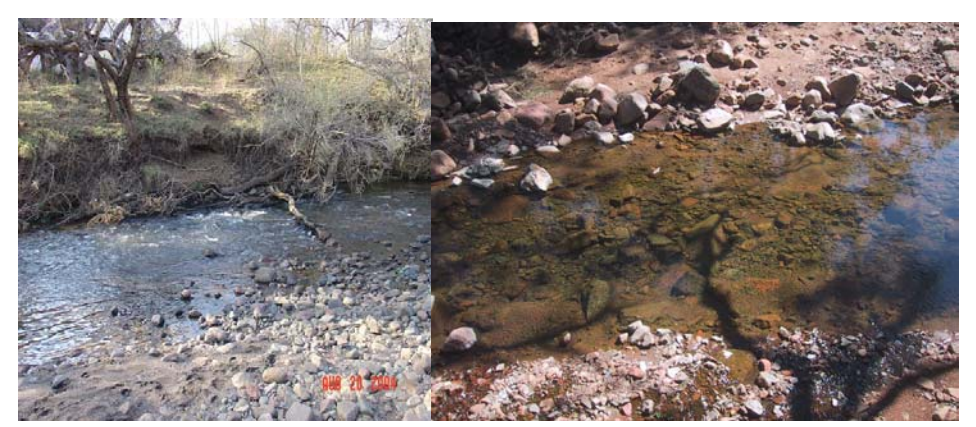
Photograph 6.5: Klip River streambed (left) tributary at Site A (right)