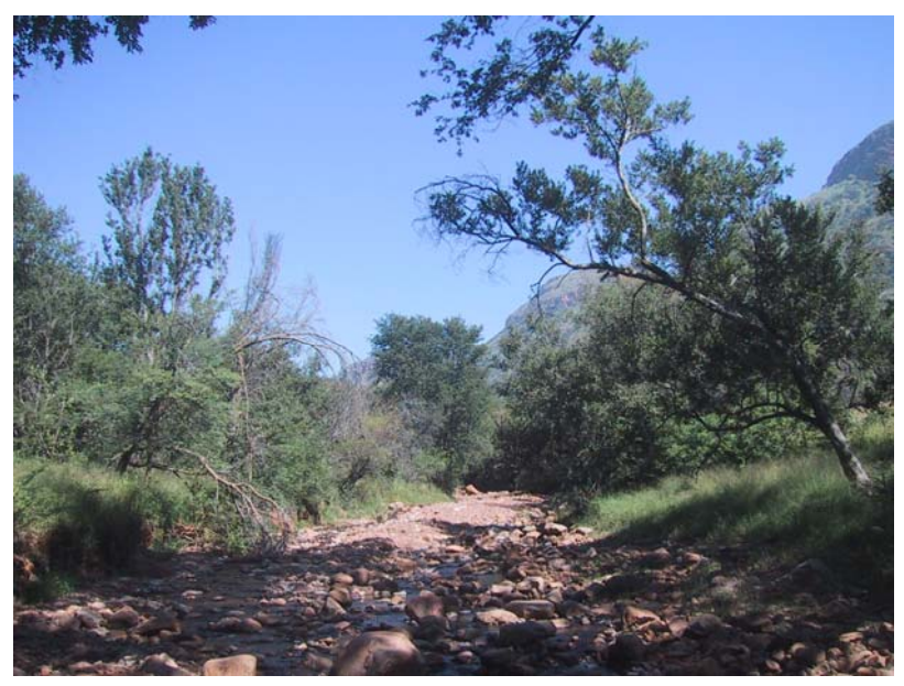
Photograph 6.1: Habitat for amphibians (Tributary at Site A Lower)

Draft Environmental Scoping Report for the proposed pumped storage power generation facility in the Steelpoort area, Limpopo and Mpumalanga Provinces