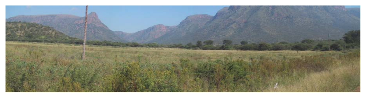
Photograph 6.2: Panorama of Site A Lower Dam

Four of the five vegetation communities occur here (nr. 1, 2, 3, 4) (see Photograph 6.2). The dominant vegetation communities are community 2 and 3. Only a small patch of community 4 is present on the site and the riverine areas are represented by community 1. Community 2 is very important due to the high number of species of concern that may utilise this community. The site has been disturbed in some areas due to the construction of electricity lines and other infrastructure. The disturbance is however limited to these areas and therefore localised.