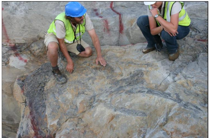
Dr Gideon Groenewald inspecting a fossilised tree still buried in the rock

Over sixteen kilometers of tunnels were excavated at Ingula. This was done by blasting and removing rock with big excavation machines. Were it not for the blasting, the fossils would never have been discovered. As layer by layer of rock was exposed, amazing fossils were exposed, revealing clues about what the area looked like millions of years ago. A sandstone layer contained large tree fossils followed by layers of mudrock with coalified wood, infused with pyrite, which looks like gold when freshly exposed. Most of the fossils were found in mudrock, a very brittle type of rock. Any finds had to be treated with a sealant to prevent it from disintegrating.