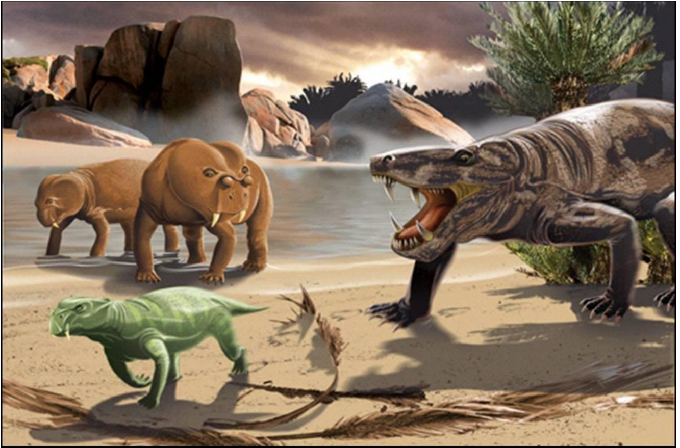
An artist's impression of life, at the end of the Permian period. Dicynodon in the background, Lystrosaurus in foreground and Gorgonopsian on the right.