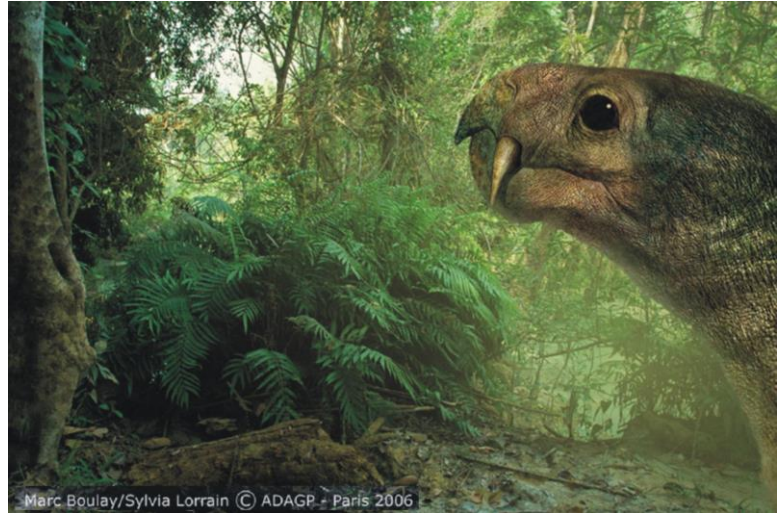
An artist's impression of life during the Permian Period

Early reptiles were well placed to capitalize on the new environment. Shielded by their thicker, moisture-retaining skins, they moved in where amphibians had previously ruled. Over time, they became ideally suited to the desert-type habitats in which they thrive today.