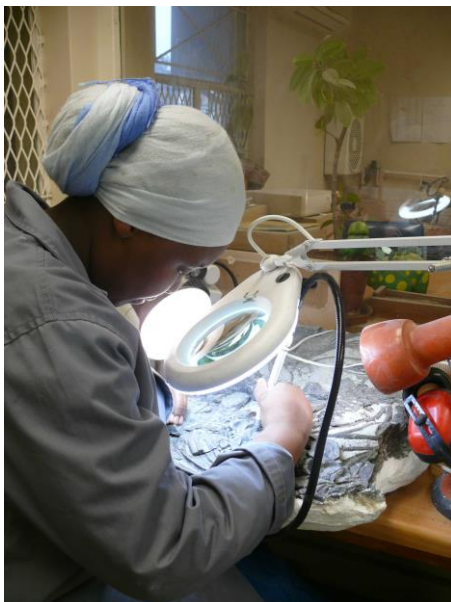
Careful preparation of Ingula's fossils at Bloemfontein National Museum

During February and early March 2010 excavation reached a layer which, it is believed, contained evidence of Dicynodon lacerticeps – a plant eating mammal-like reptile of the Permian period. It also contained plant fossils, predominantly smaller samples of the Glossopteris family. These were taken to the Bernard Price Institute for Paleontological Research at WITS University for further examination. Samples were sent to the National Museum in Bloemfontein for recording, curating and display.