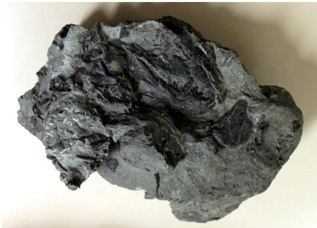
Possible dicynodon tusk unearthed at Ingula

The likelihood that new species of animal might be present has not been ruled out. The Museum appointed additional staff to prepare the large quantity of material from Ingula.