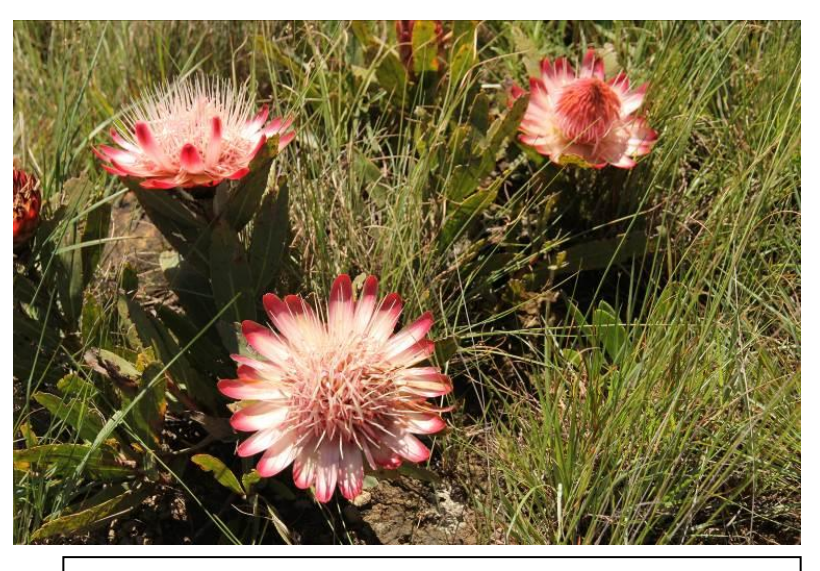
Endemic Drakensberg Sugarbush at Ingula's upper site

The site aims to be an internationally renowned sustainable nature reserve and all activities on site are carried out with this long-term objective in mind. Due to the sophisticated Environmental Management Plan that governs all activities on site, Ingula was the first Eskom construction site to receive ISO14001 certification in March 2011.